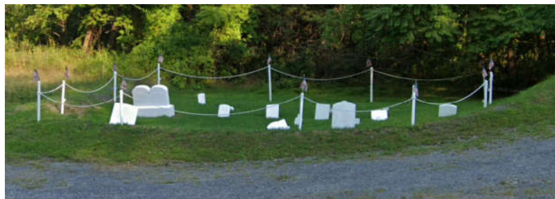
Figure 3. The Gardiner Family Cemetery off US Route 9W, along a proposed access road near Station 70337+00.

adjacent to Site 03904.000043, the Gardiner Cemetery (Site 33). The family cemetery was utilized between about 1844 and 1897 by the Gardiner family whose farm was nearby.