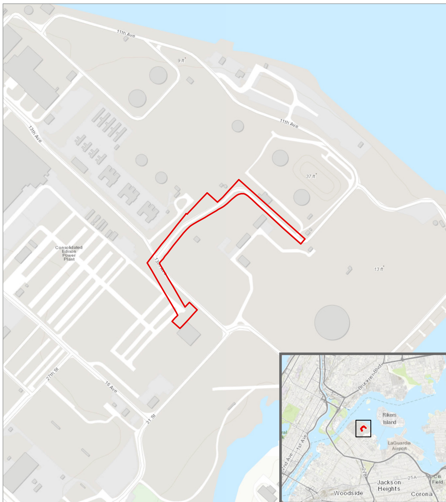
Figure 1. Segment 21 Regional Project Location