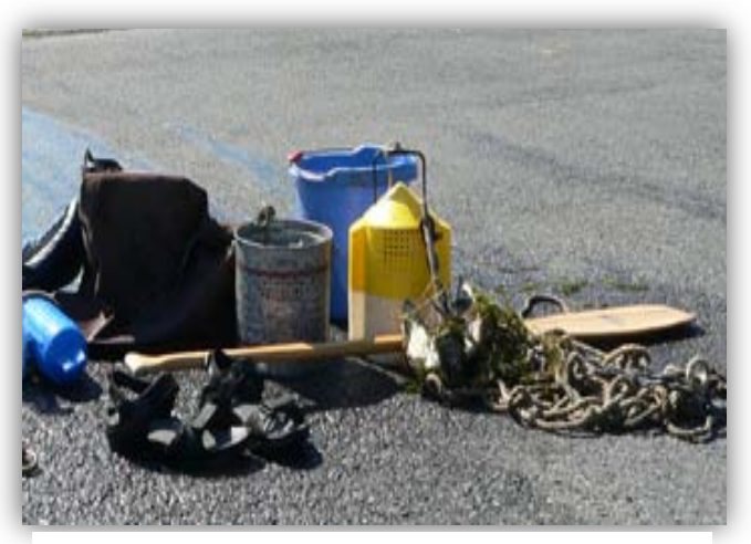
Drying equipment for a minimal period of 5 days can be an effective method of preventing the spread of invasive species.