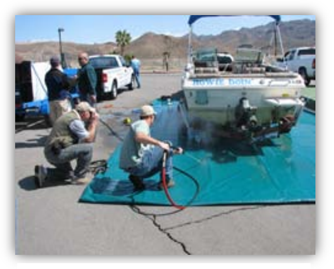
Cleaning boats and equipment before leaving the landing is an important step that citizens can take to prevent the spread of invasive species (Photo credit: Aquatic Nuisance Species Project).

Minimum water pressure for vehicle cleaning should be at least 90 pounds per square inch. Water can be supplied as high volume/low pressure or low volume/high pressure. Each option has advantages and disadvantages based on specific cleaning needs and water availability: