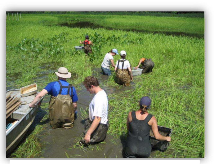
Personal gear, including waders, can introduce aquatic invasive species into new locations if not properly cleaned following use.

NOTE: Felt-soled waders and wading shoes, which have been identified as a vector for whirling disease spores and Didymo , are difficult to disinfect. Rubber or studded soles are now readily available that provide similar traction, and are much less likely to transport invasive species.