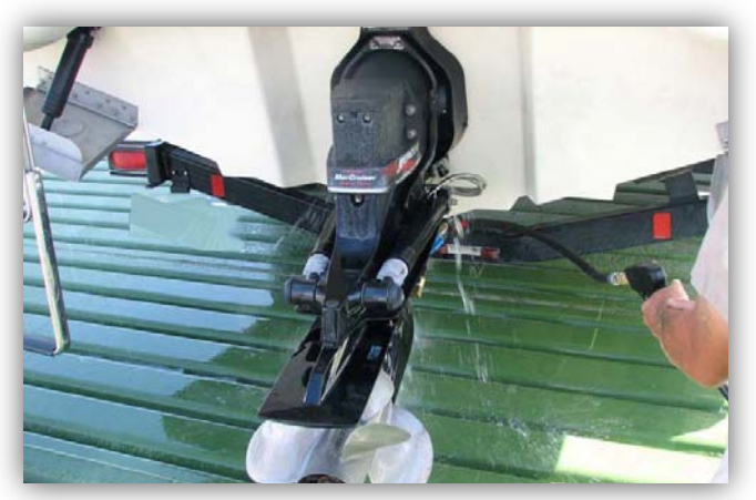
Invasive species can become trapped in watercraft engines and transported to new locations. Proper engine flushing is recommended to prevent future invasions.

When inspecting and cleaning, special attention should be given to the cracks and crevices in which material may become trapped as well as aquatic plants or fragments that may be present on trailers or propellers. Particular attention must be paid to trailer pads made of carpet and foam rubber, which could trap invasive species. If possible, such material should be removed from trailers before doing work in infested waters.