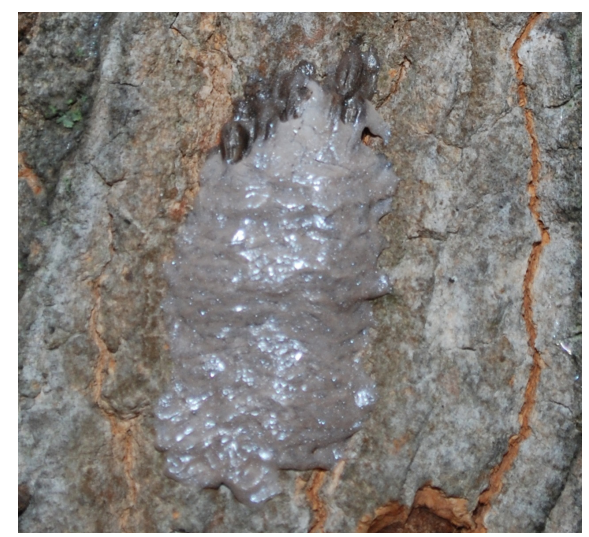
Spotted lanternfly egg mass.

Spotted lanternfly adults are very colorful when their interior hind wings are displayed. The hind wings are red with black spots. They have a black head, and a yellow abdomen with black bands. Their beige-gray forewings have also black spots and a distinctive black brick-like pattern on the tips. There is one generation per year, with adults developing in the summer, laying eggs in the late summer through fall, and overwintering as eggs. Each egg mass normally contains 30-50 eggs which are laid in rows and usually covered in a waxy substance. The first nymphs to hatch from the eggs in the spring are wingless, black, and have white spots, while the final nymph stage turns red before becoming winged adults. Adult males are slightly smaller than the inch-long females, but are almost identical in appearance. Adults and nymphs commonly gather in large numbers on host plants to feed, and are easiest to see at dusk or at night.