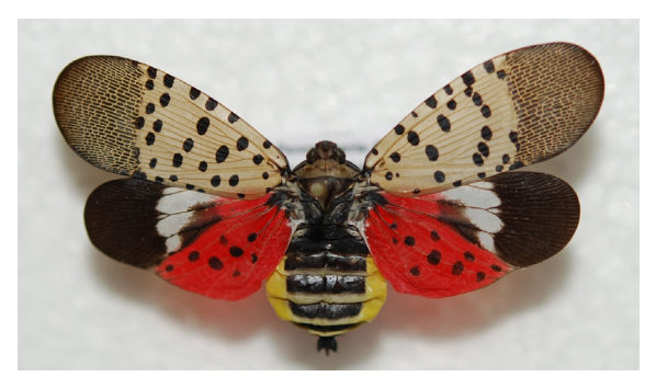
Collected spotted lanternfly adult with wings spread. The yellow sides of the abdomen are visible because this is a mated female, full of eggs.