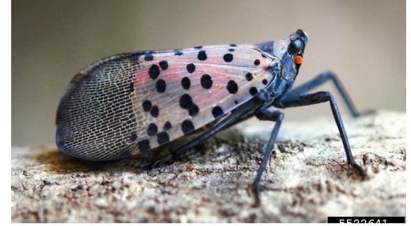
Spotted lanternfly adult at rest on a branch.

PennState Extension: Spotted Lanternfly extension.psu.edu/spottedlanternfly