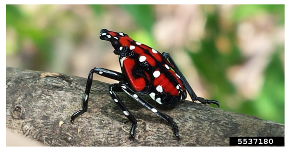
The final nymph stage of the spotted lanternfly, shown on a branch, is distinctively colored.