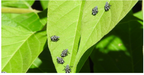
The black and white nymphs as they appear after hatching in the spring until their third molt in midsummer.