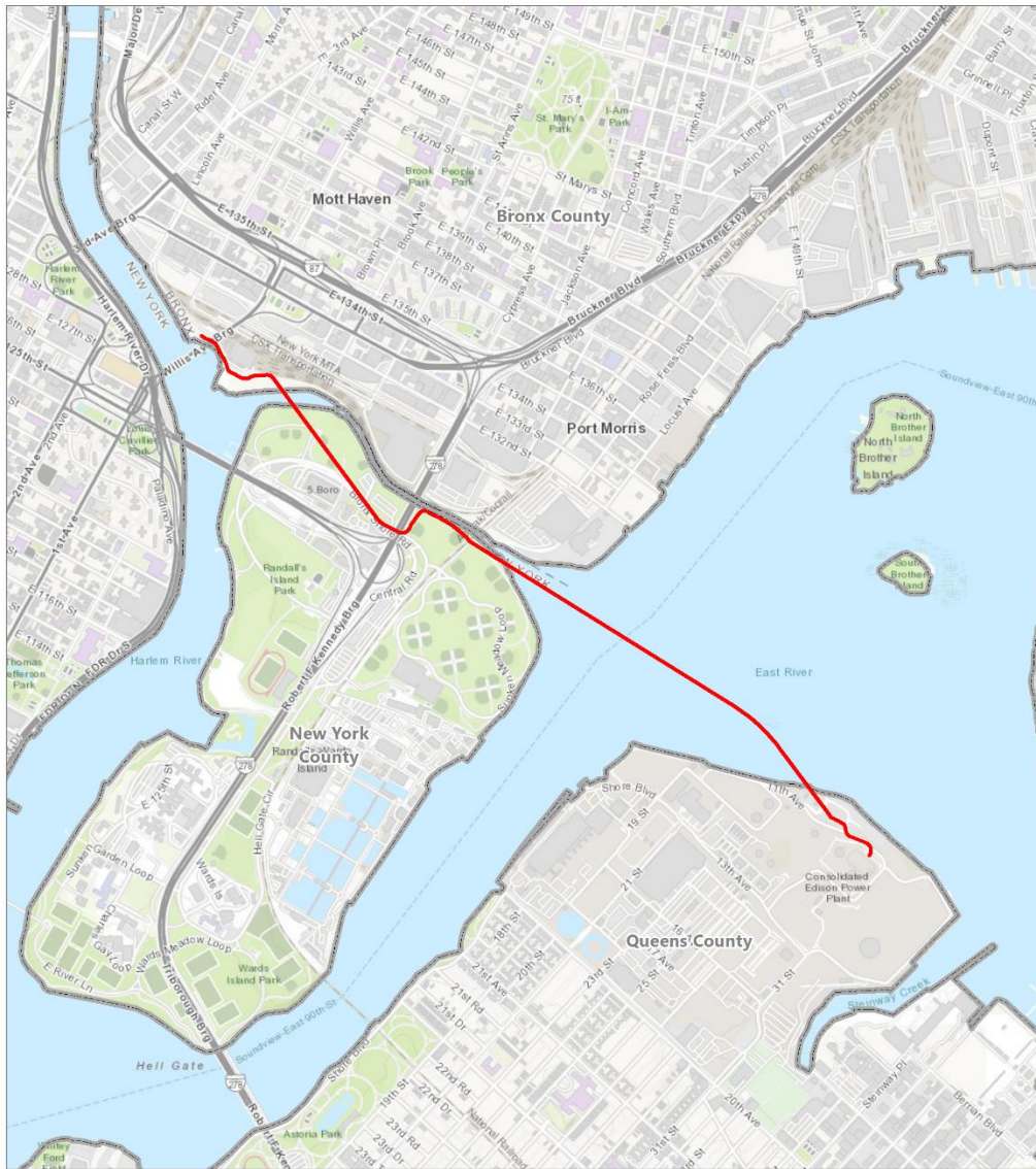
Figure 1. Segments 13-15 Regional Location Map