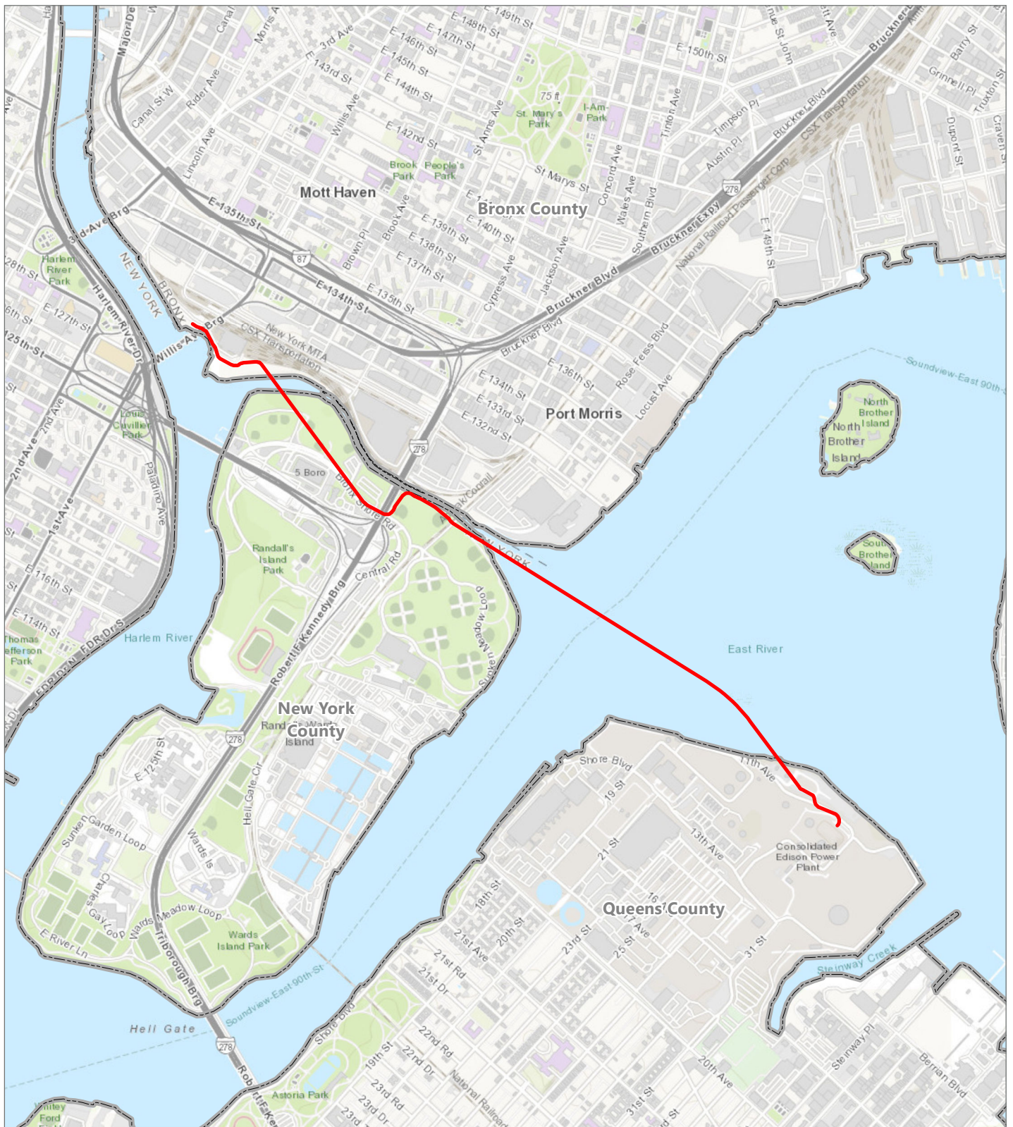
Figure 1. Segments 13-15 Regional Location Map

Bronx, New York, and Queens County, New York