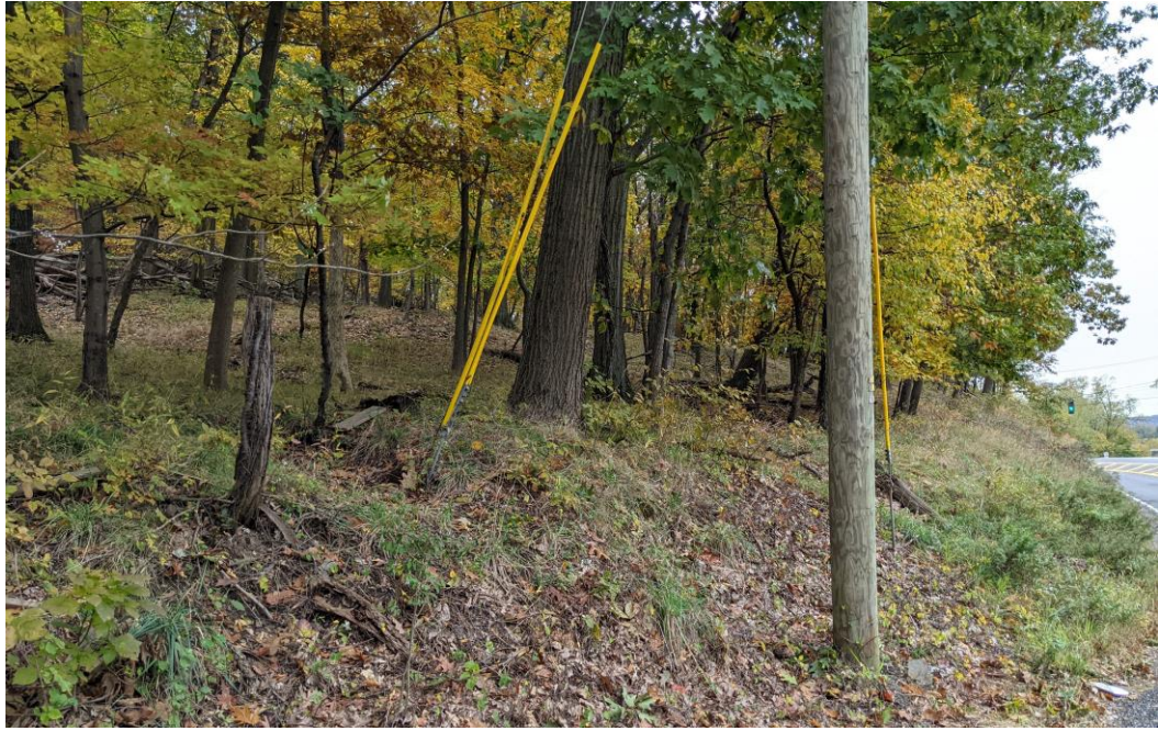
Wetland B (Haverstraw)- Upland View