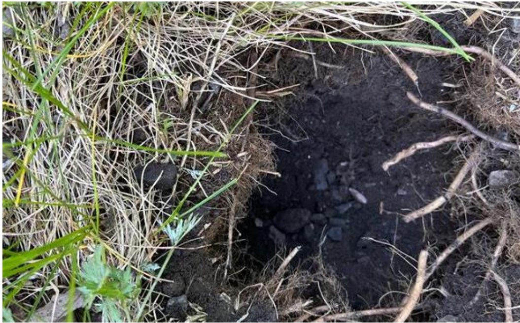
Wetland D (Haverstraw)- Upland Soil View