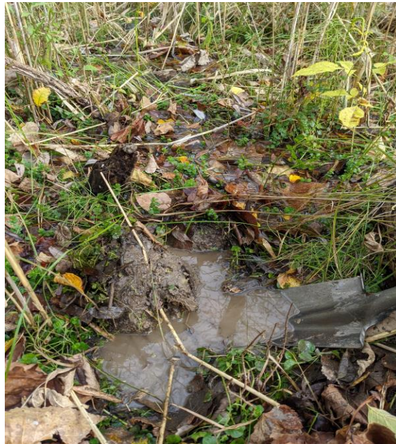
Wetland D - Soils