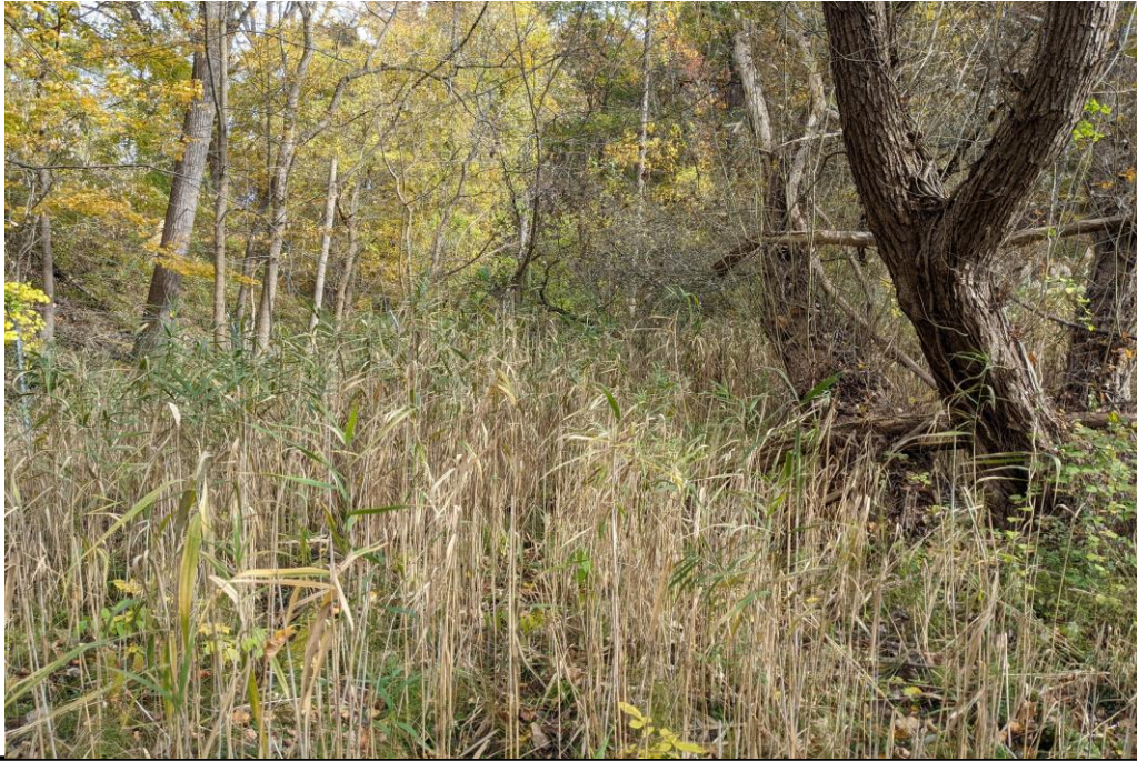
Wetland D - View facing East