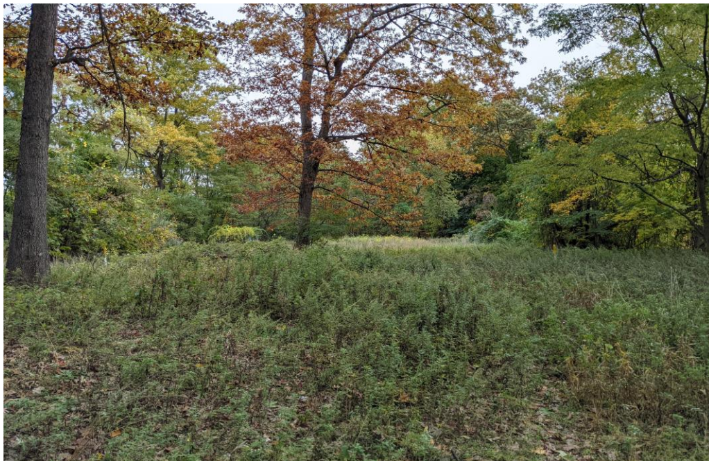
Upland C - View facing West