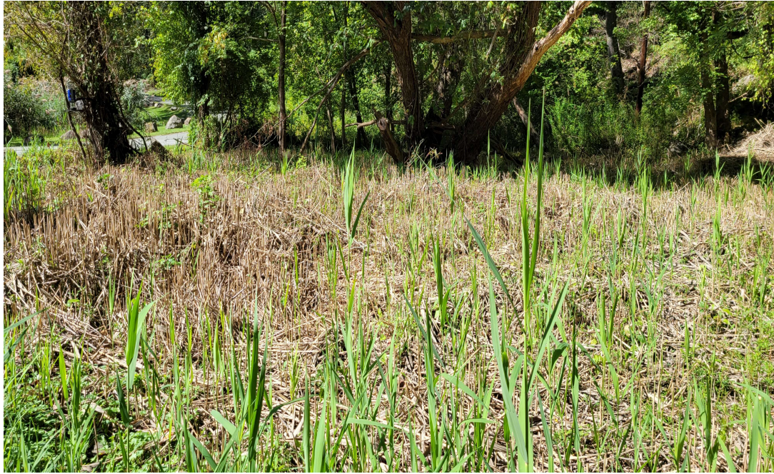
Wetland D1-1- View facing northeast