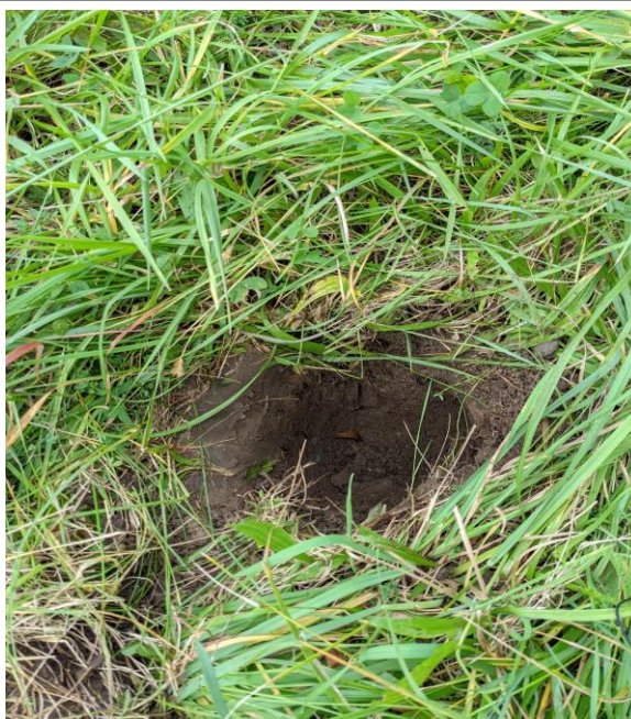
Upland C - Soils