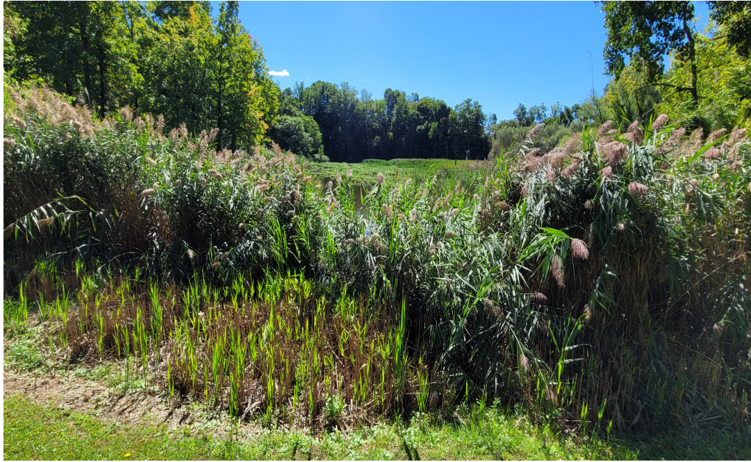
Wetland D4A- View facing east