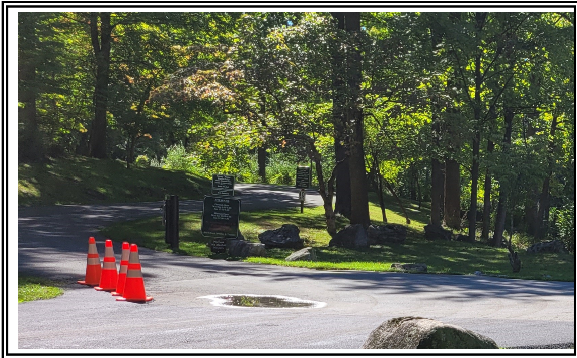
Upland D1- View facing east