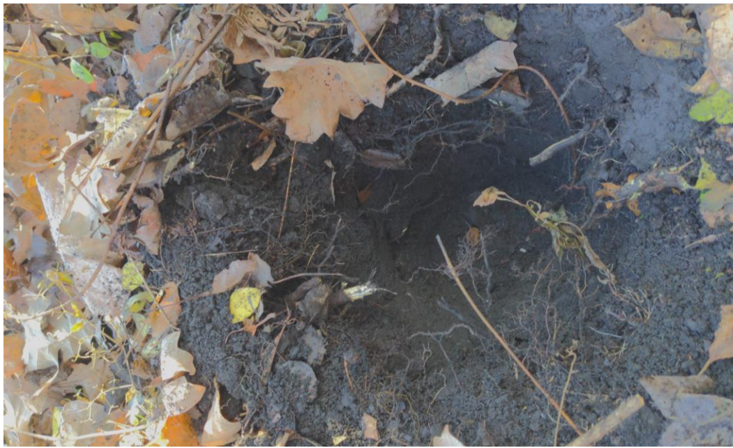
Wetland B (Haverstraw)- Upland Soil View