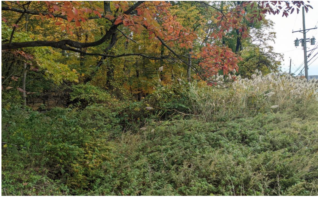
Wetland B (Haverstraw) View facing Northeast