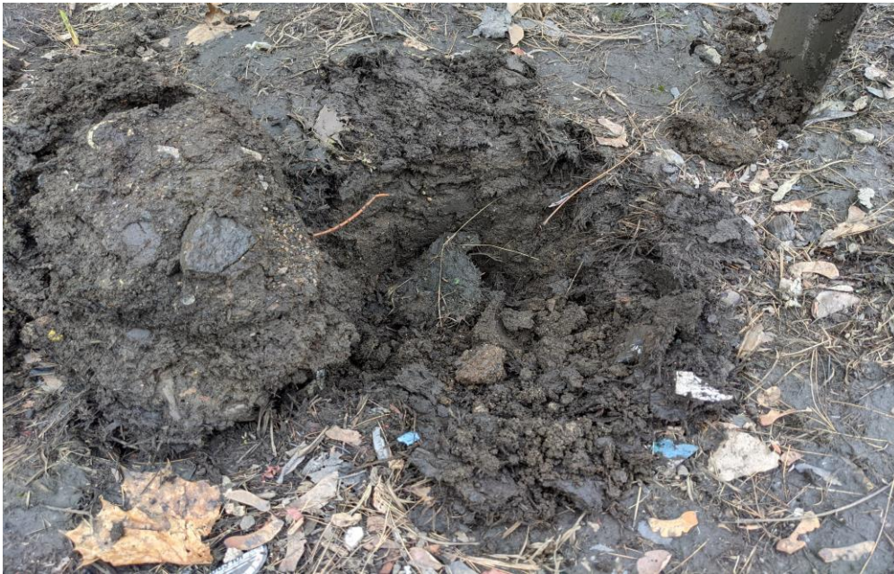
Wetland B (Haverstraw) - Soils