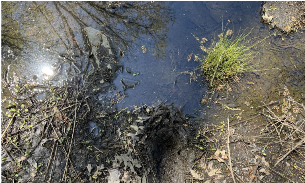
Wetland C (Haverstraw)- Soil View