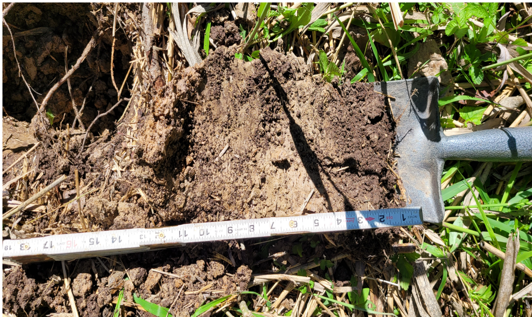
Wetland D1-1- Soils