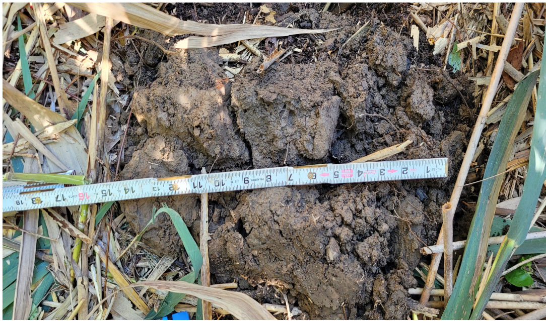
Wetland 7B-B- Soils