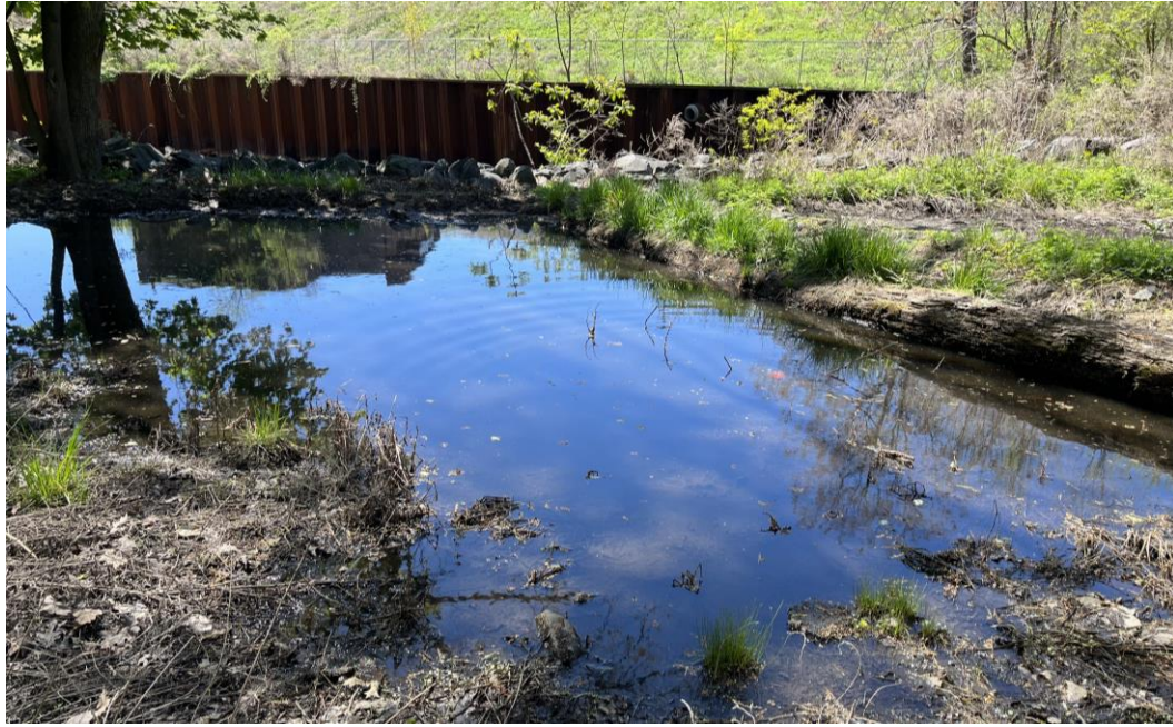
Wetland C (Haverstraw)- Wetland View