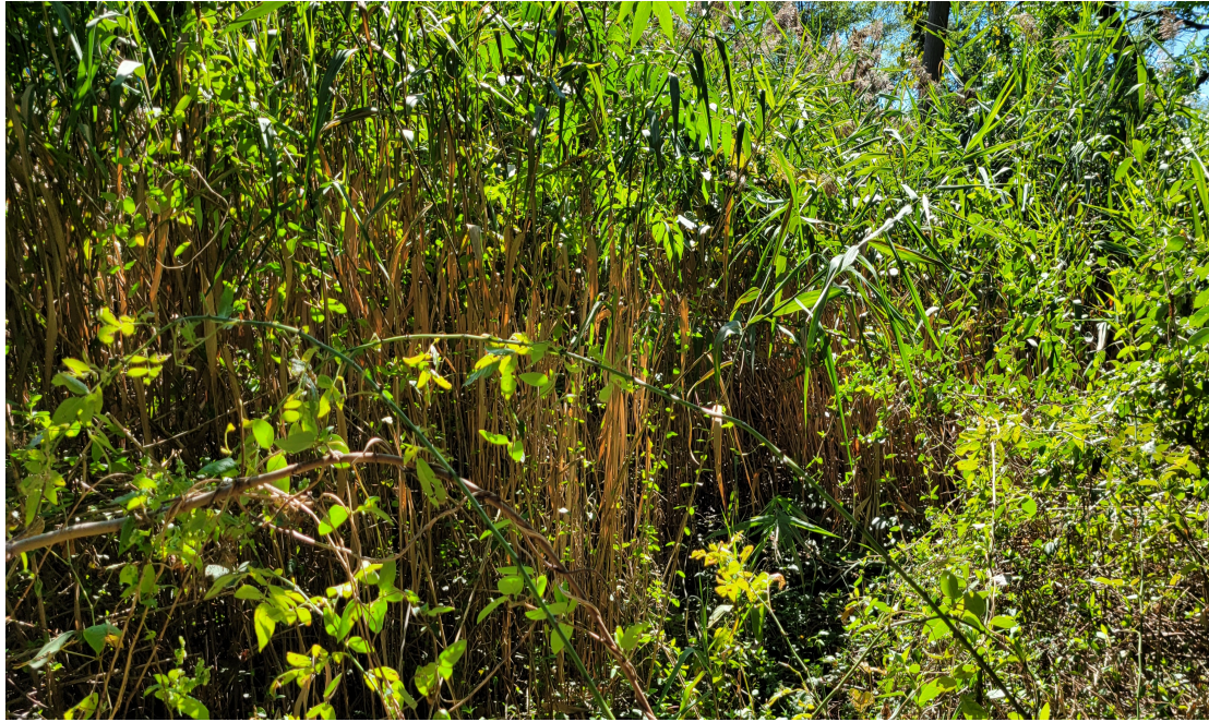
Wetland 7B-B- View facing west