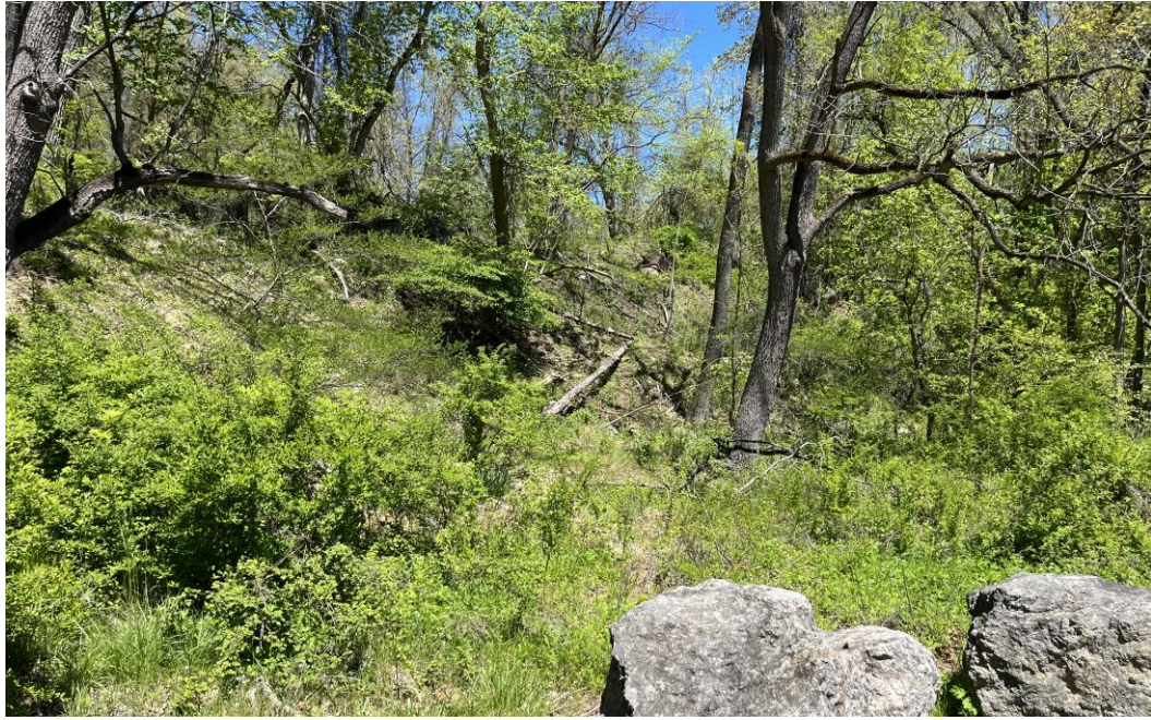
Wetland D (Haverstraw)- Upland View