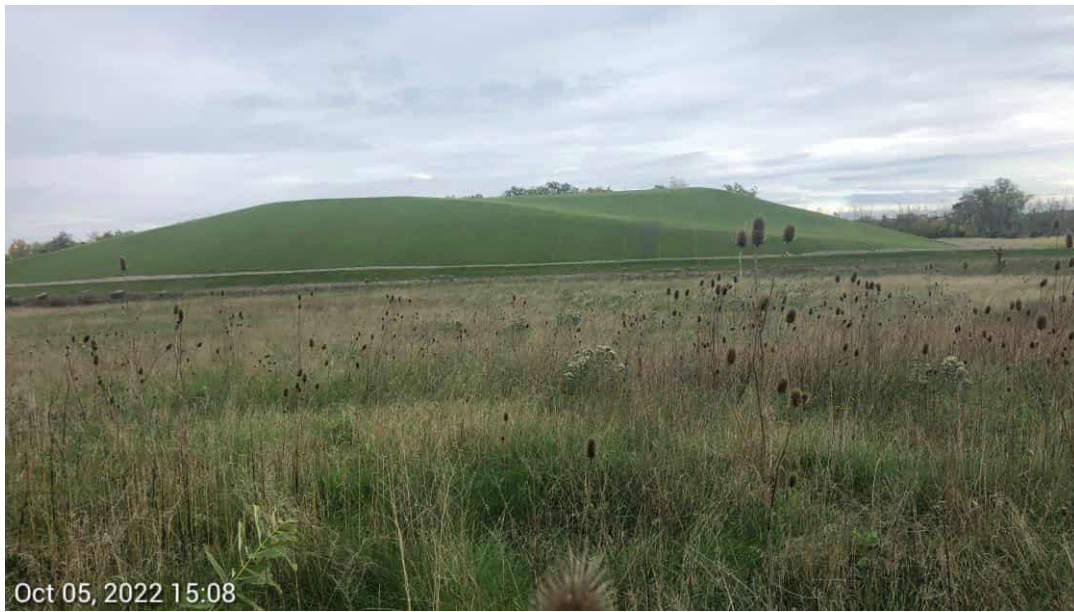
Upland TC- View facing East.