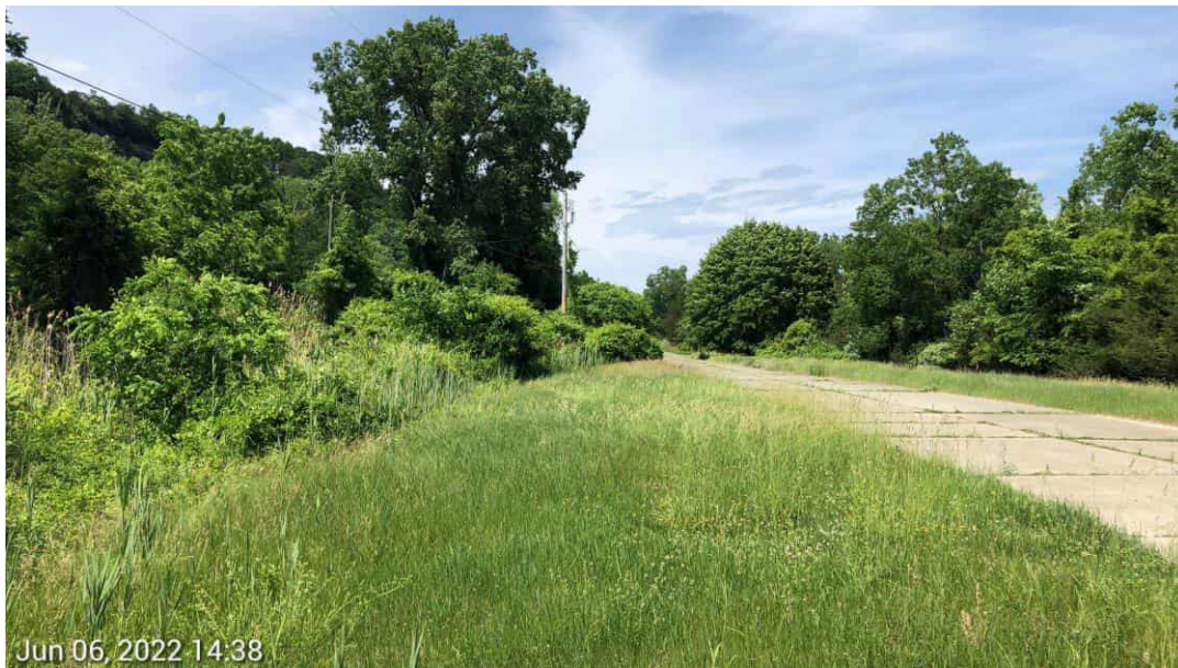
Upland MC- View facing North