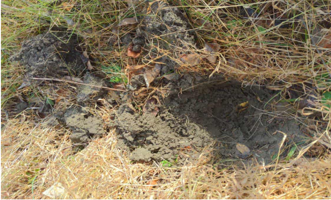
Wetland EC - Soils