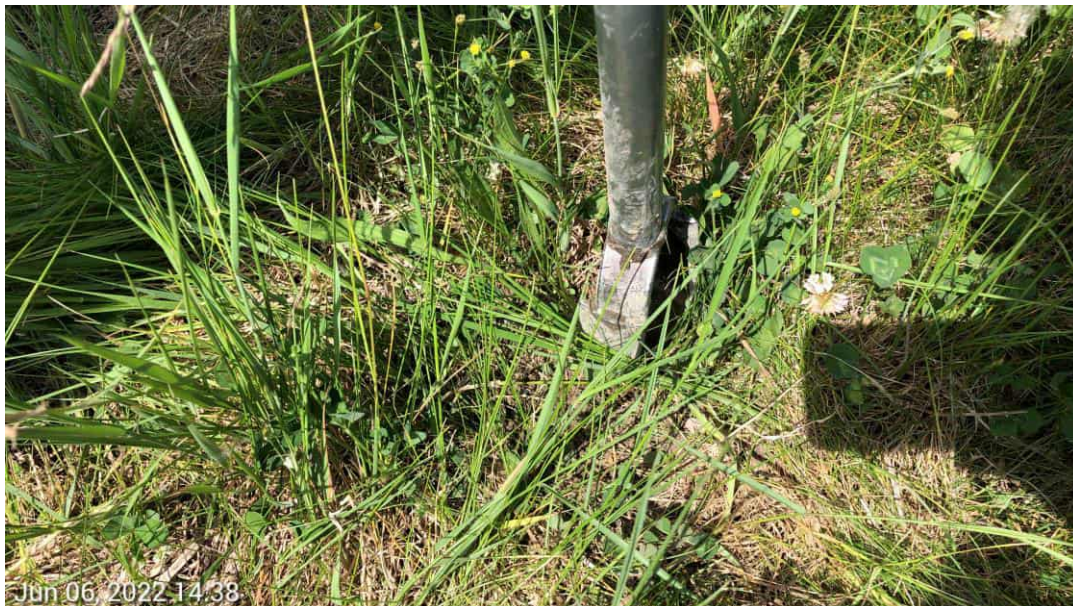
Upland MC Soils