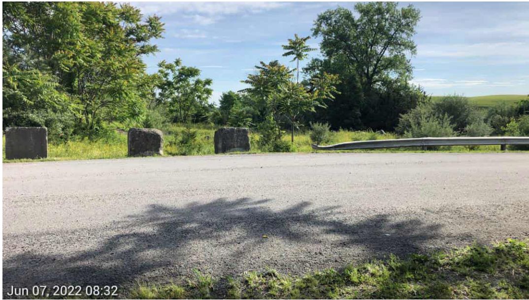
Upland KC- View facing North.