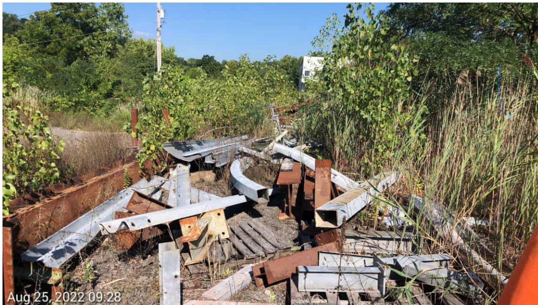
Upland GN- View facing South.