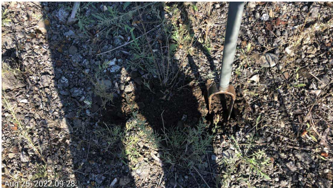
Upland GN Soils