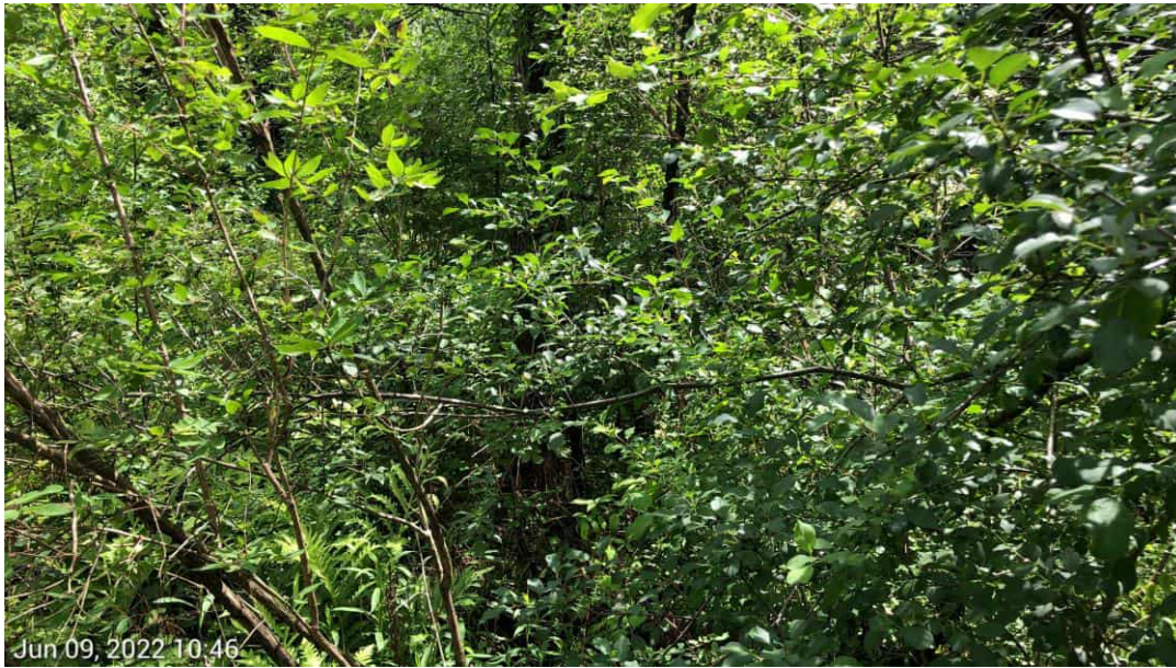
PFO Wetland AC- View facing North.