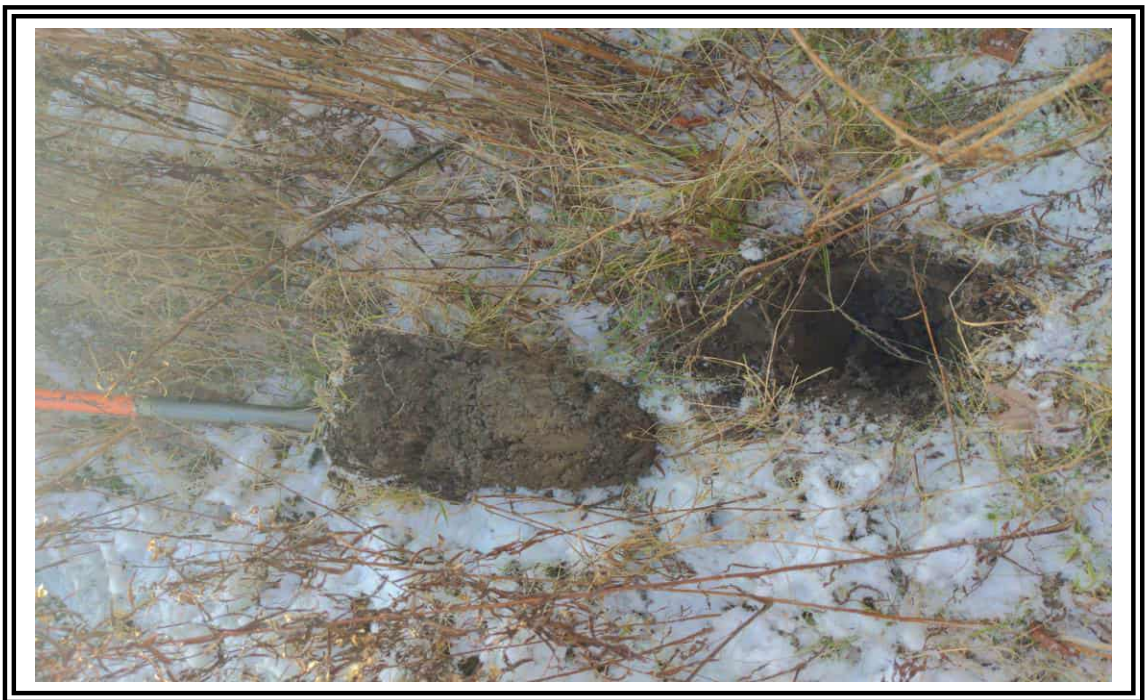
Wetland HC- Soils