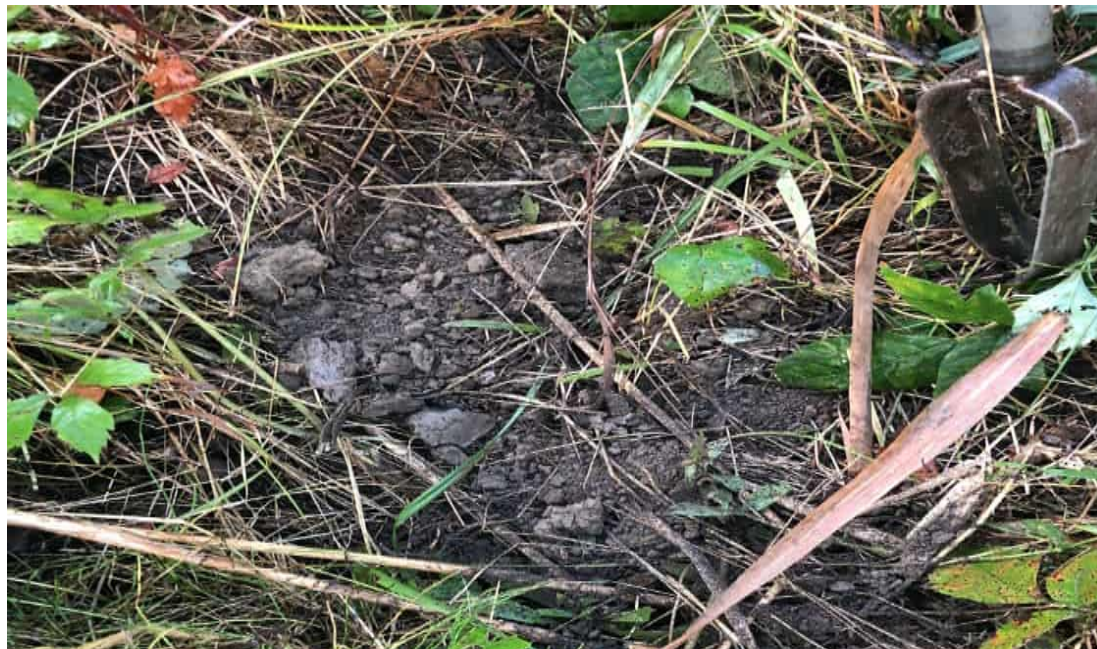
PEM Wetland GG- Soils