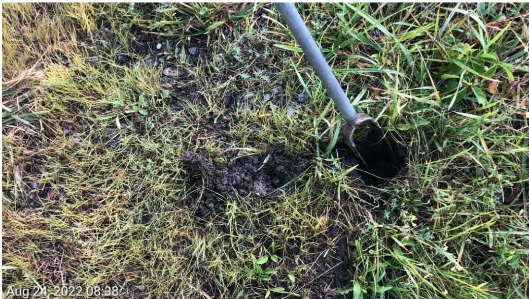
Upland GG- Soils