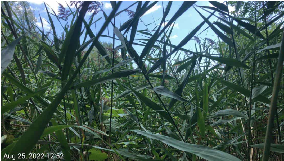
PEM Wetland GO- View facing South.