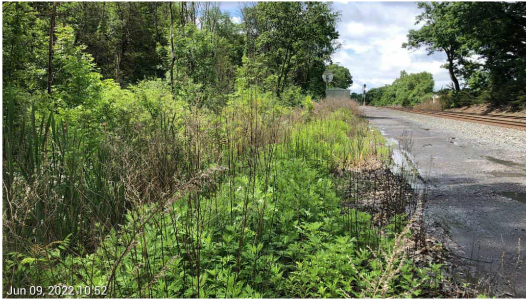
Upland AC- View facing North.