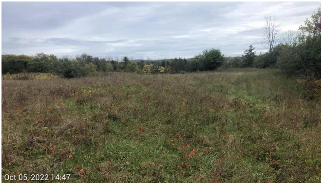
Upland TC- View facing East.