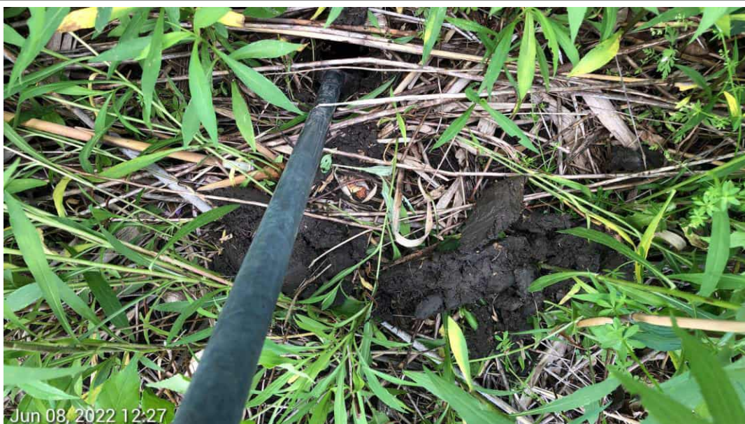
PEM Wetland DC- Soils