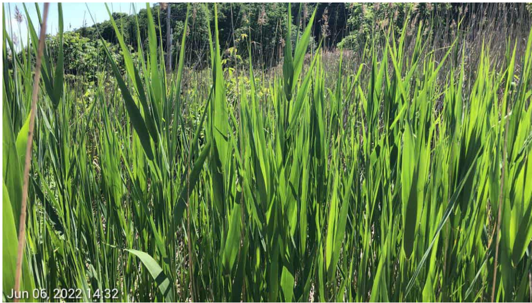
PEM Wetland MC- View facing South.