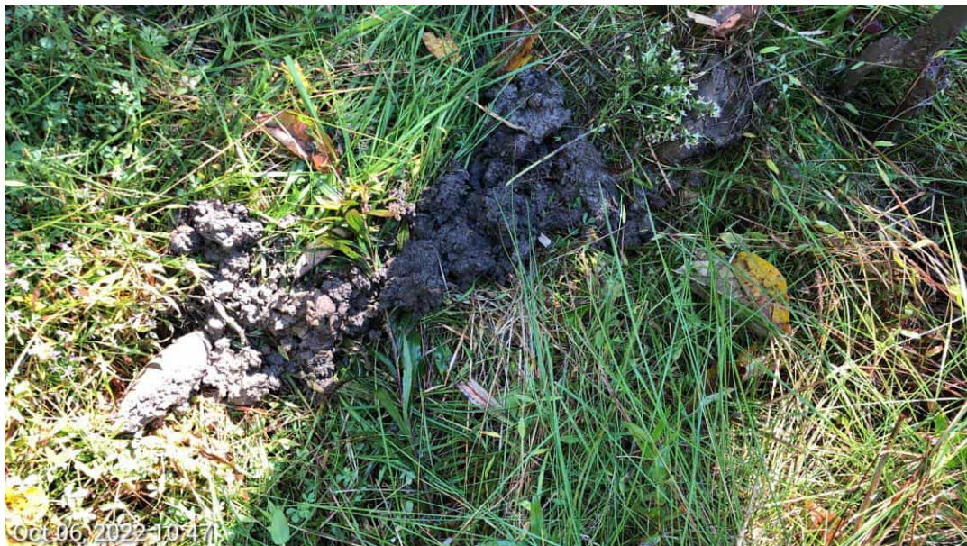
PEM Wetland TD- Soils