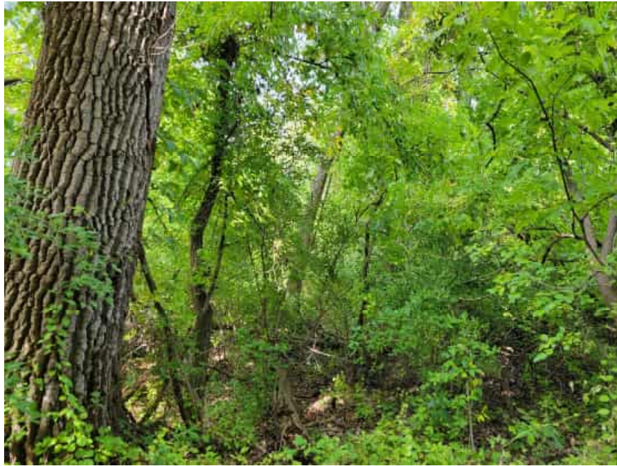
Wetland 7A-Y - View facing north