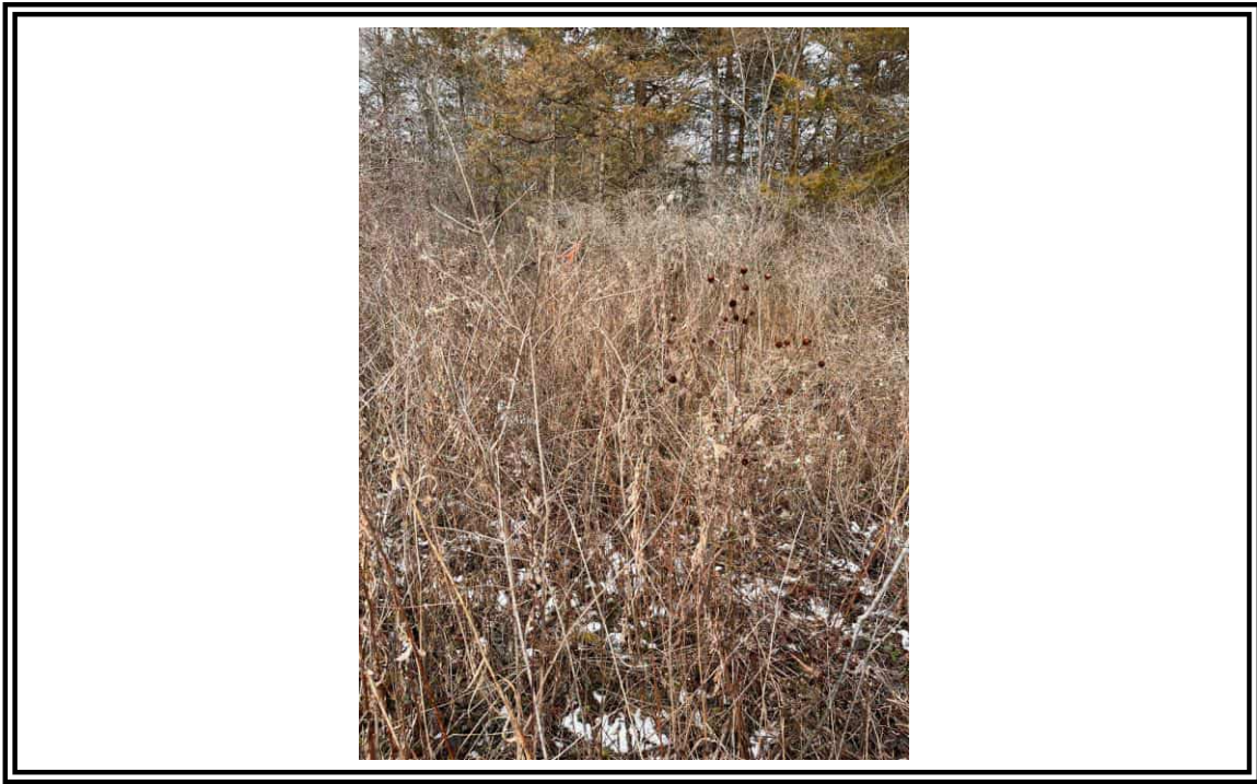
Wetland GP7A - Area 13