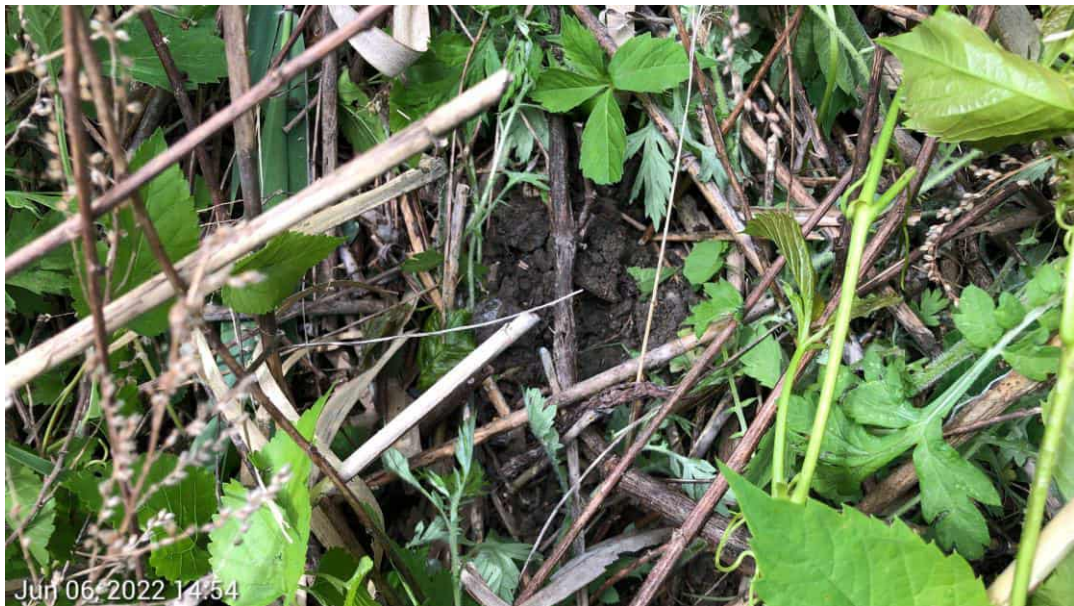
PEM Wetland LC- Soils