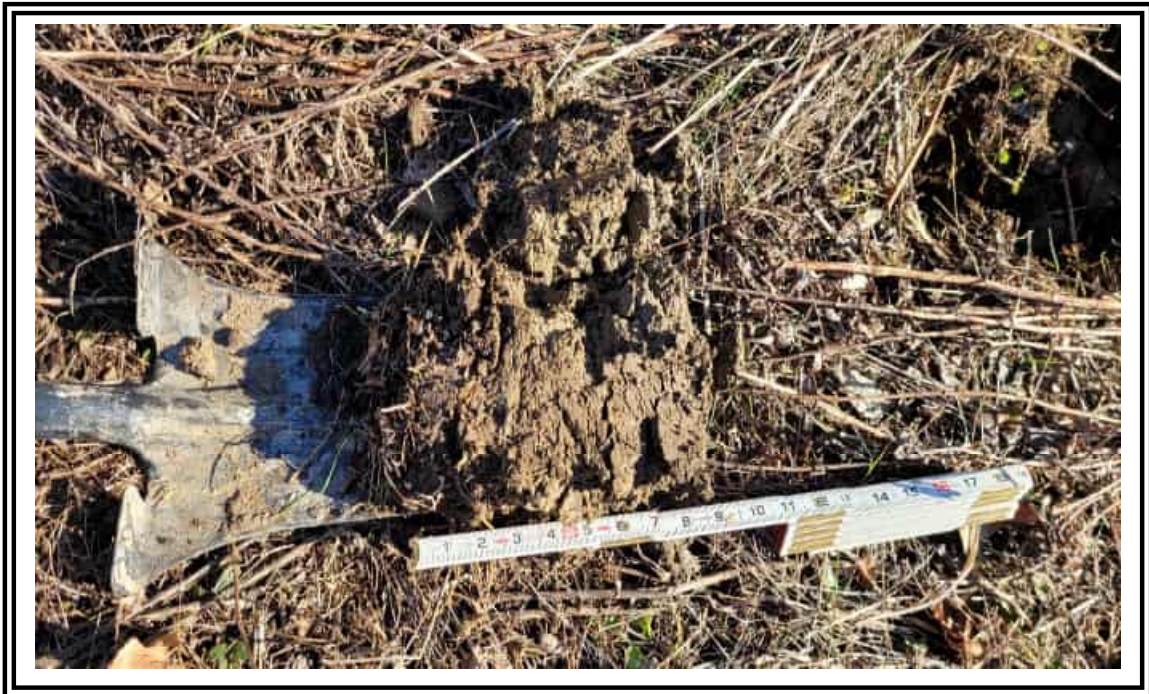
Upland 7A-W (PEM community) - Soils