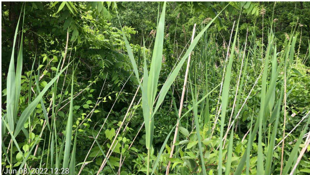
PEM Wetland DC- View facing North.