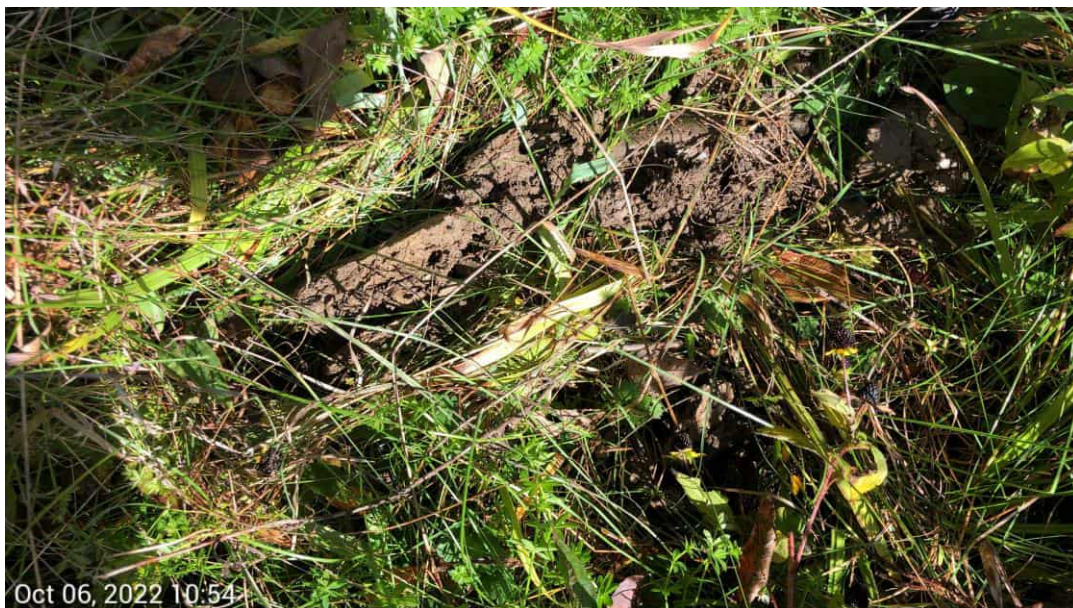
Upland TD Soils