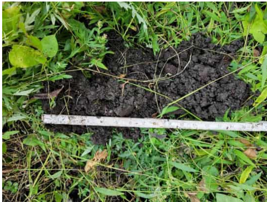
Wetland 7A-Y - Soils