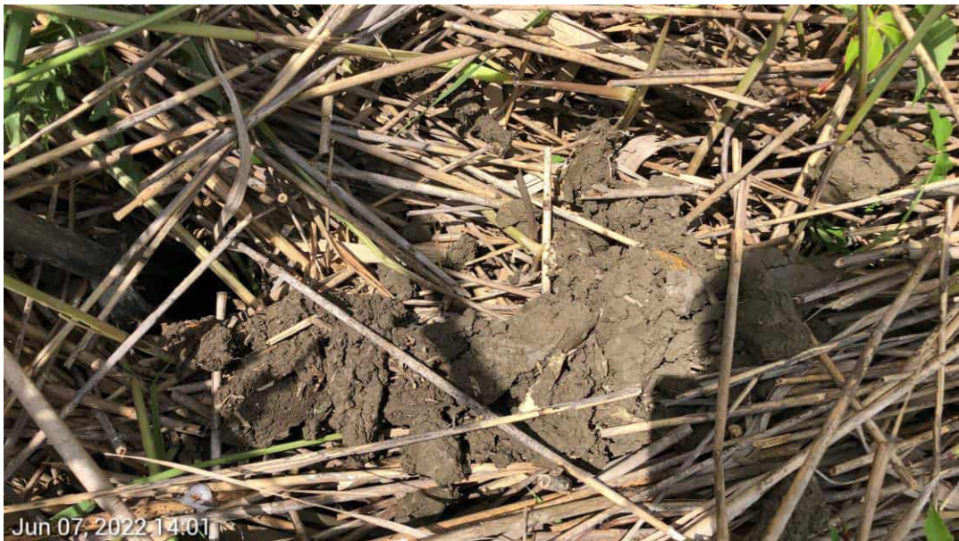
PSS Wetland GC- Soils