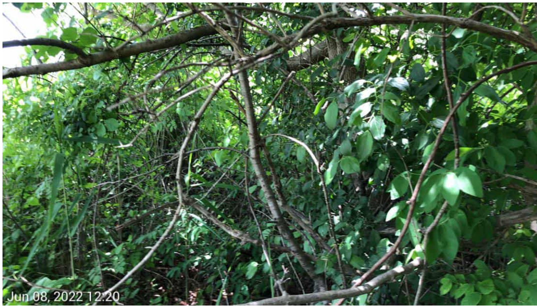
PFO Wetland DC- View facing North.