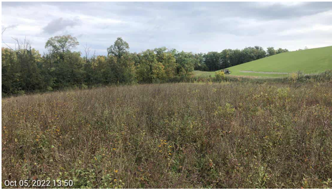
Upland TB- View facing North.