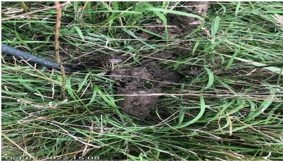
Upland TC Soils