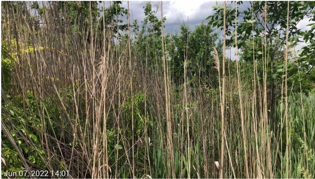
PSS Wetland GC- View facing North.