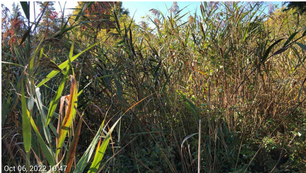
PEM Wetland TD- View facing North.