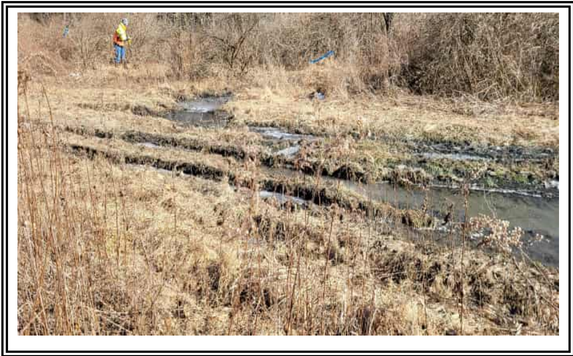
Wetland 7A-W (PEM community) - View facing east.