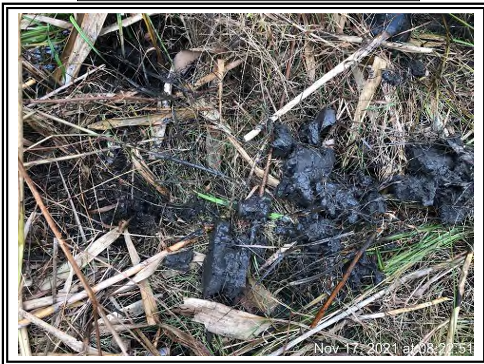
Wetland FA-AP, AO, AN - Soils.