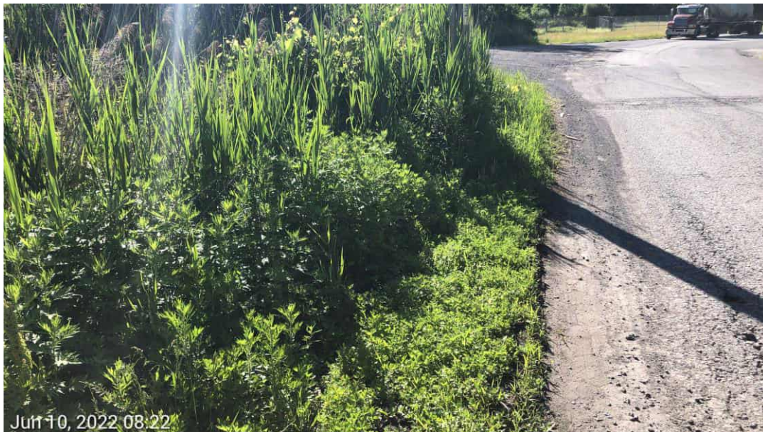
Upland P1- View facing North