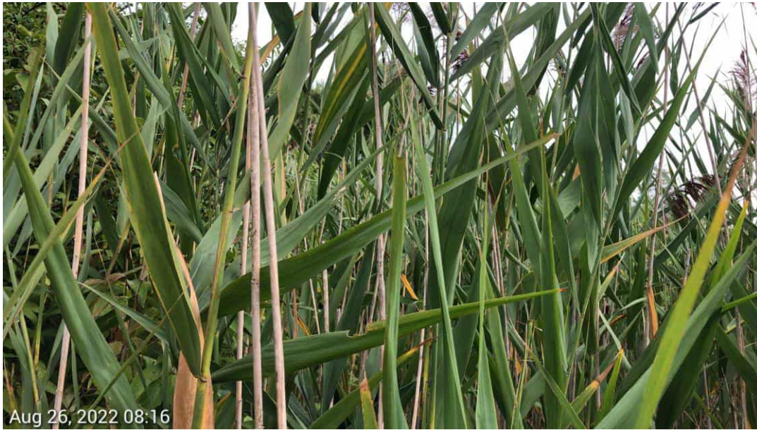
PEM Wetland GR- View facing North.