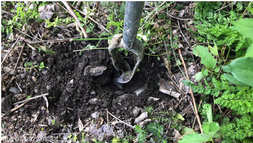
Upland KC Soils