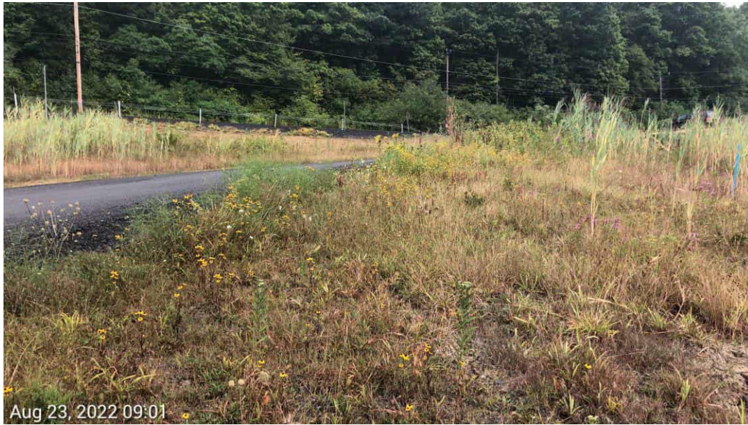
Upland GD- View facing South.