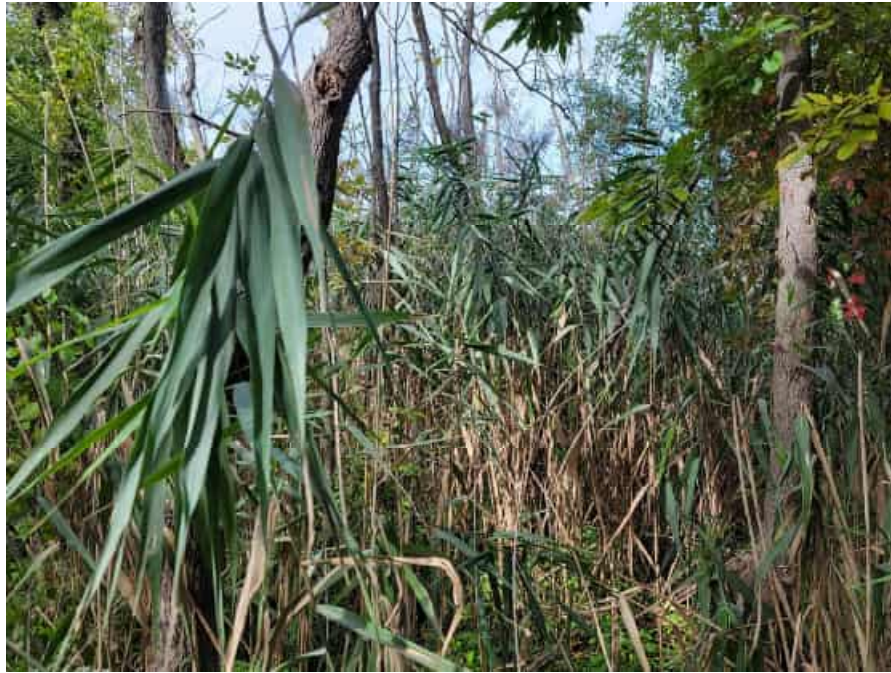
Wetland 7A-Y - View facing north