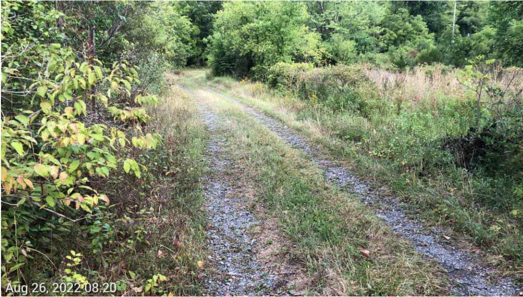
Upland GR- View facing South.