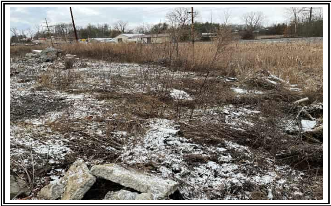
Upland FA-AO, AP, AN (21B Upl) - View facing south.