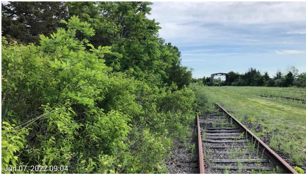
Upland JC- View facing North.