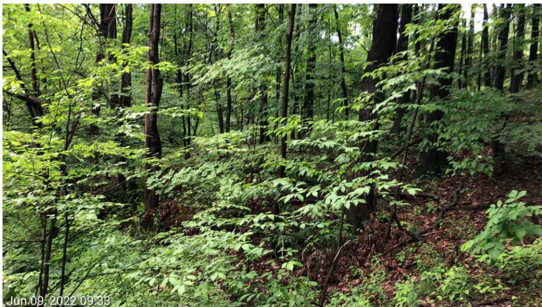
Upland M1- View facing North.