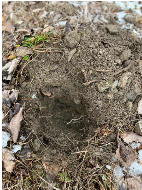
Upland GP7A -Area 14 - Soils