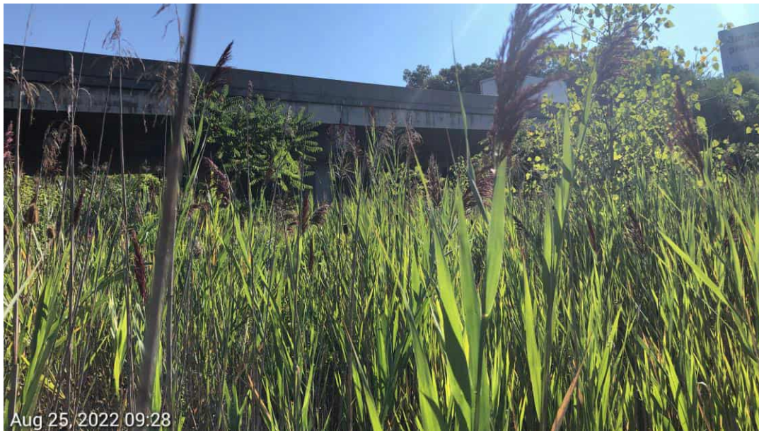
PEM Wetland GN- View facing South.