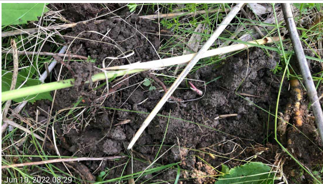
PEM Wetland E- Soils