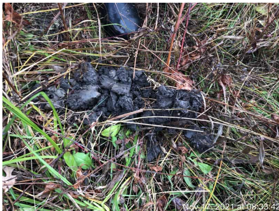
Upland FA-AP, AO, AN - Soils.