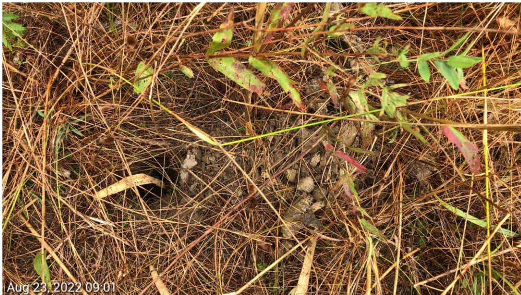
PEM Wetland GD- Soils