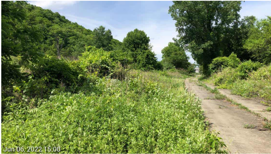
Upland LC- View facing North.