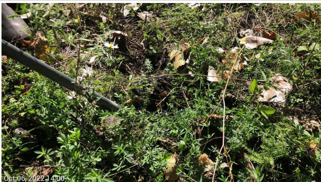
Upland TE Soils