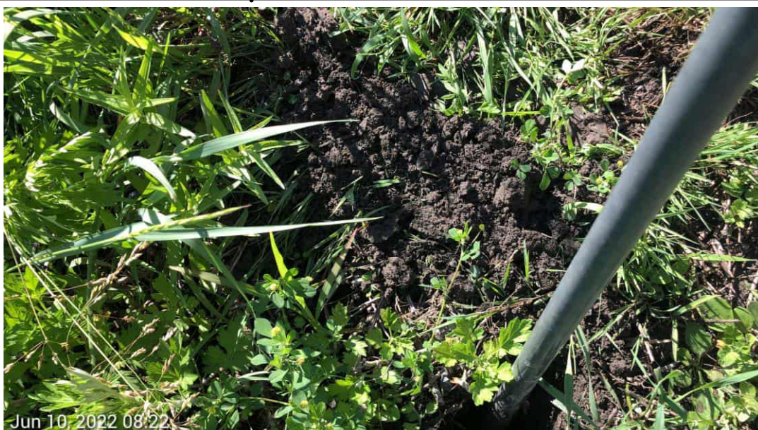
Upland P-1 Soils