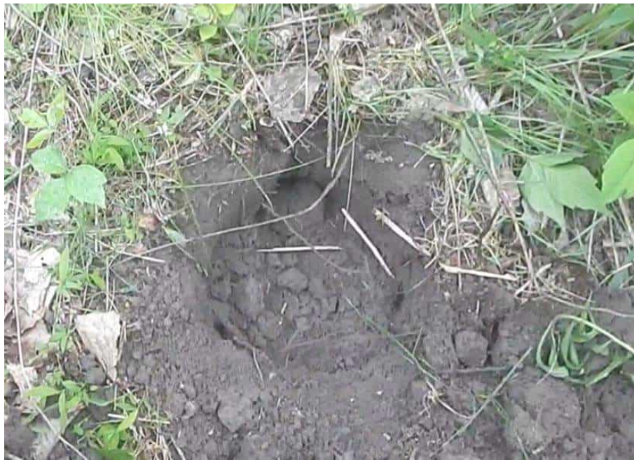
Upland GP7A-C- Soils