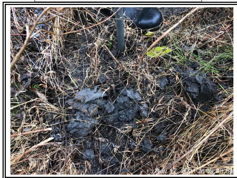
Wetland FA-AP, AO, AN - Soils