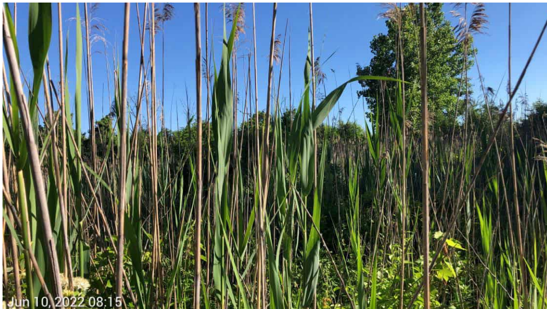
PEM Wetland P1- View facing North.