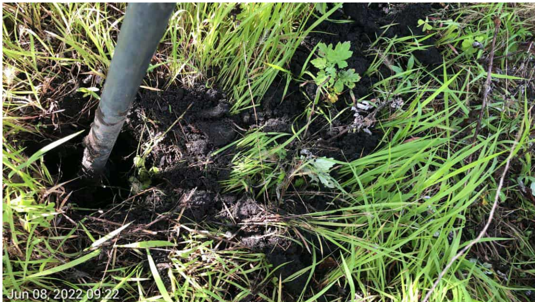
Upland FC Soils