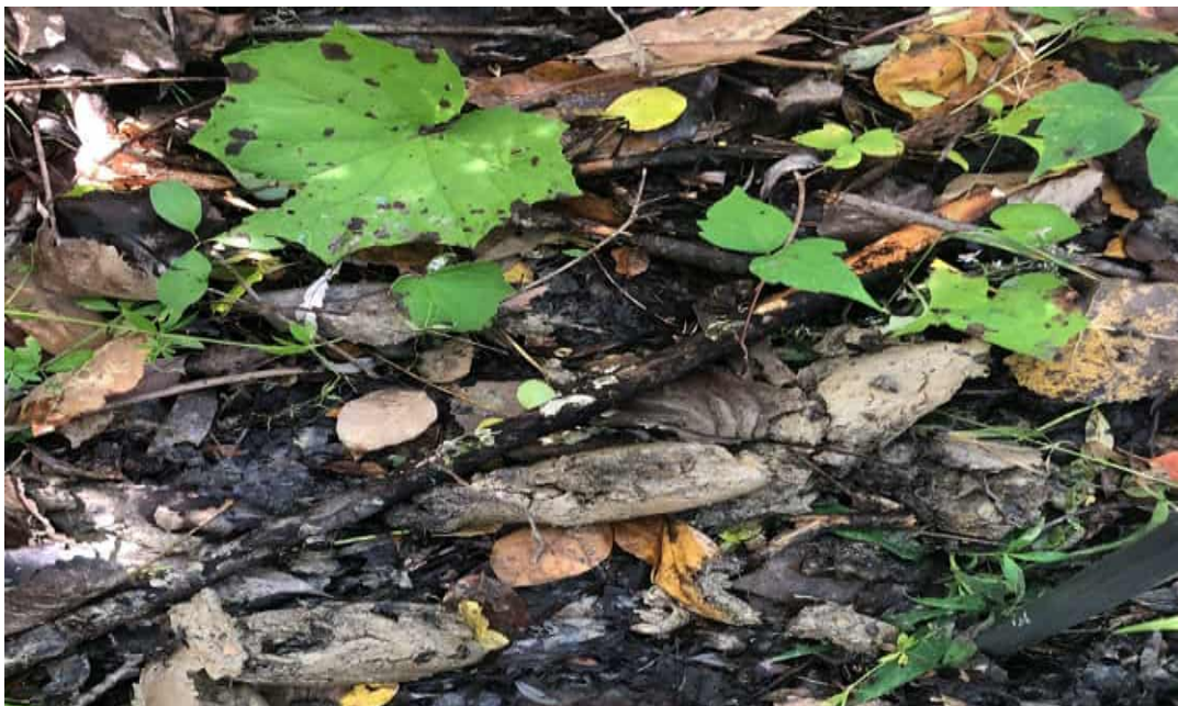
PEM Wetland TE- Soils