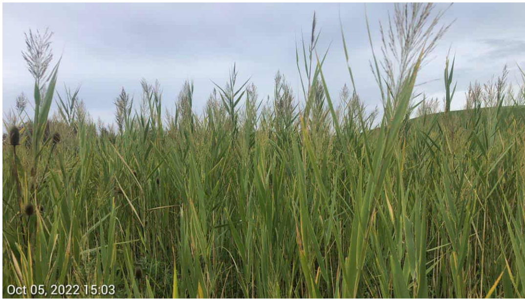
PEM Wetland TC- View facing North.