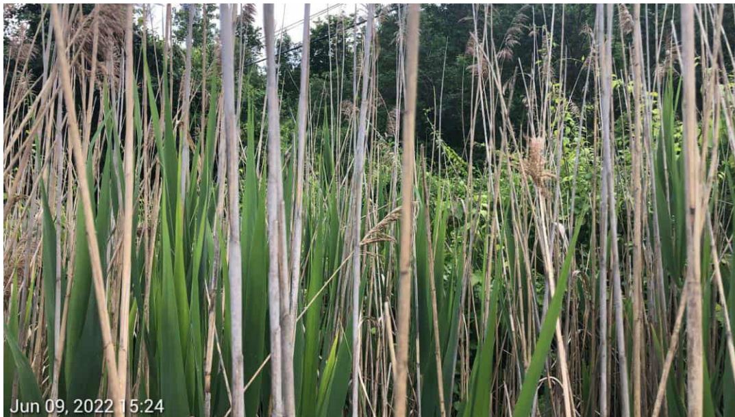
PEM Wetland O1- View facing North.