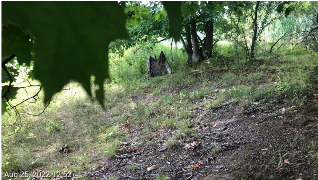
Upland GO- View facing South.