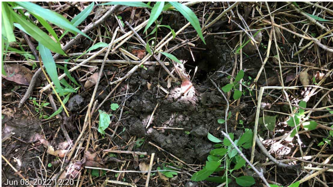
PFO Wetland DC- Soils