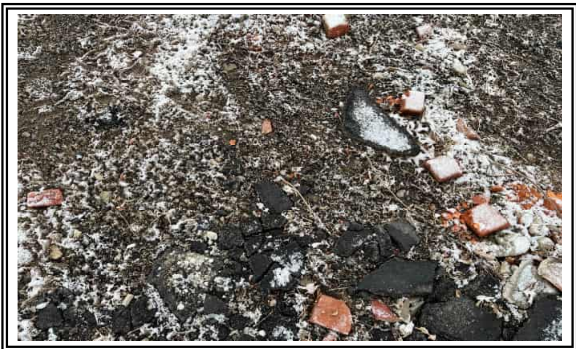
Upland FA-AO, AP, AN (21B Upl) - Soils