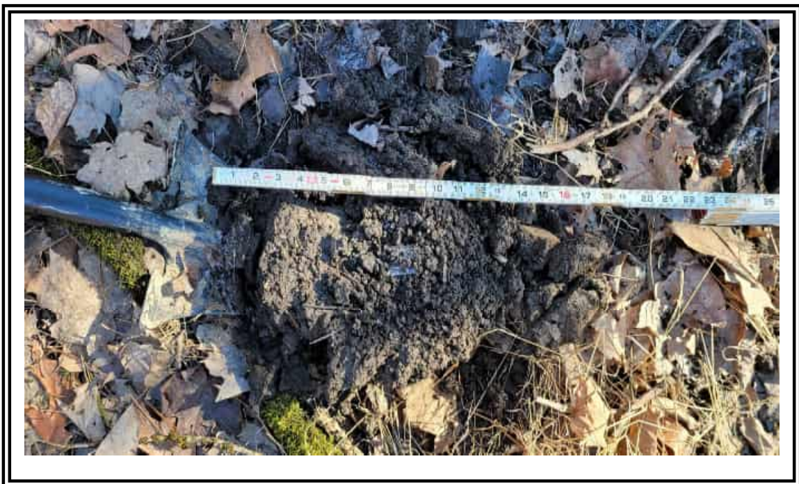
Wetland 7A-W (PFO community) - Soils