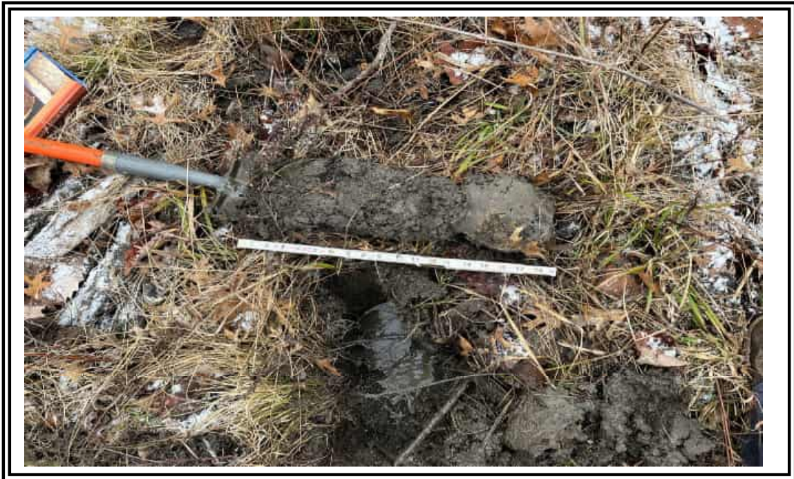
Wetland FA-AO, AP, AN (21B) - Soils