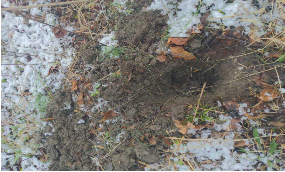
Upland HC- Soils