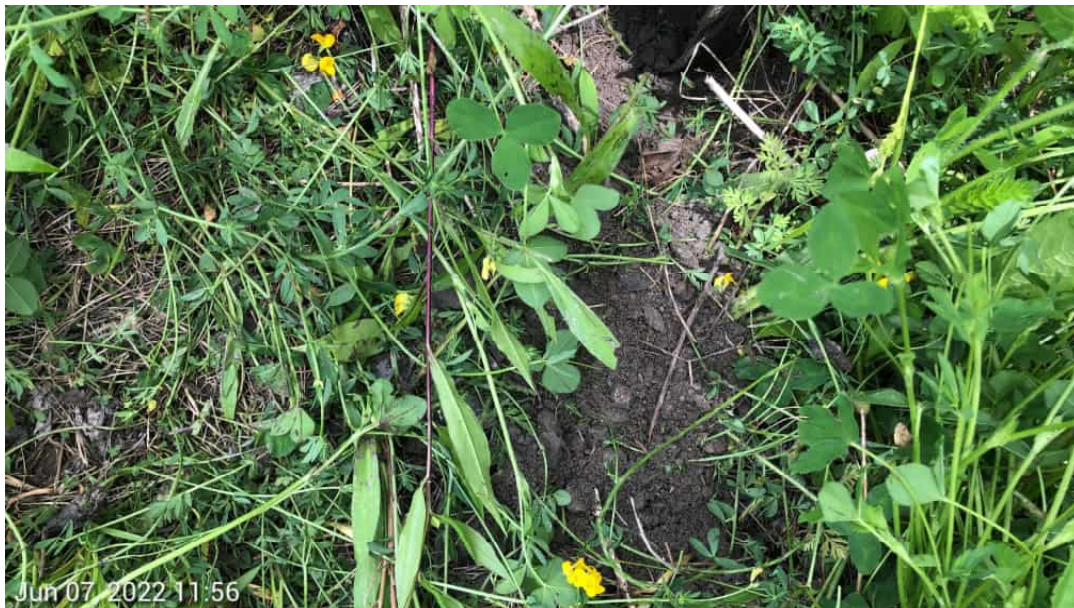
Upland IC Soils