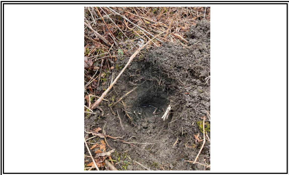
Wetland GP7A - Area 13 - Soils