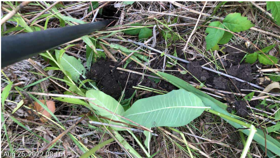
PEM Wetland GR- Soils