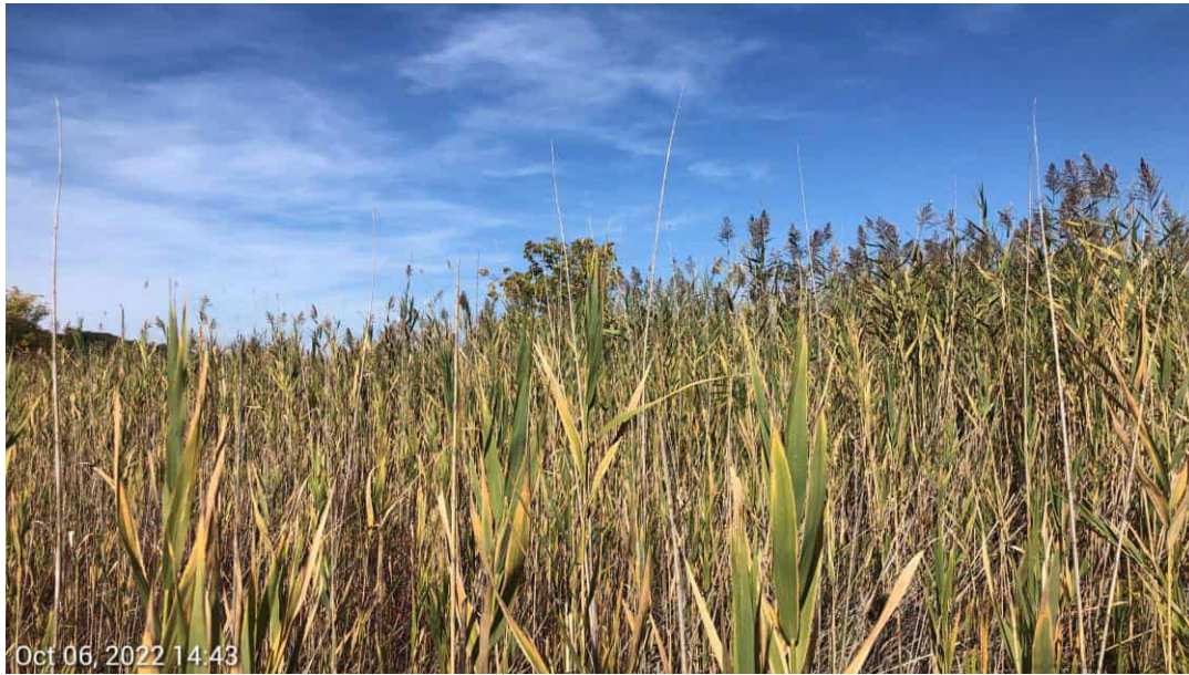
PEM Wetland TF- View facing South.