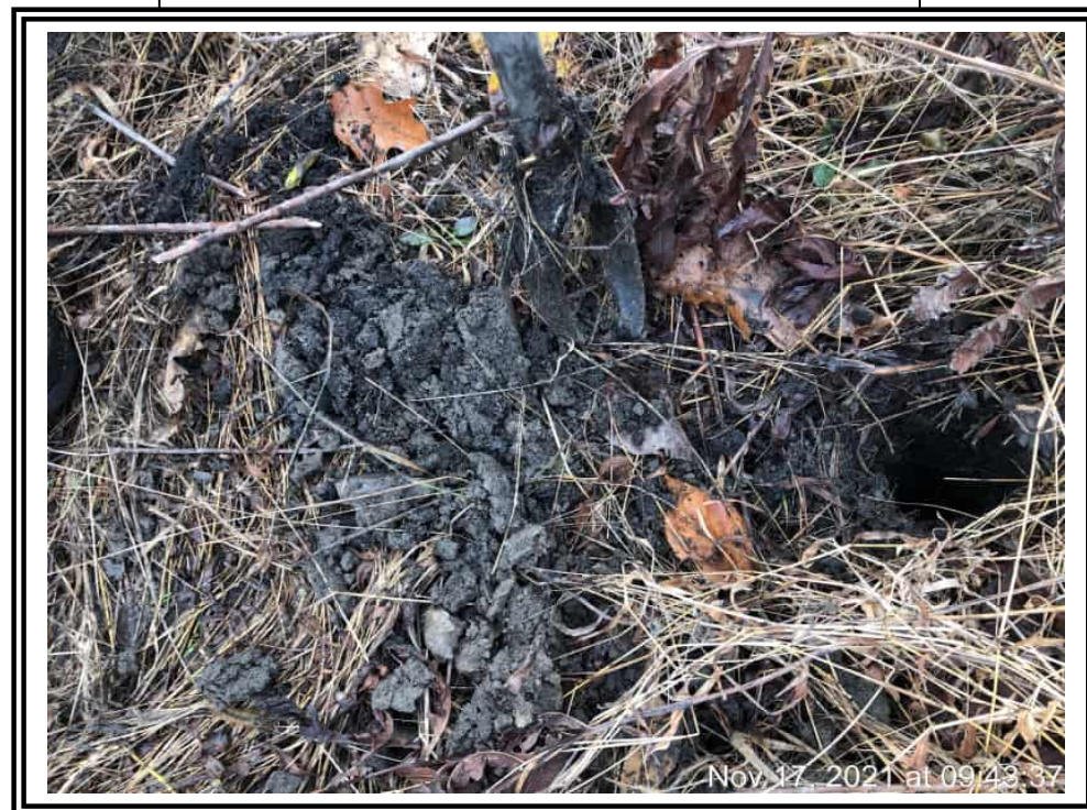
Upland FA-AP, AO, AN - Soils.