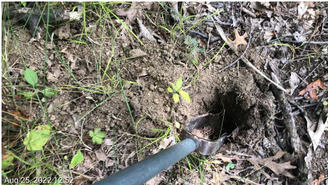
Upland GO Soils