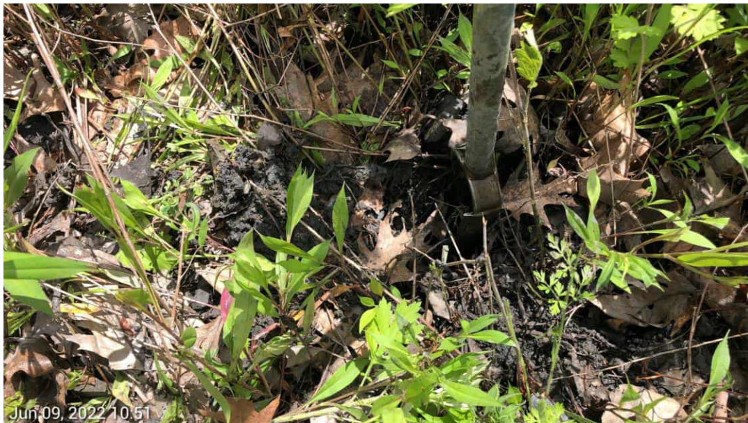
Upland AC Soils