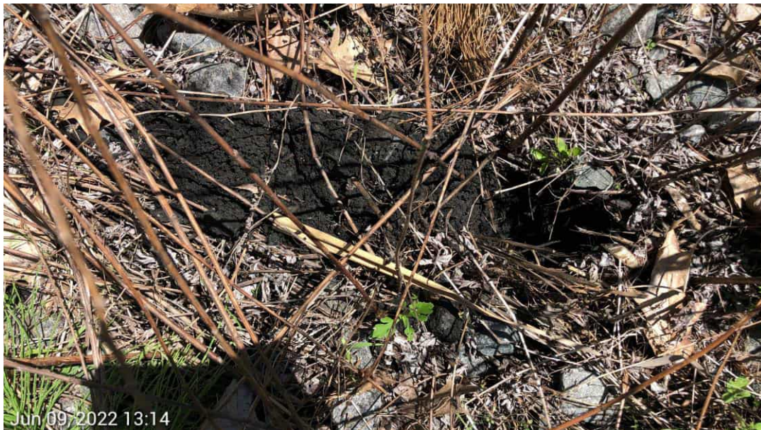
Upland BC Soils