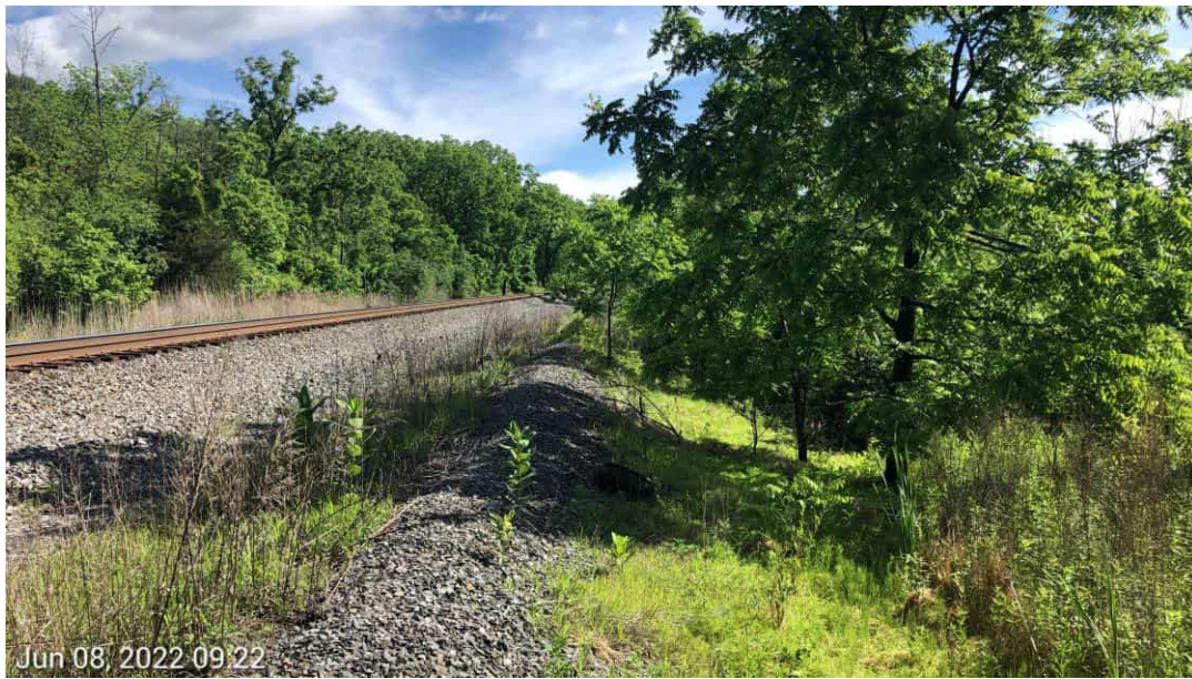
Upland FC- View facing North.