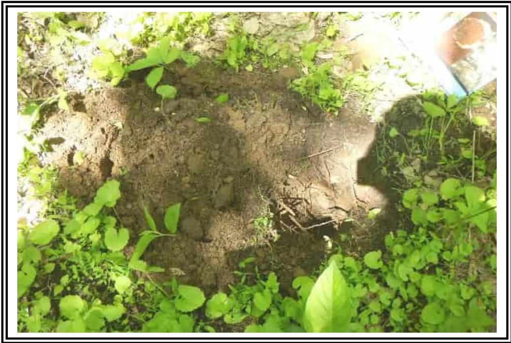
Wetland G-P7A-A - Soils