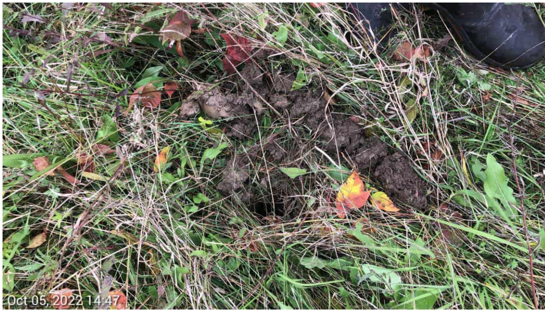
Upland TC Soils