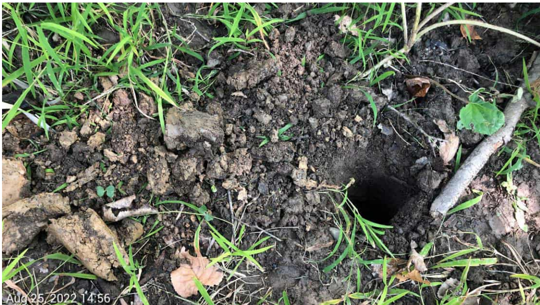
PFO Wetland GQ- Soils