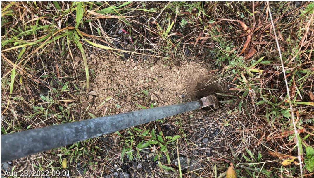
Upland GD- Soils