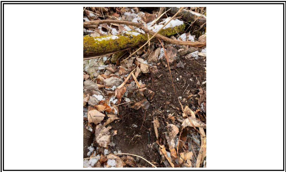
Wetland GP7A - Area 14 - Soils