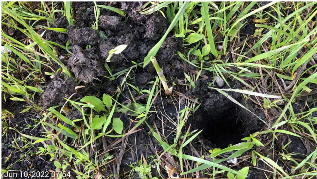
Upland O1 Soils