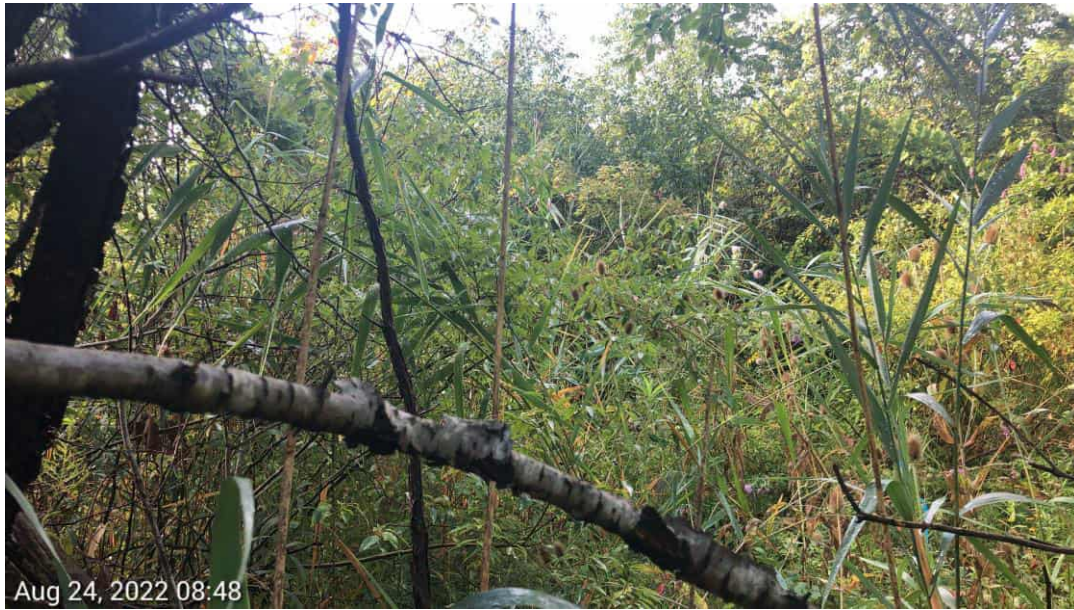
PSS Wetland GG- View facing South.