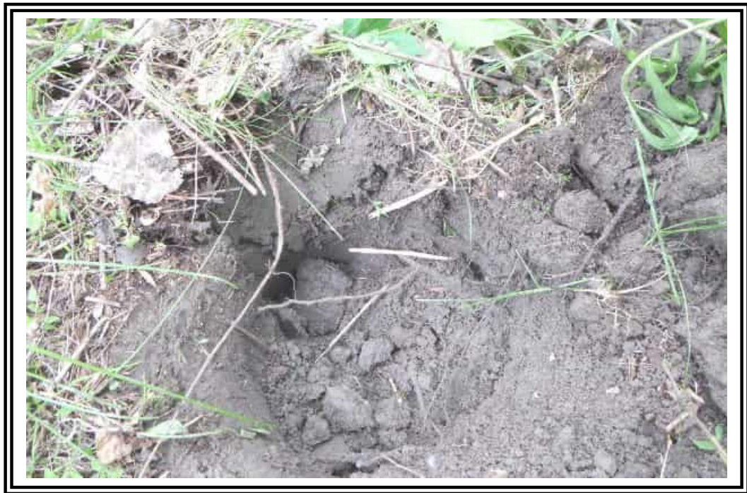
Upland GP7A-B- Soils