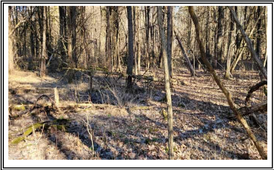
Wetland 7A-W (PFO community) - View facing east.