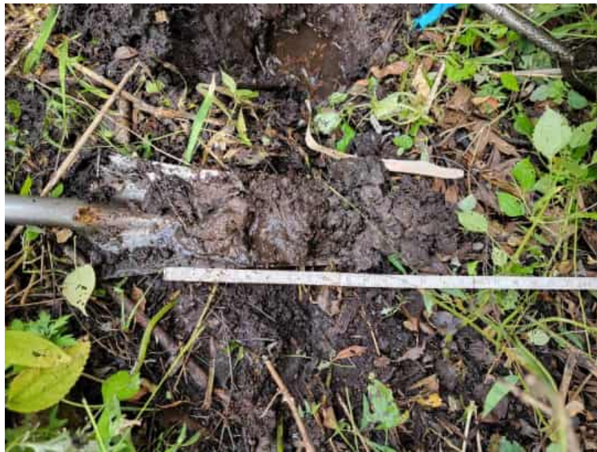
Wetland 7A-Y - Soils