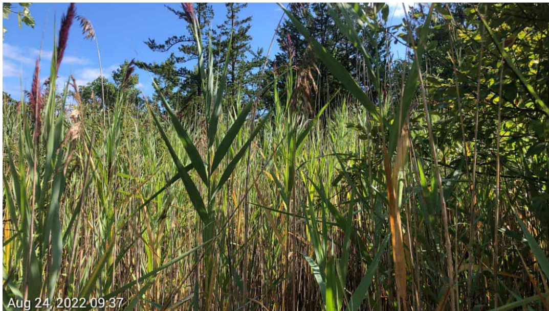
PEM Wetland GJ- View facing South.