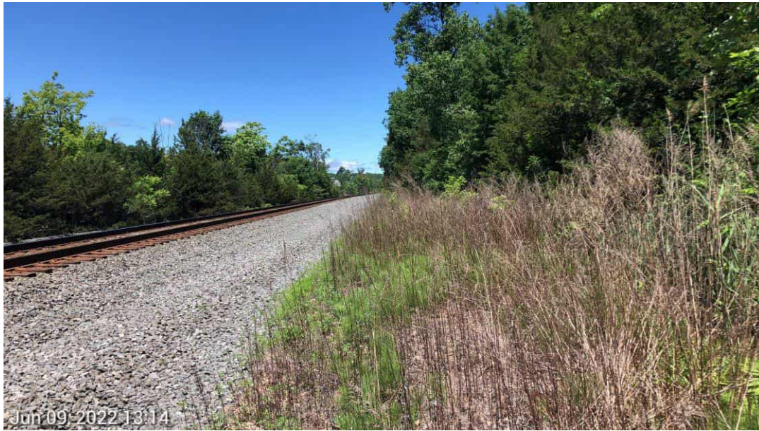
Upland BC- View facing North.