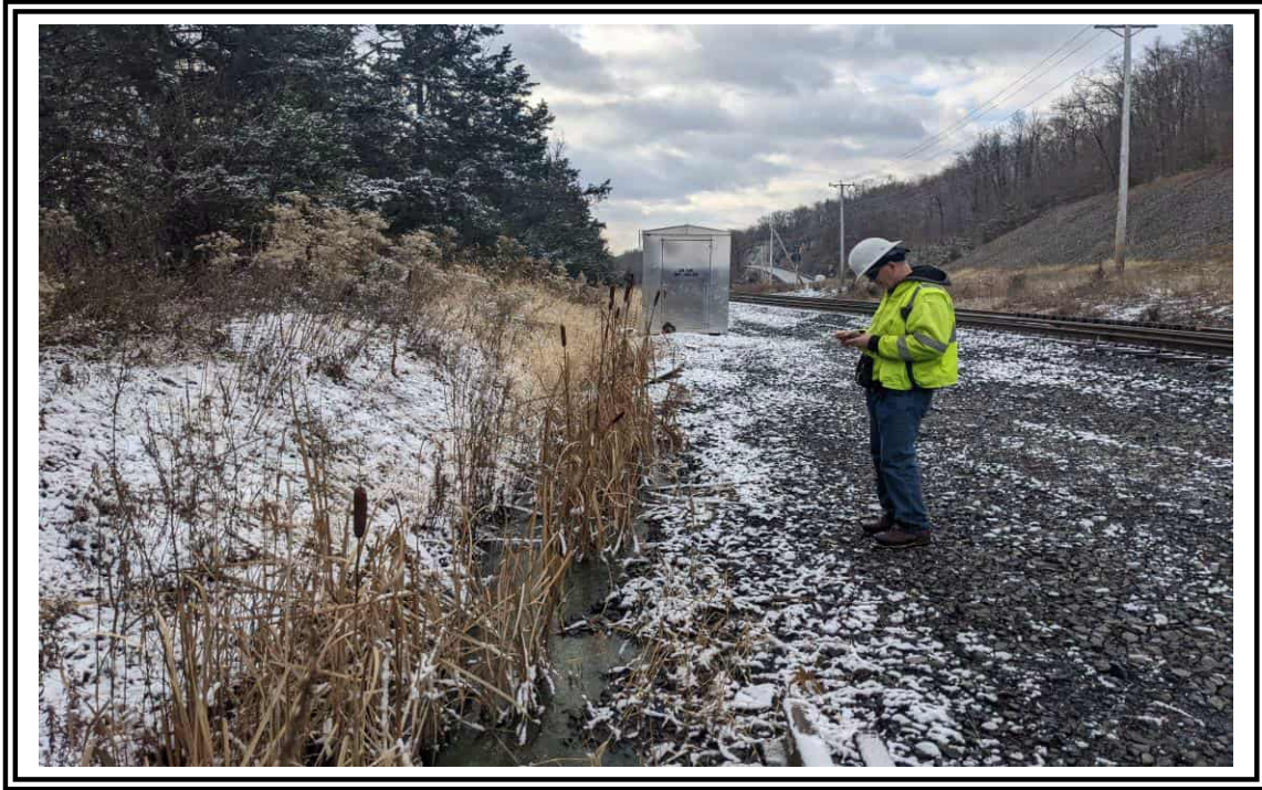
Wetland KC- View facing South