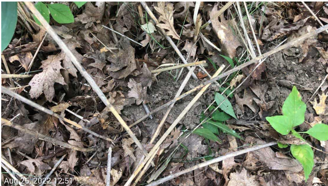
PEM Wetland GO- Soils