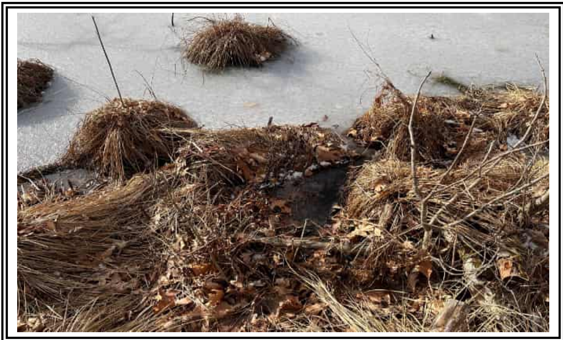
Wetland FA-AP, AO, AN (7A-X-10) - Soils