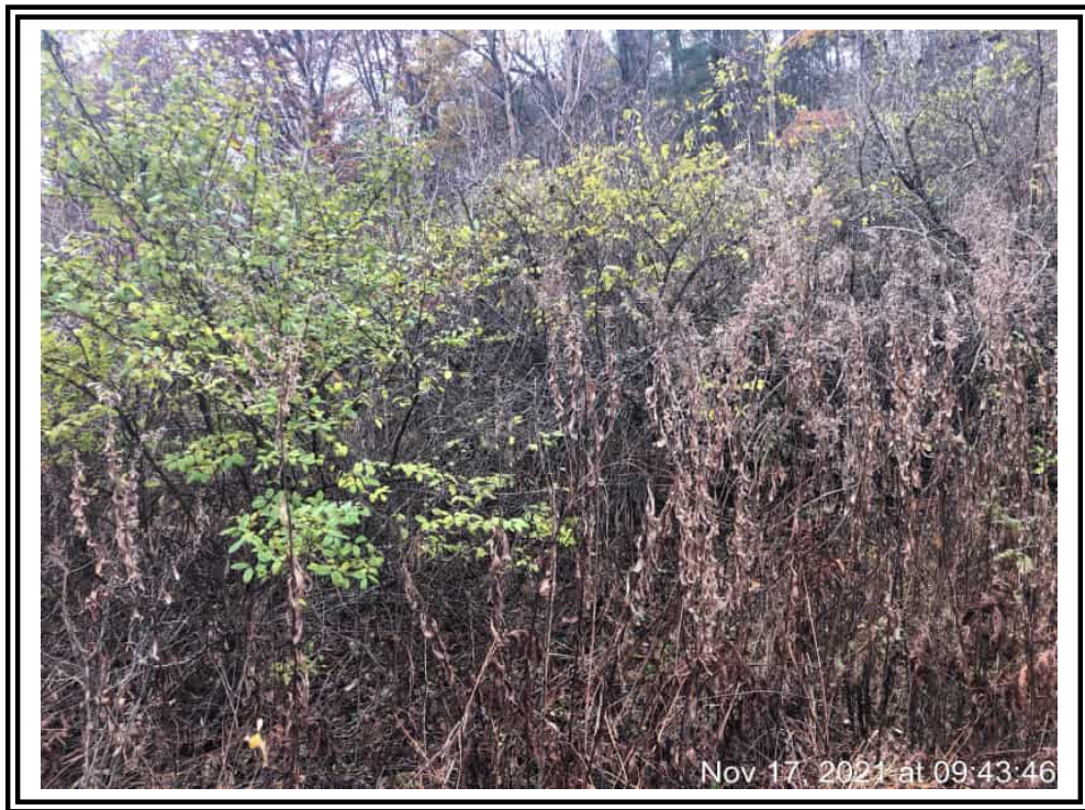
Upland FA-AP, AO, AN - View facing North.