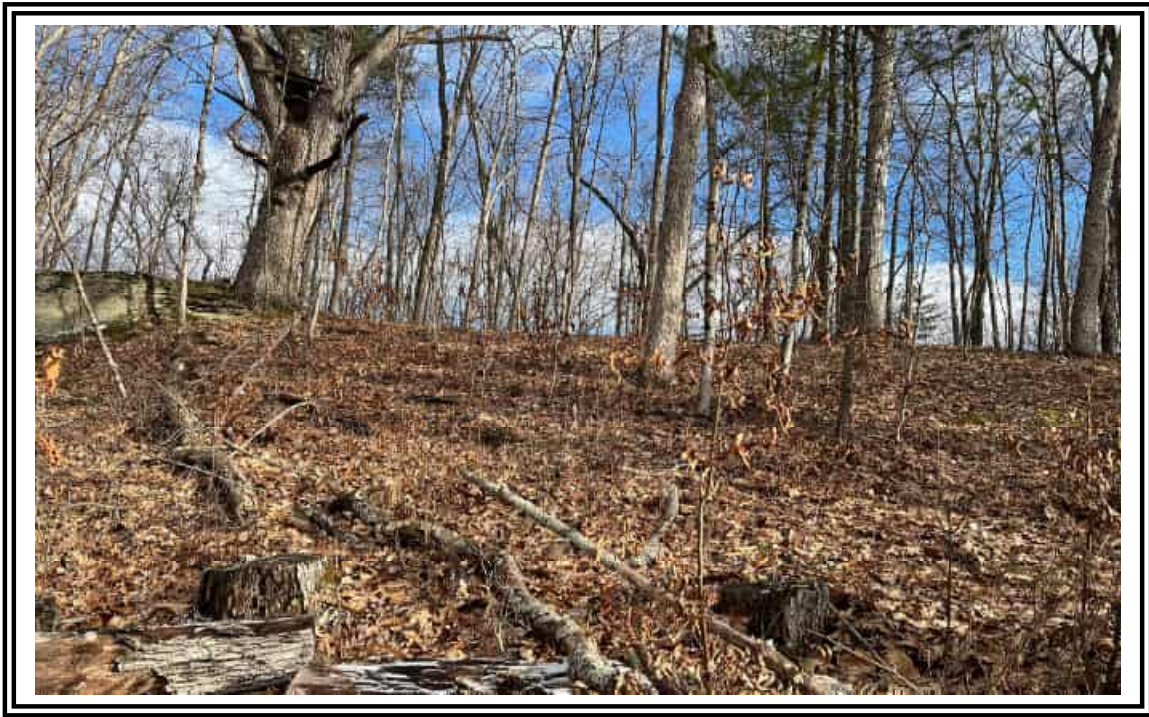
Upland FA-AO, AP, AN (7A-X-10) - View facing east.