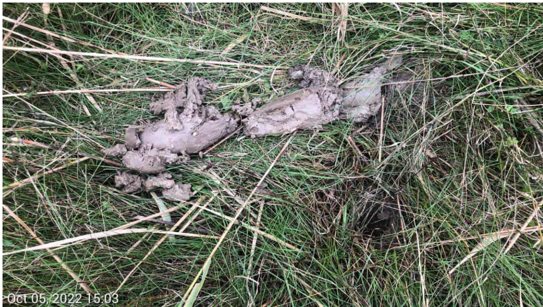
PEM Wetland TC- Soils