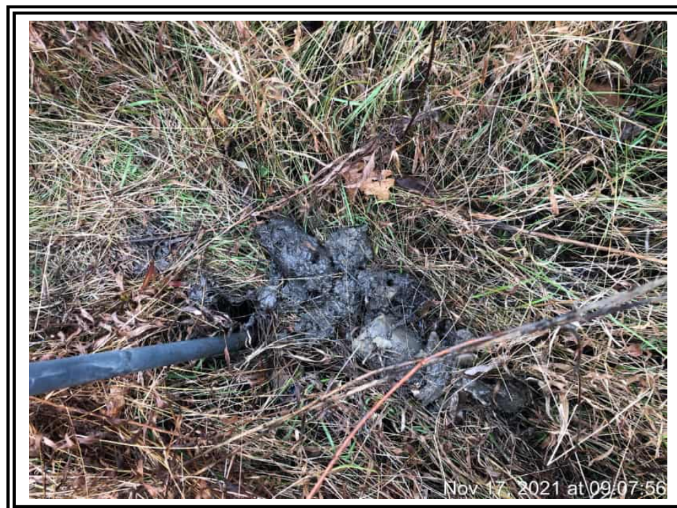
Wetland FA-AP, AO, AN - Soils.