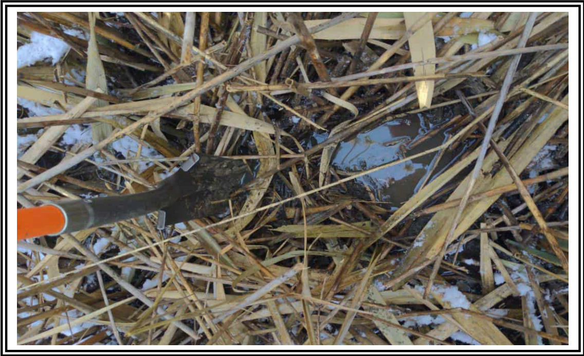
Wetland JC- Soils