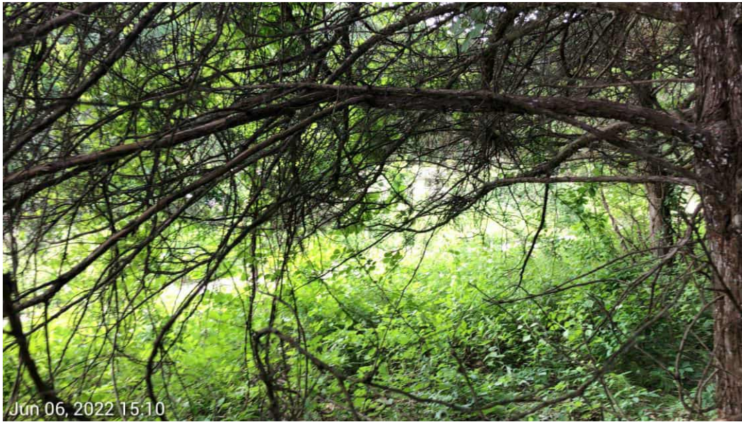
PFO Wetland LC- View facing North.