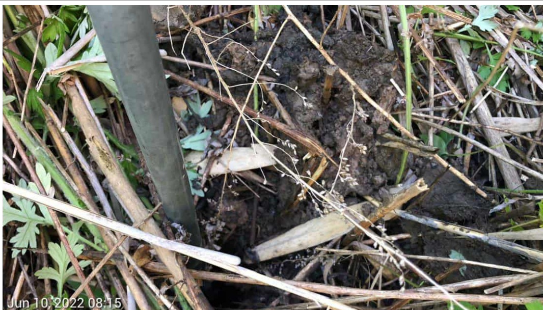
PEM Wetland P-1- Soils