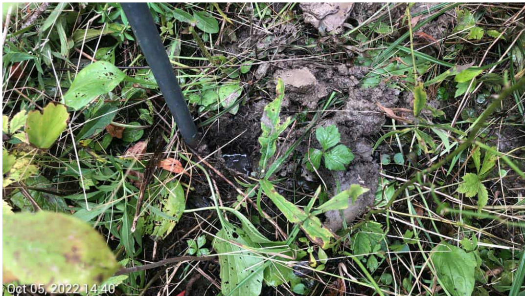
PFO Wetland TC- Soils