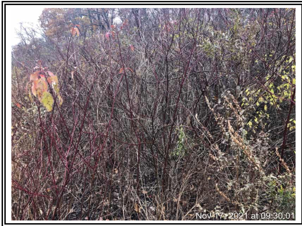
Wetland FA-AP, AO, AN - View facing north.