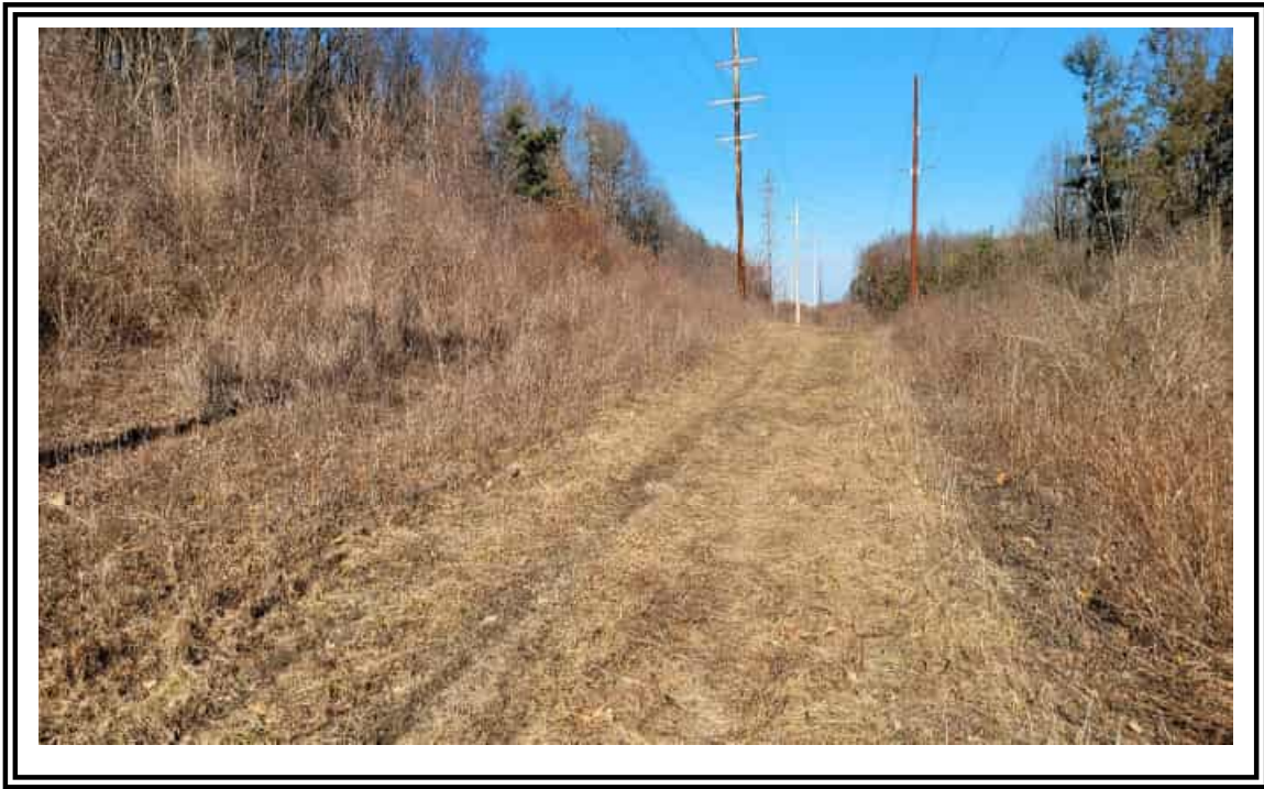
Upland 7A-W (PEM community) - View facing