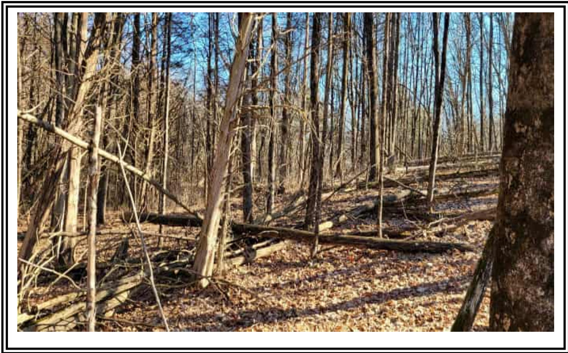
Upland 7A-W (PFO community) - View facing south.