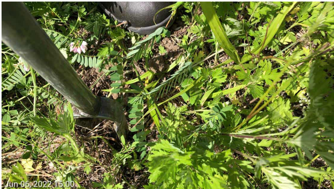
Upland LC Soils