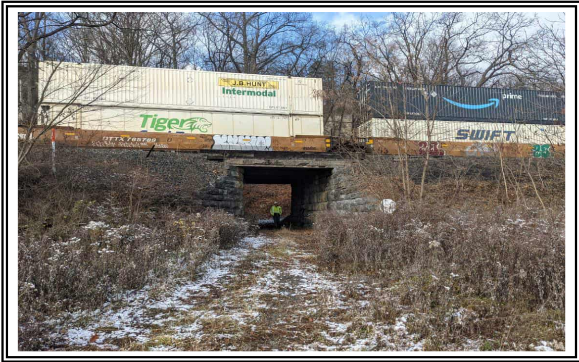
Wetland HC- View facing West