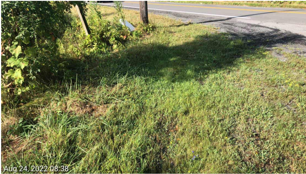
Upland GG- View facing North.