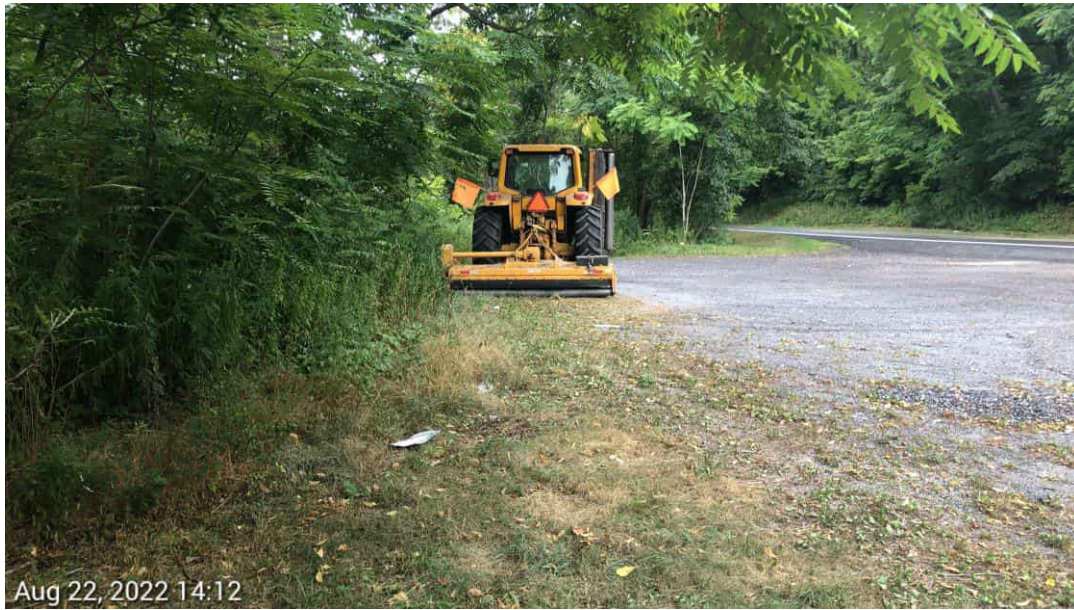
Upland GC- View facing South.