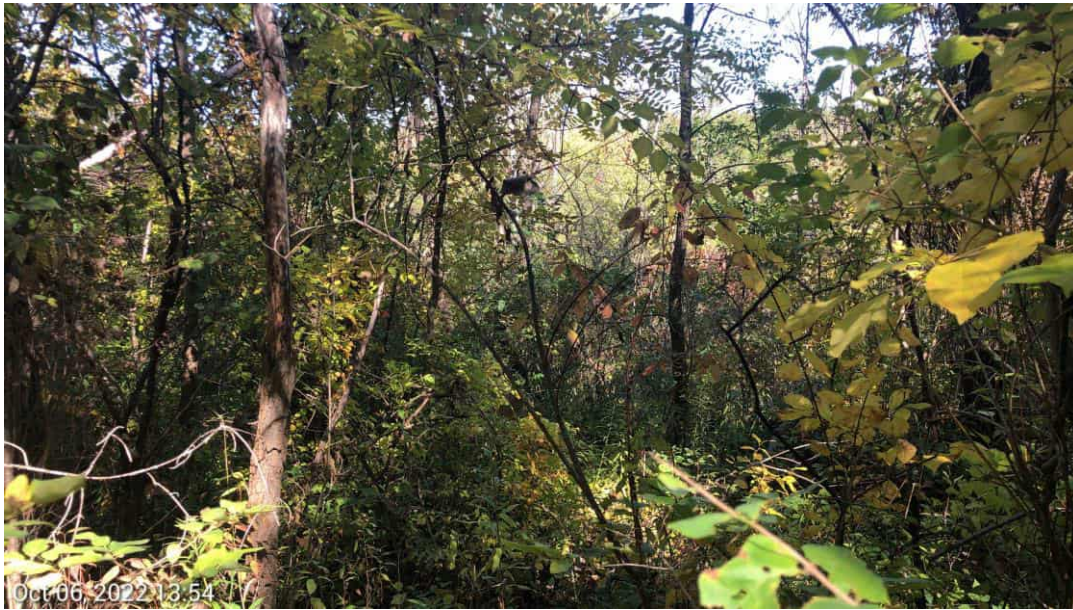
PEM Wetland TE- View facing North.