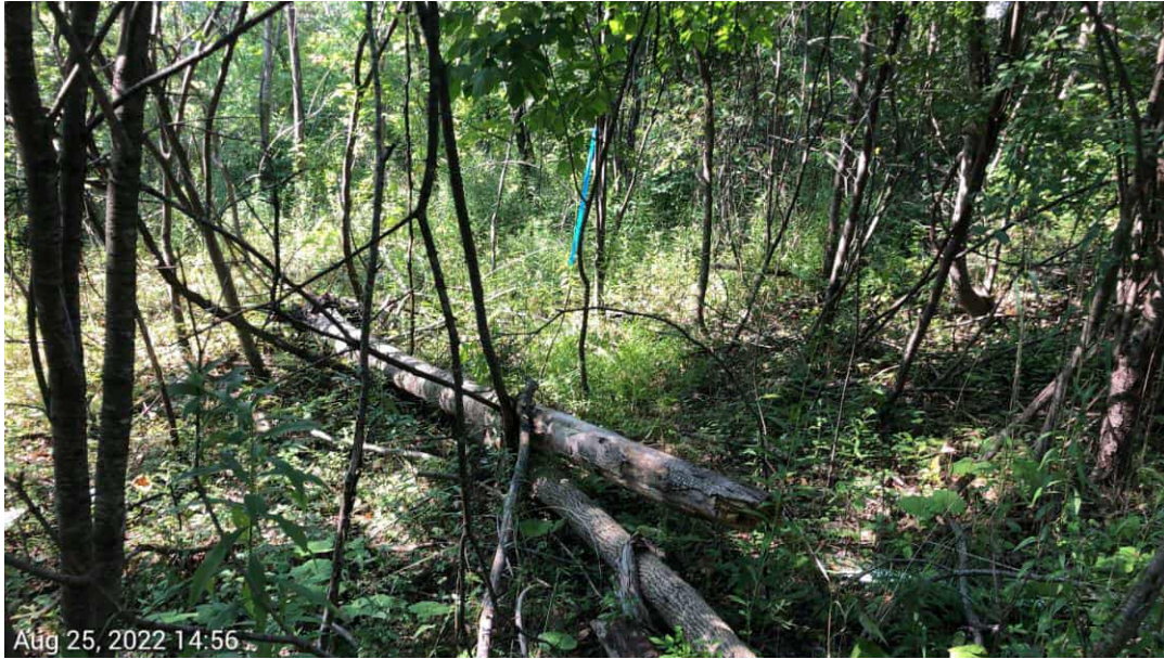
PFO Wetland GQ- View facing South.