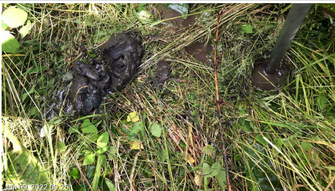
PEM Wetland M1- Soils