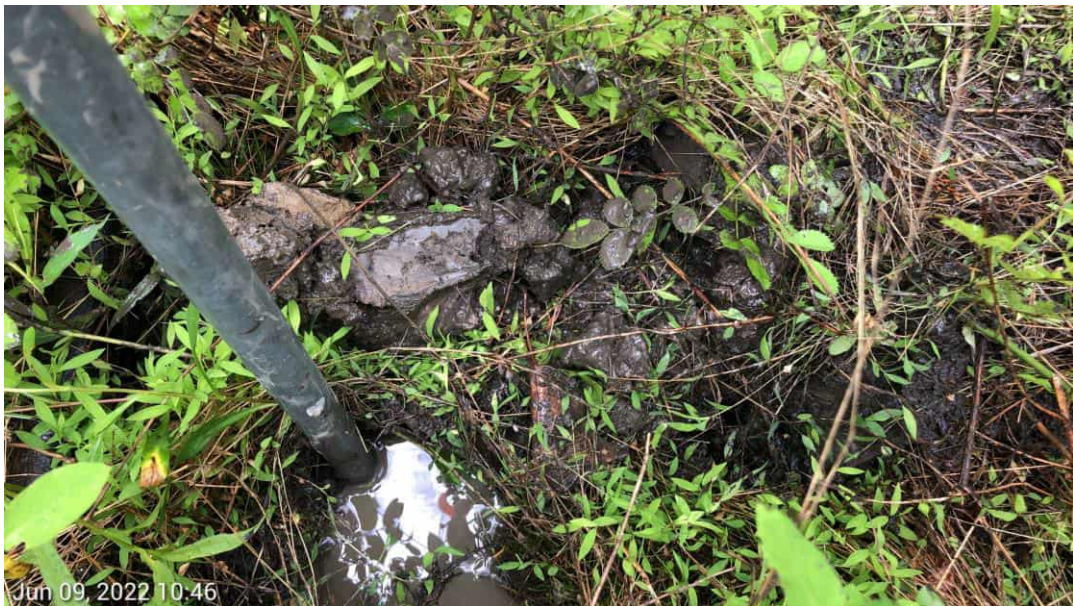
PFO Wetland AC- Soils