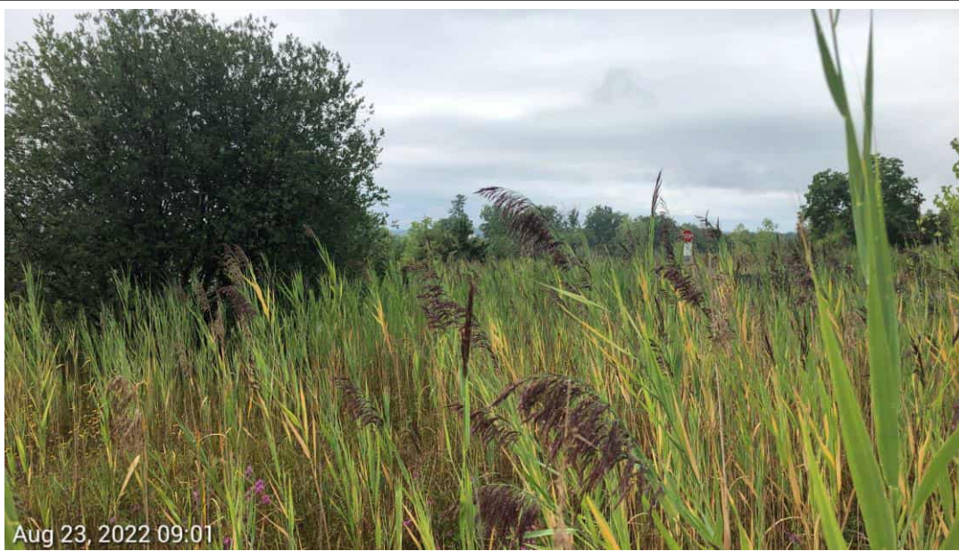
PEM Wetland GD- View facing South.