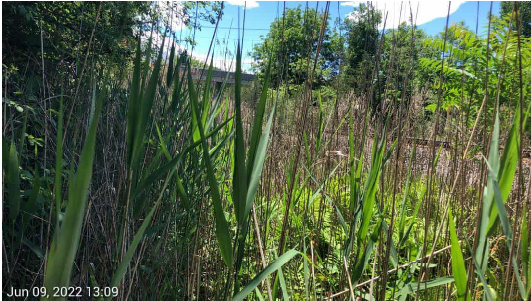
PEM Wetland BC- View facing North.