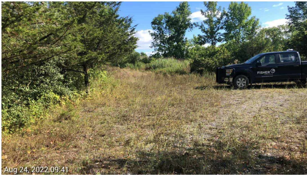
Upland GJ- View facing North.