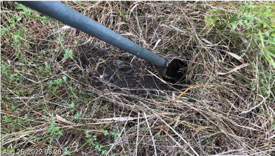
Upland GR Soils