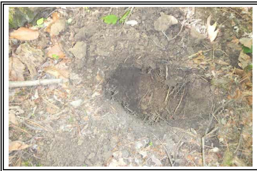
Upland GP7A-A- Soils