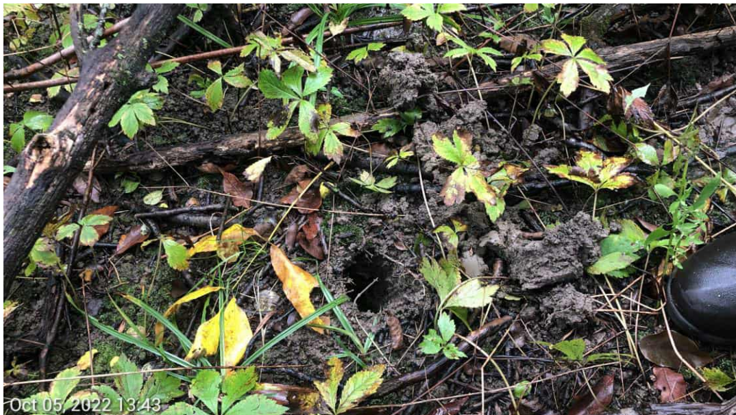
PSS Wetland TB- Soils