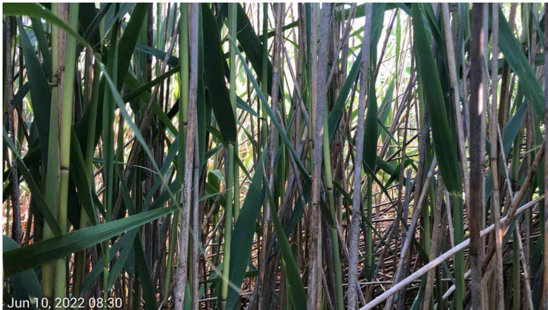
PEM Wetland E- View facing North.