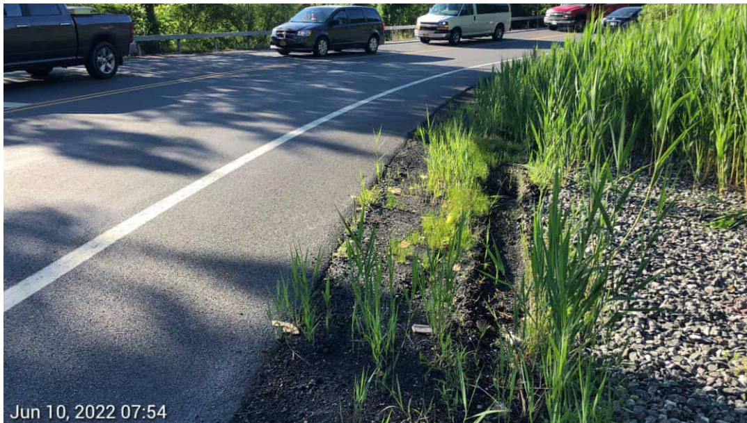
Upland O1- View facing North.