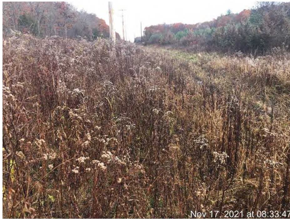
Upland FA-AP, AO, AN - View facing North.