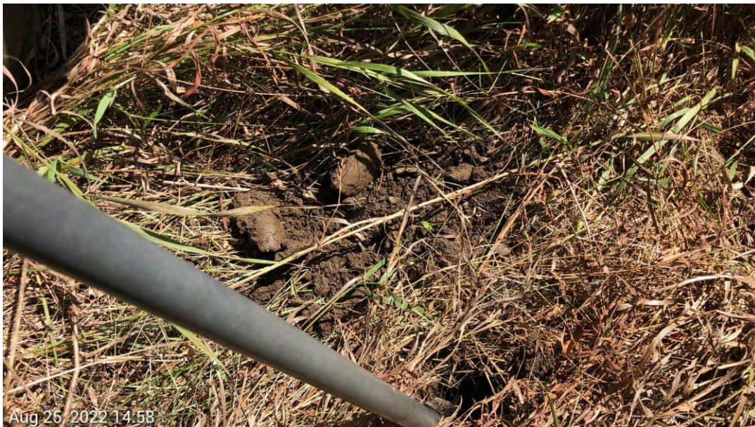
Upland GQ Soils