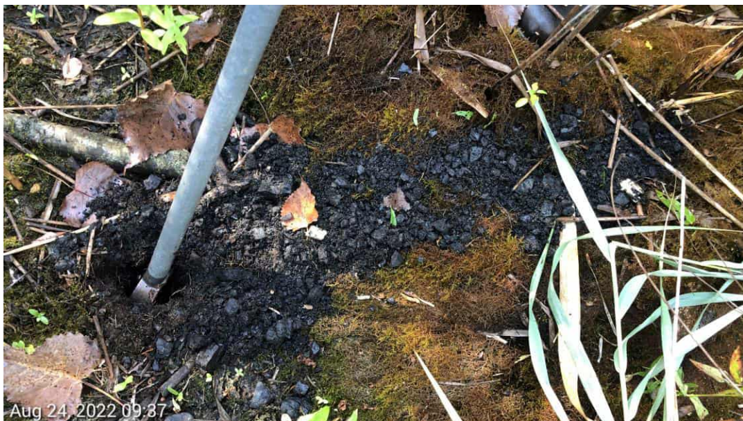
PEM Wetland GJ- Soils