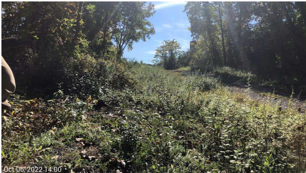
Upland TE- View facing East.