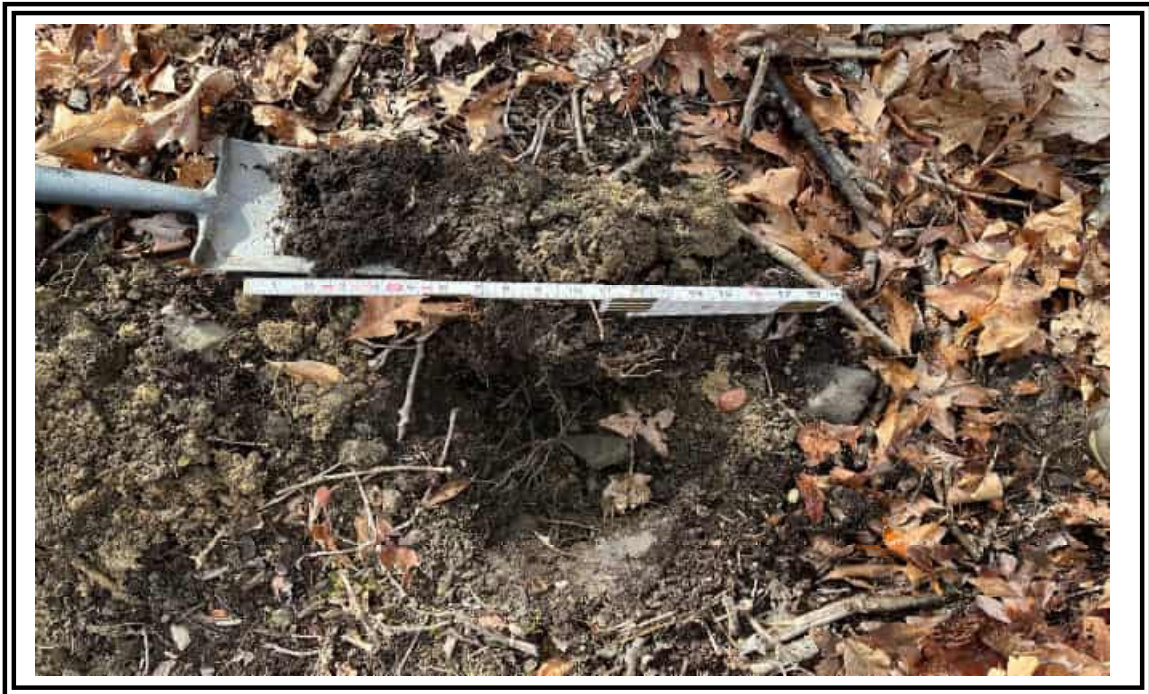
Upland FA-AO, AP, AN (7A-X-10) - Soils