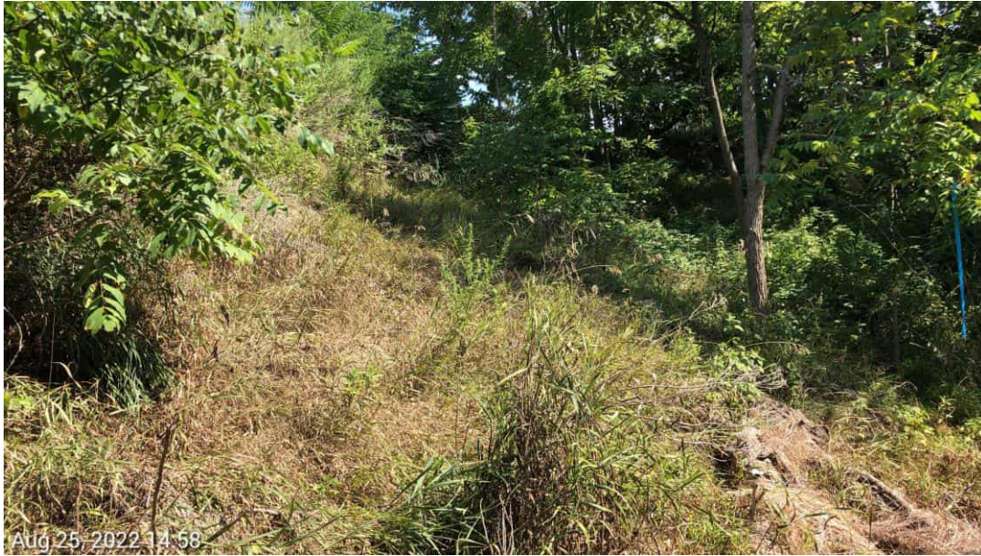
Upland GQ- View facing South.