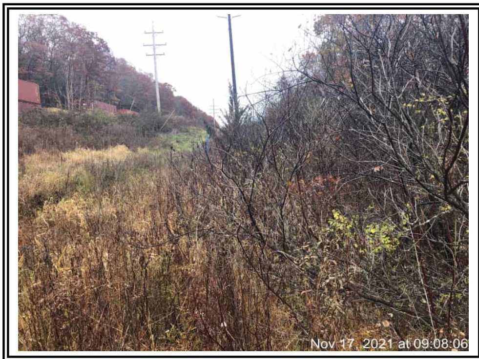
Wetland FA-AP, AO, AN - View facing North.