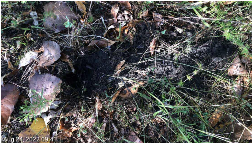
Upland GJ- Soils