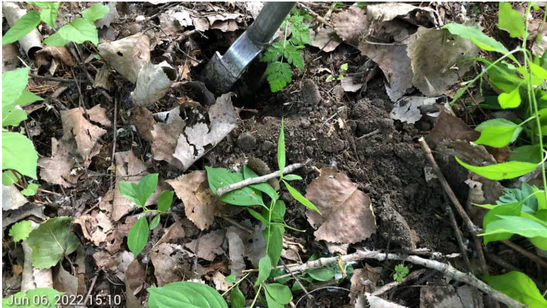
PFO Wetland LC- Soils