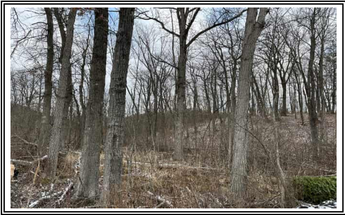
Wetland FA-AO, AP, AN (21B) - View facing north.