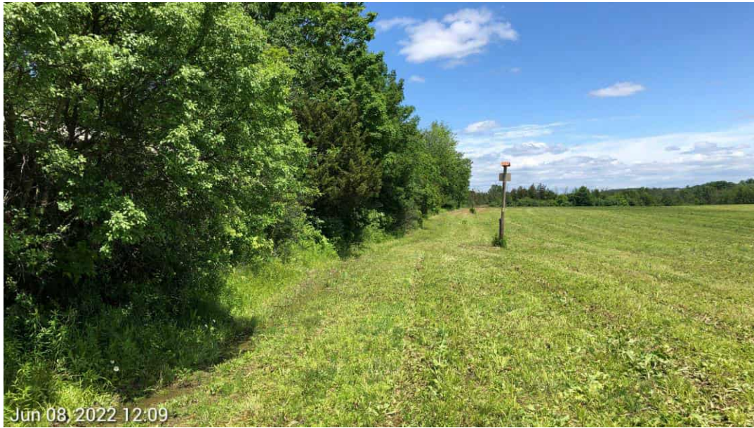
Upland DC/EC- View facing North.