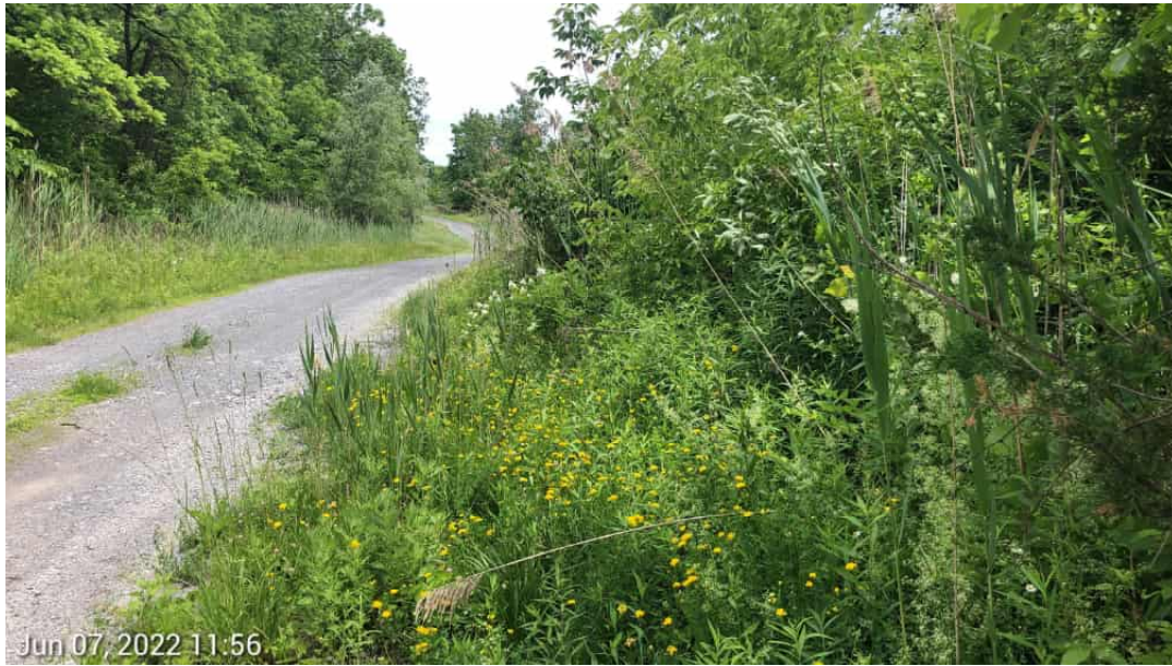
Upland IC- View facing North.