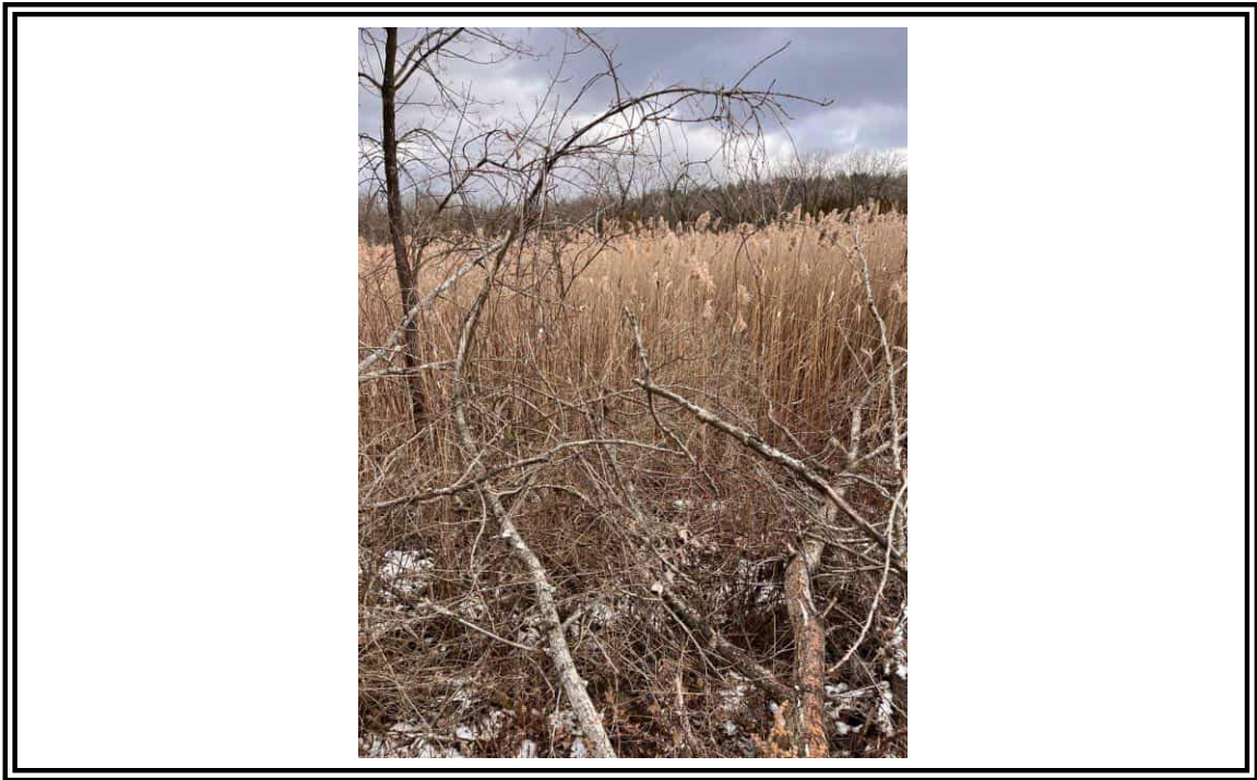
Wetland GP7A - Area 14