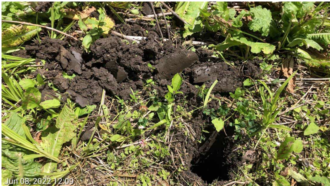
Upland DC/EC Soils