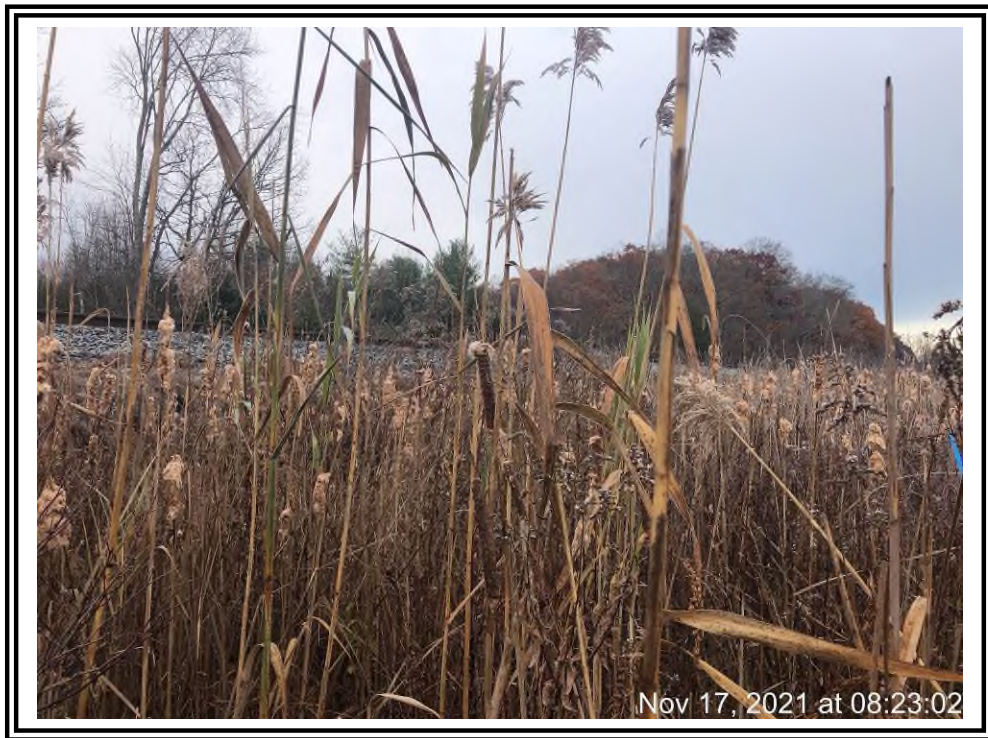
Wetland FA-AP, AO, AN - View facing North.