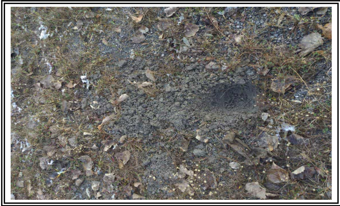
Upland JC- Soils