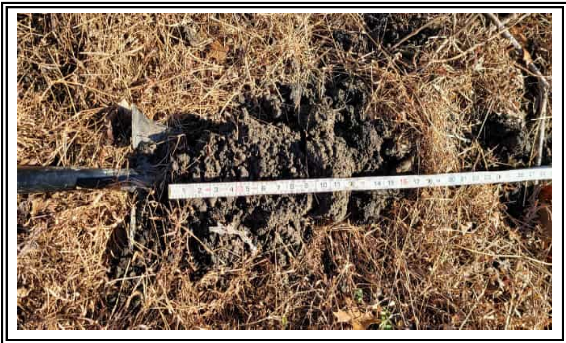
Wetland 7A-W (PEM community) - Soils