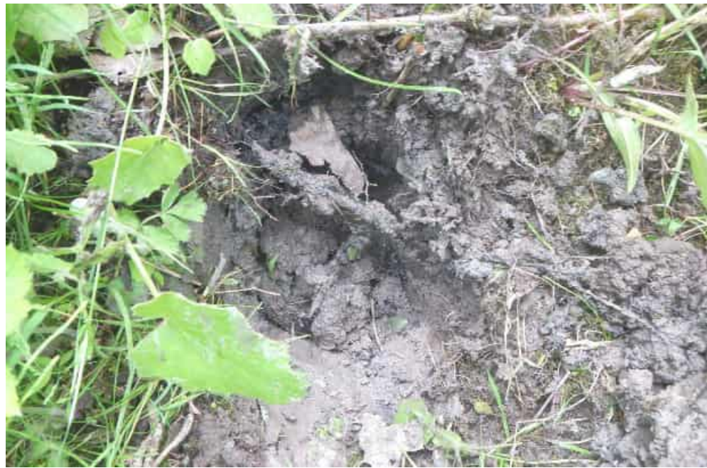
Wetland GP7A-B - Soils