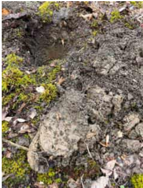
Upland GP7A -Area 13 - Soils