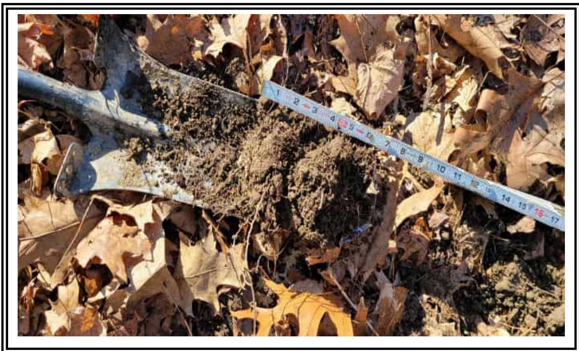
Upland 7A-W (PFO community) - Soils