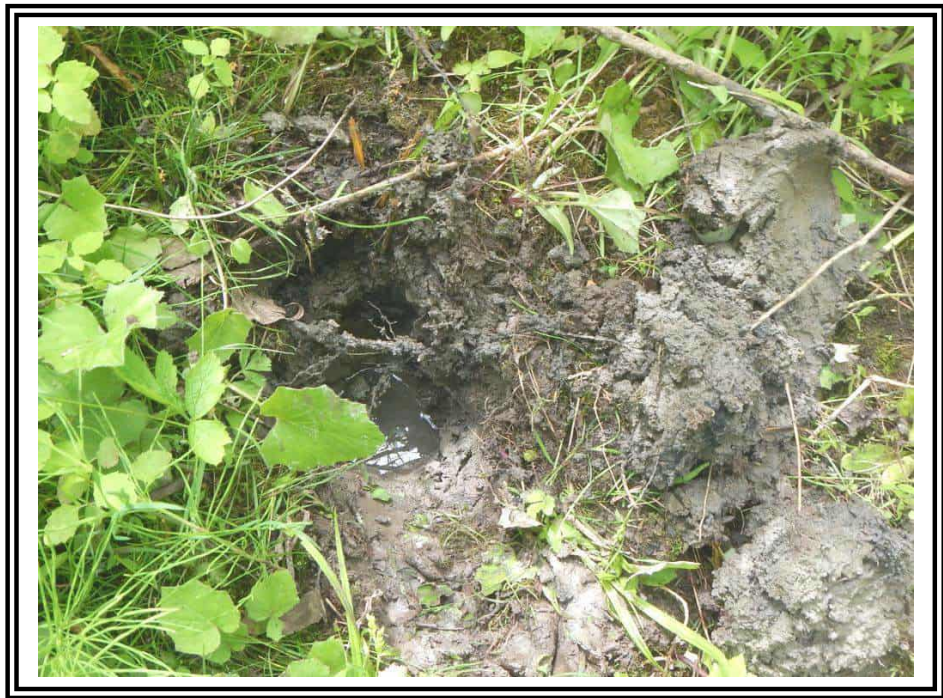
Wetland GP7A-C- Soils