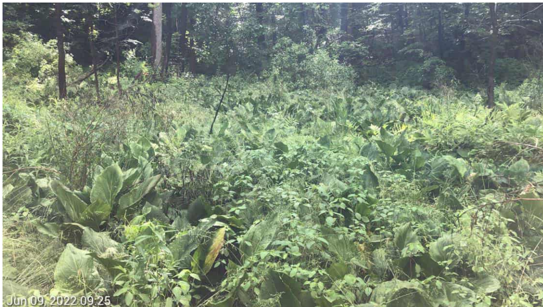
PEM Wetland M1- View facing North.