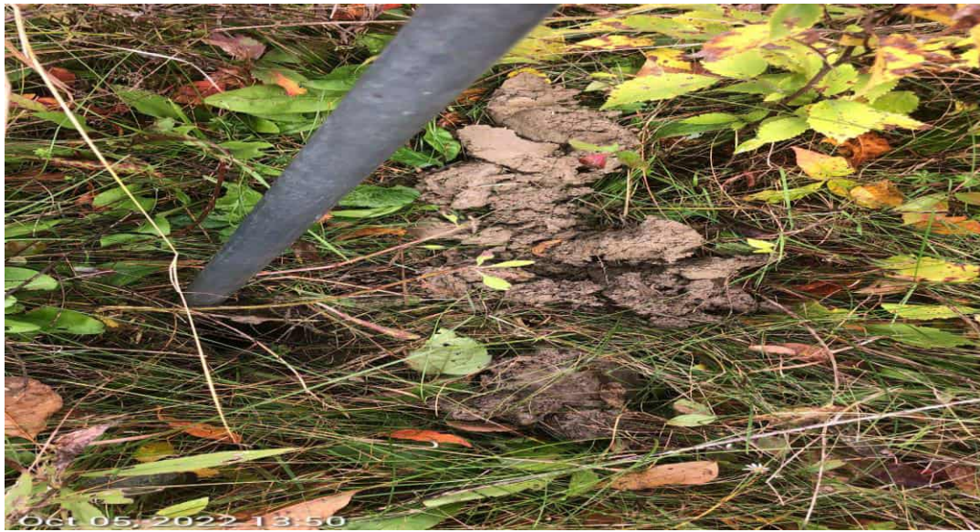
Upland TB Soils