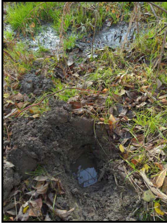
Wetland CC - Soils