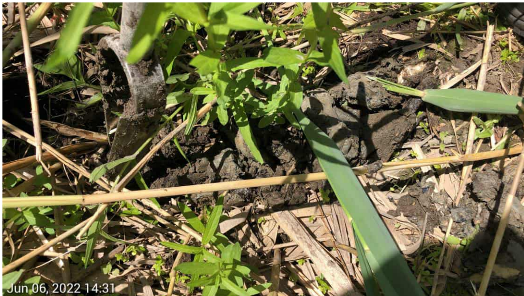
PEM Wetland MC- Soils