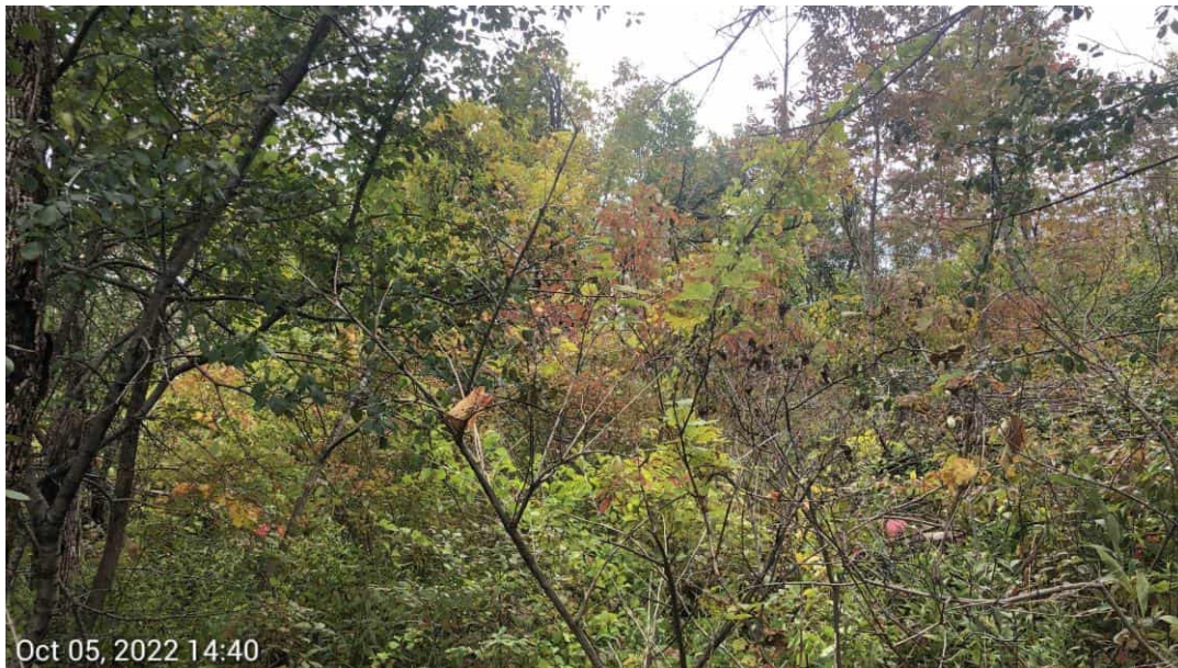
PFO Wetland TC- View facing North.