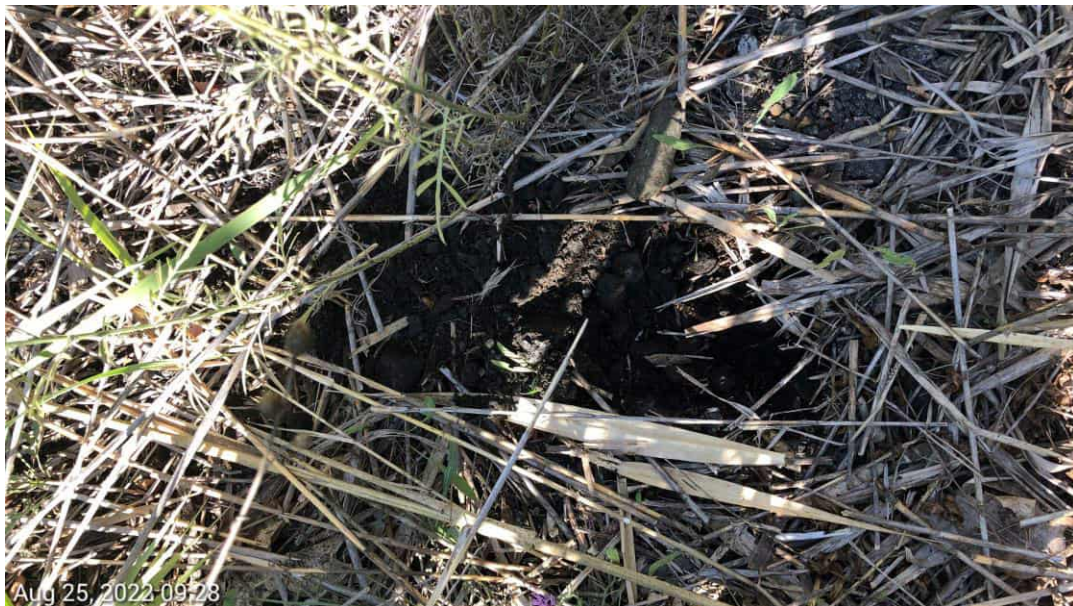
PEM Wetland GN- Soils