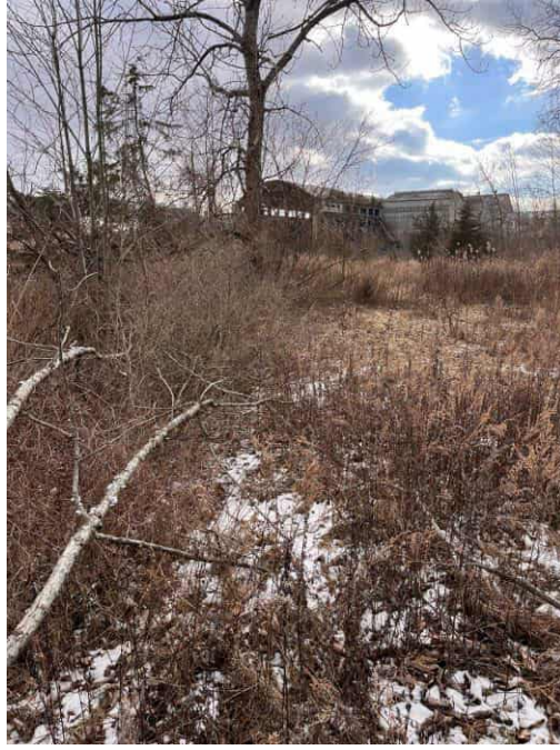
Upland GP7A – Area 14