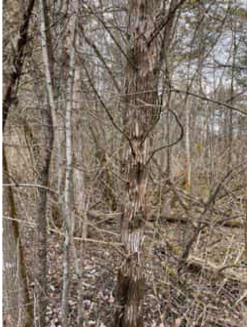
Upland GP7A – Area 13