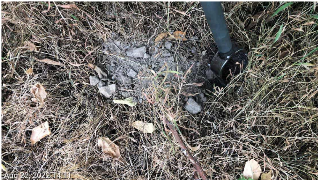
Upland GC- Soils