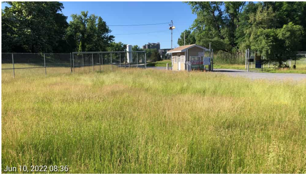
Upland E- View facing South.