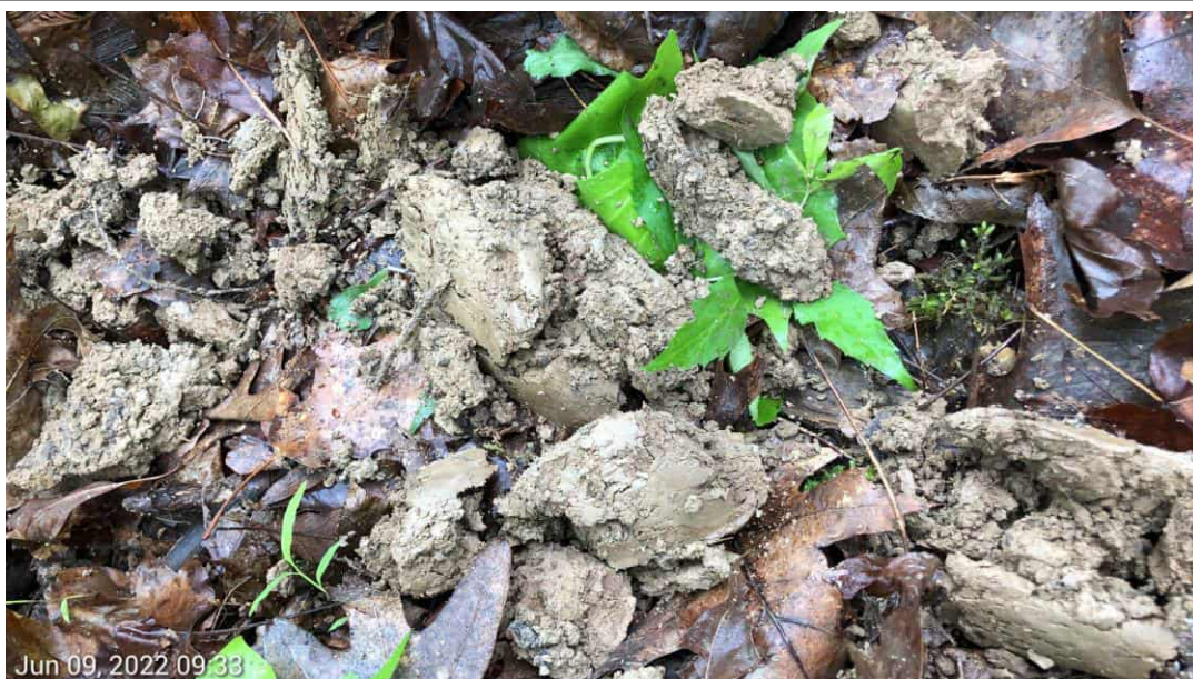
Upland M1 Soils