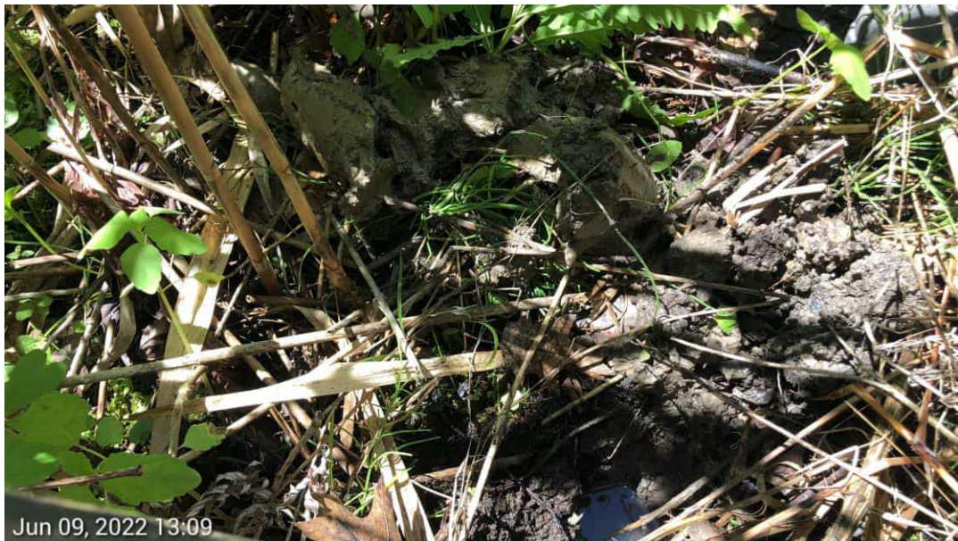
PEM Wetland BC- Soils