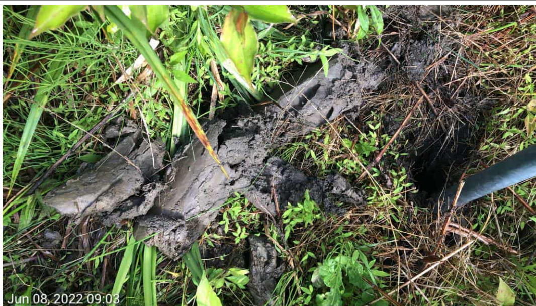
PSS Wetland FC- Soils