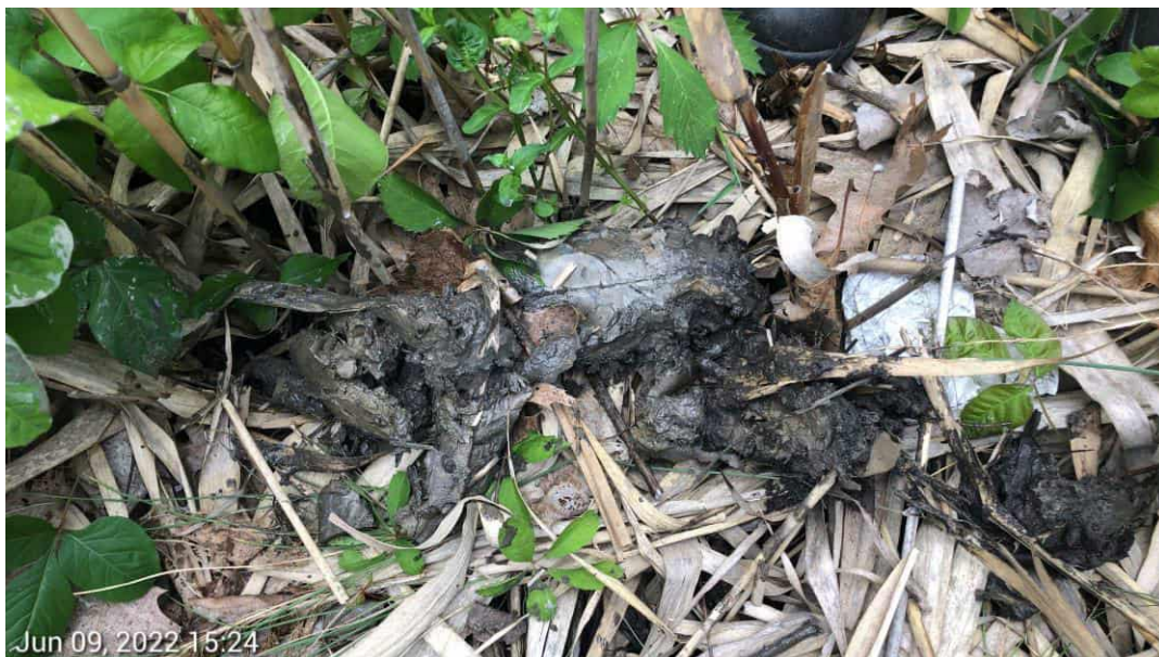
PEM Wetland O1- Soils