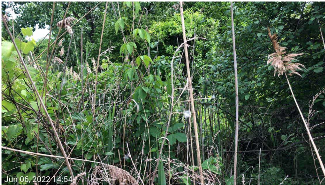
PEM Wetland LC- View facing South.