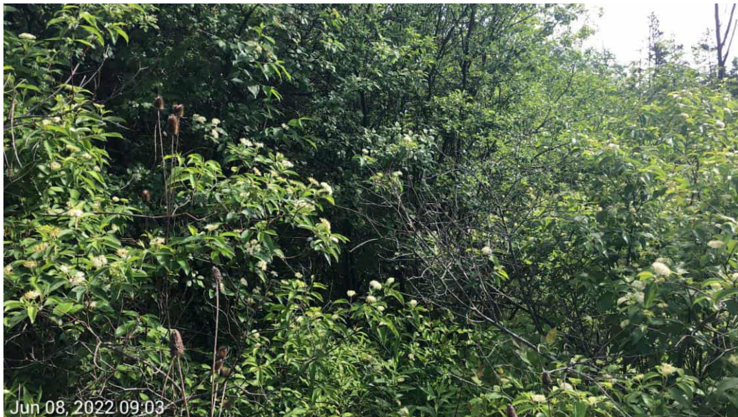
PSS Wetland FC- View facing North.