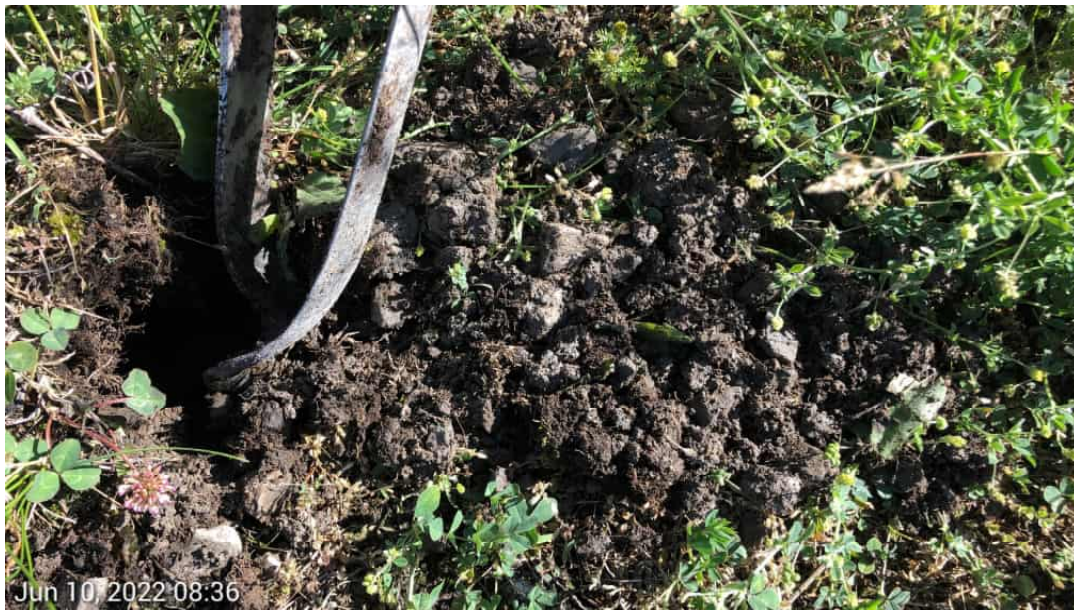
Upland E Soils