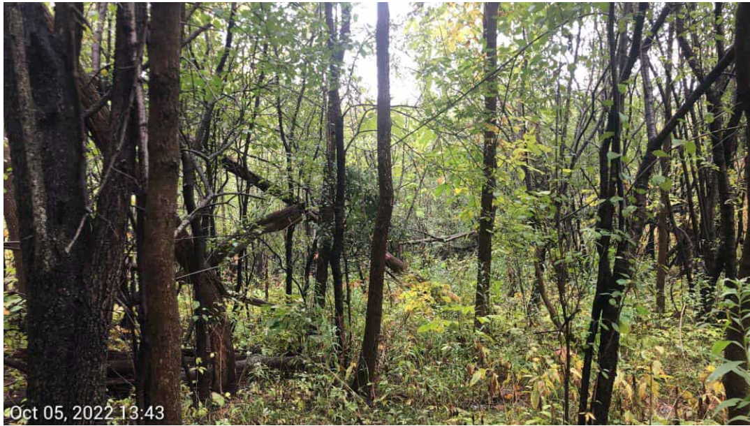
PSS Wetland TB- View facing North.