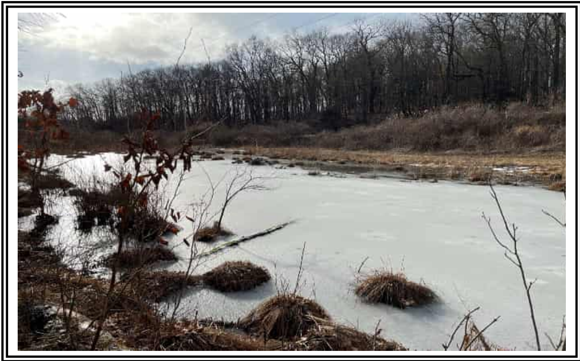
Wetland FA-AP, AO, AN (7A-X-10) - View facing southwest.