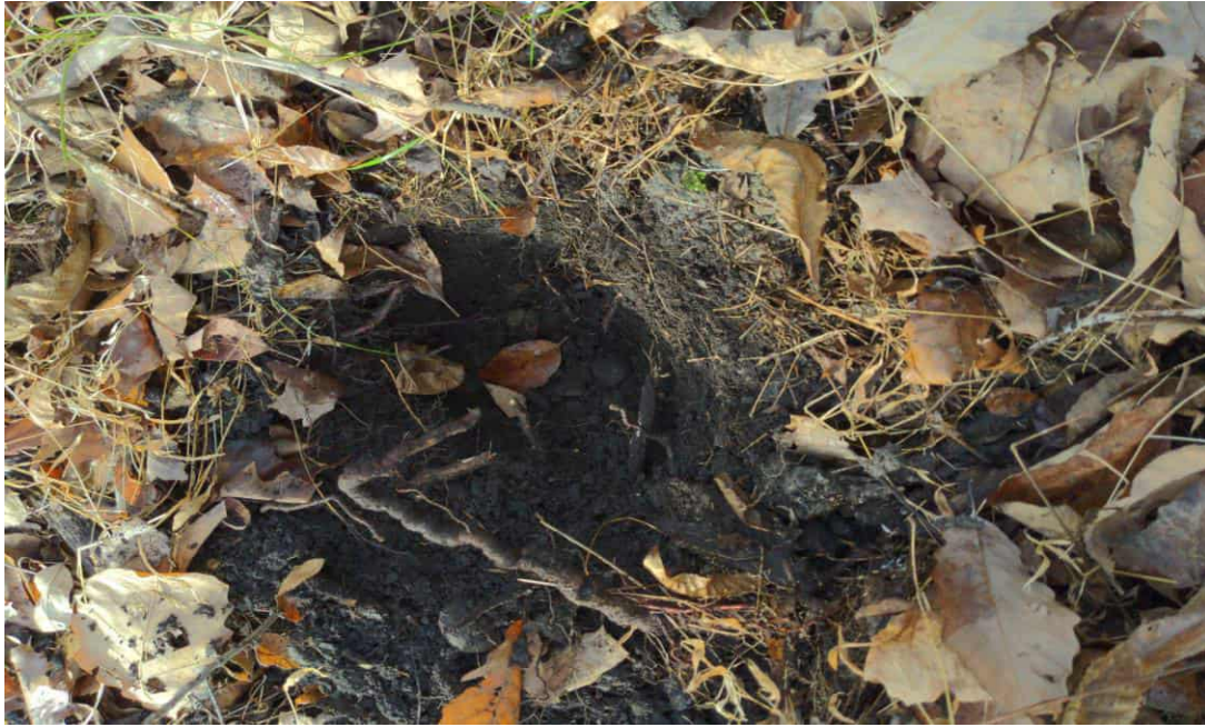
Upland CC- Soils