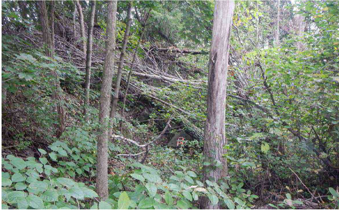
Wetland G-A- View facing Northwest