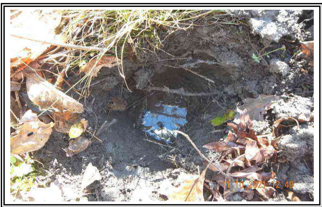
Wetland G-R-V- Soils