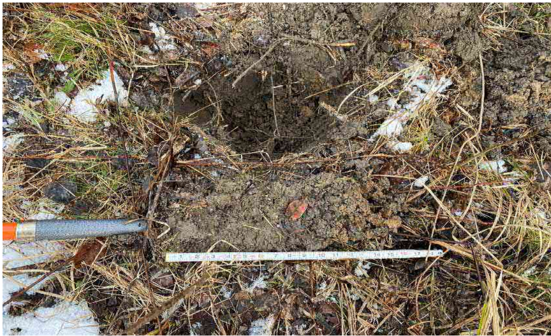
Wetland G-R-X1-00 - Soils