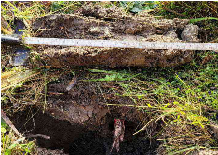
Wetland CJJJ-9 Soils