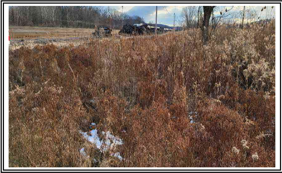
Upland G-R-X1-TTTT- View facing southeast.