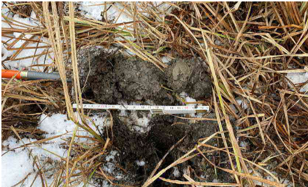
Wetland G-R-X1-AA (PSS)- Soils