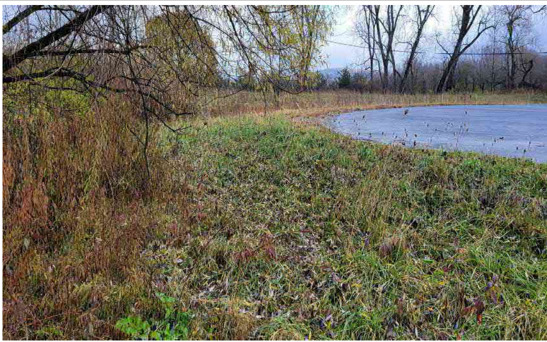
Upland CJJJ-9 View facing north