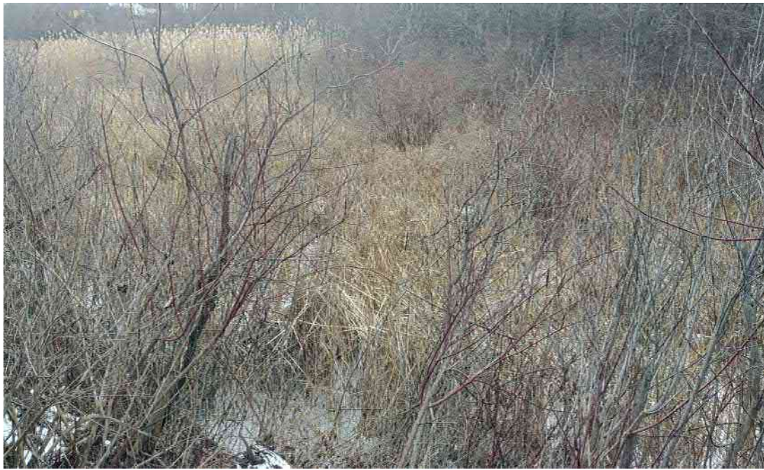
Wetland G-R-S-15 - View facing southwest