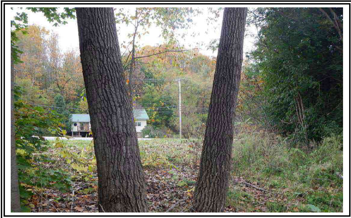
Upland G-B- View facing Northwest