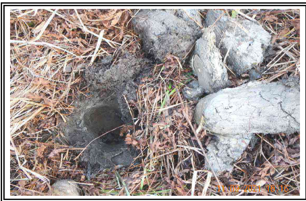
Wetland G-R-U- Soils