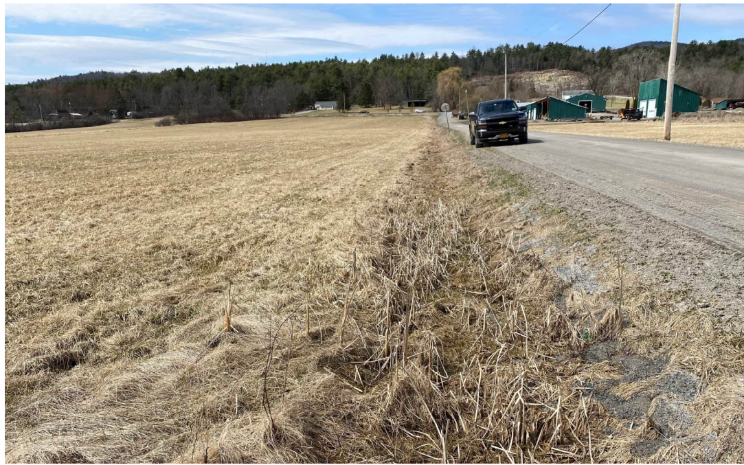
Wetland SA4-2- View facing west