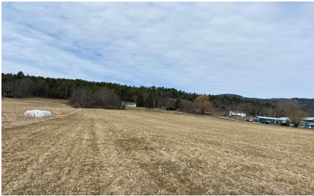
Upland SA1-11- View facing west