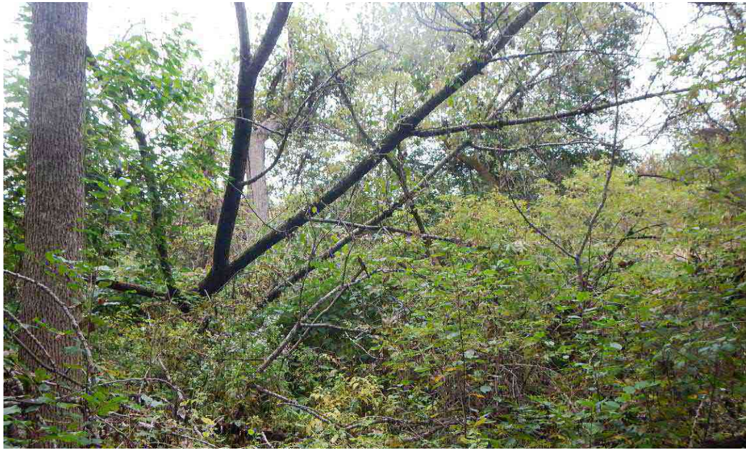
Upland G-A- Northeast