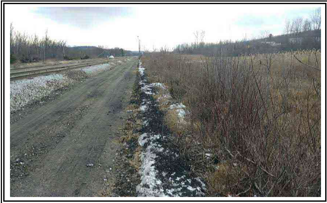
Upland G-R-S-15 and G-R-S-16- View facing south