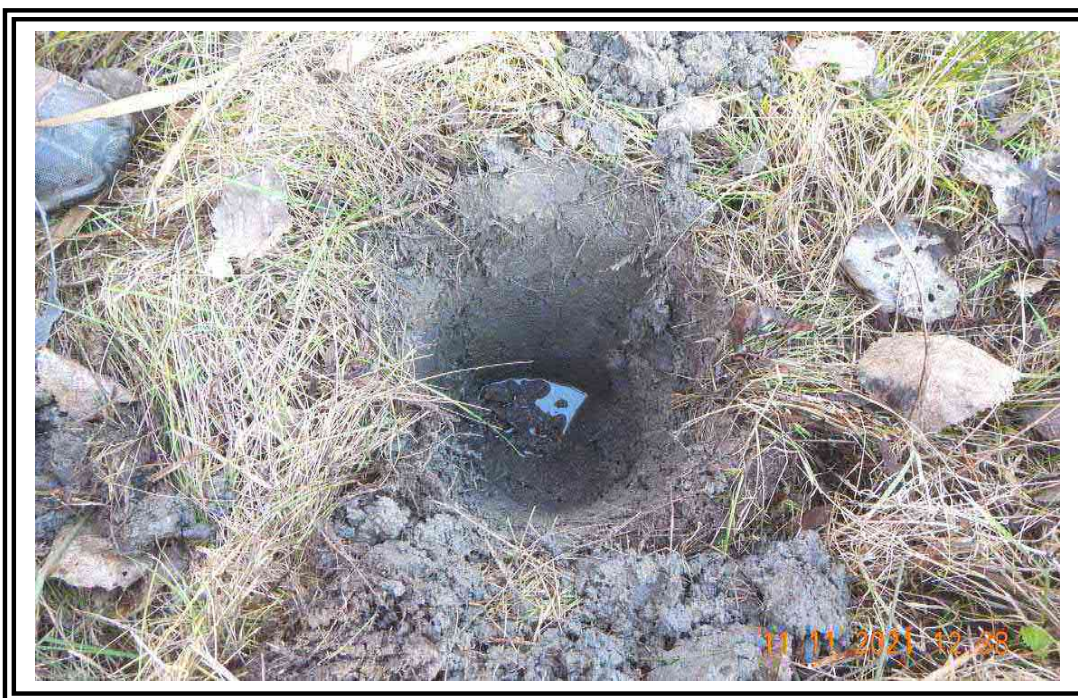
Wetland G-R-Y- Soils