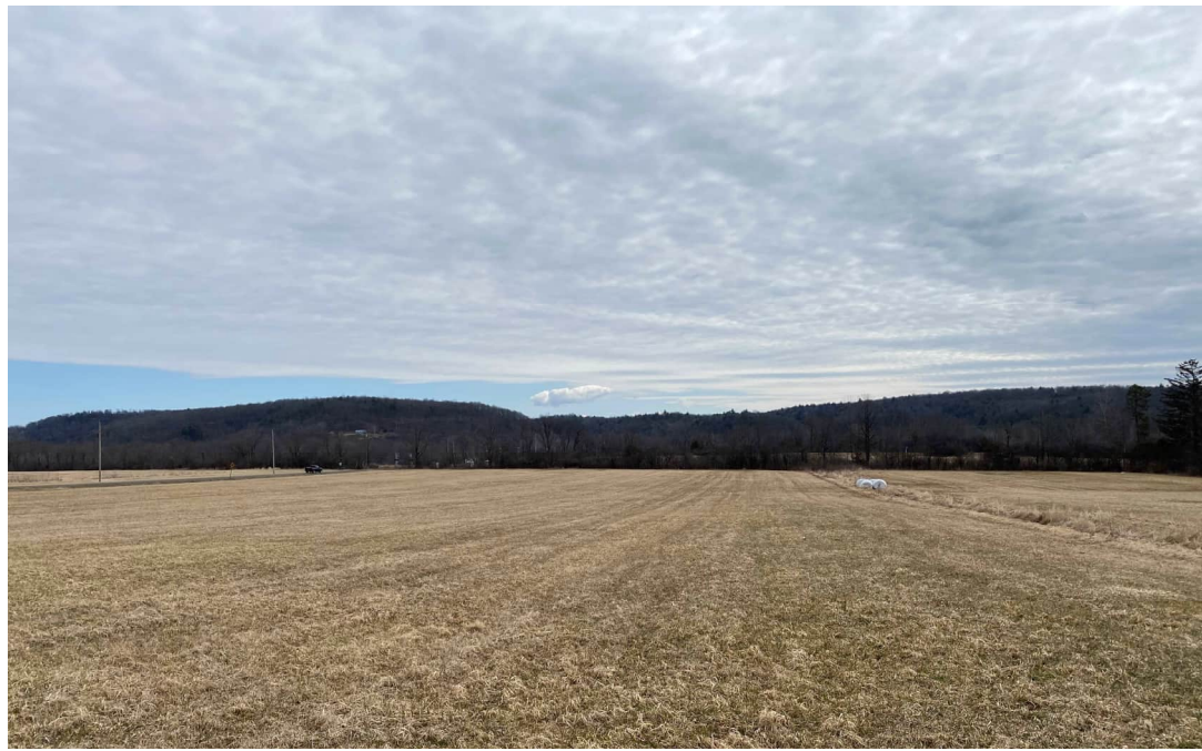
Upland SA1-5- View facing east