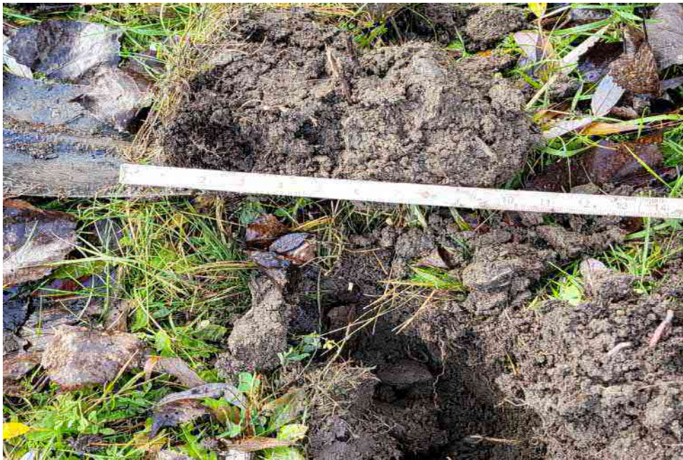
Upland CJJJ-9 Soils