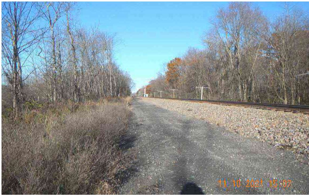
Upland G-R-X- View facing North