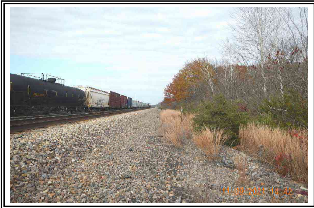
Upland G-R-U- View facing North