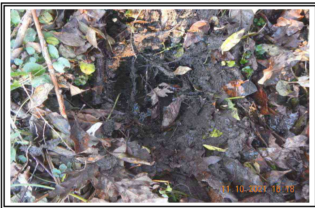
Wetland G-R-X- Soils