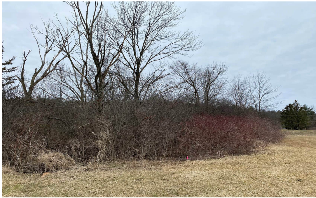
Wetland SA1-5- View facing west