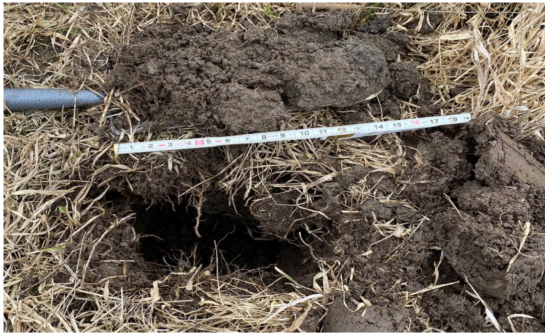
Wetland SA1-5- Soils