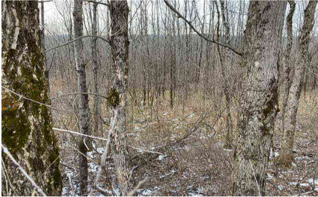
Wetland G-R-X1-00- View facing west