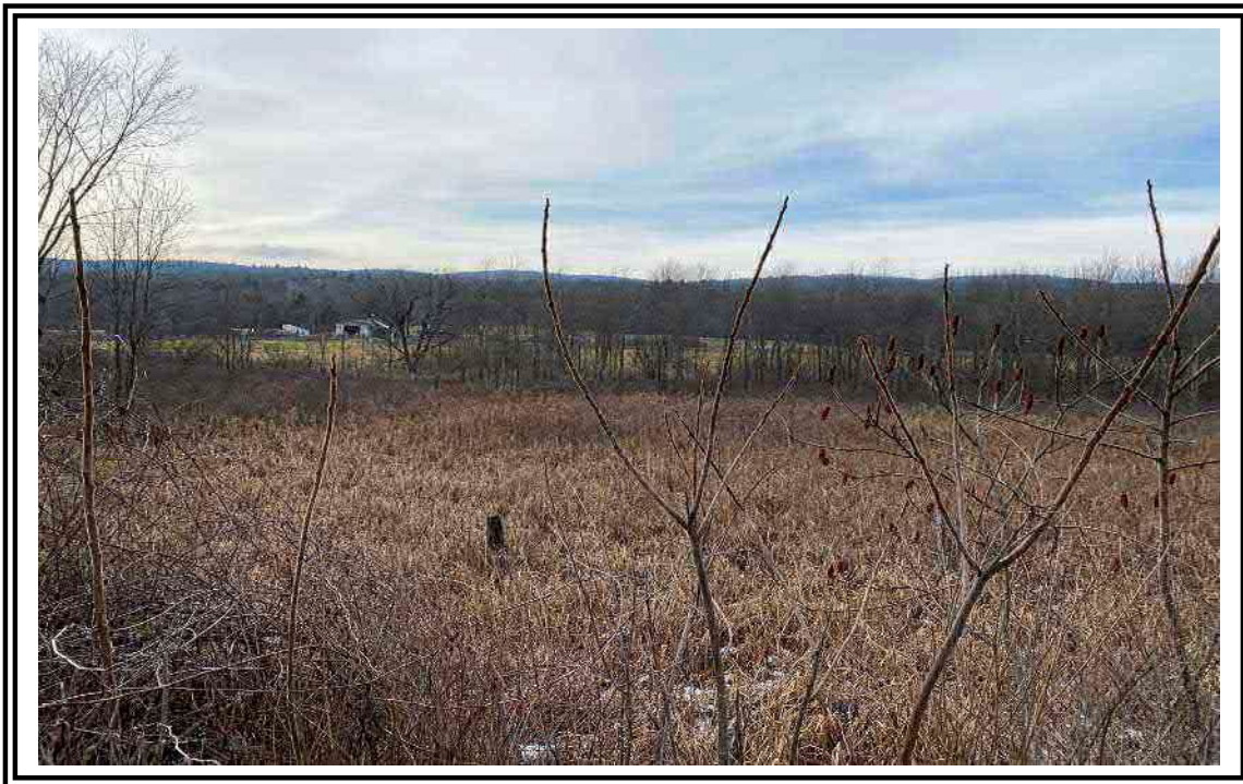
Wetland G-R-X1-AA (PEM)- View facing west