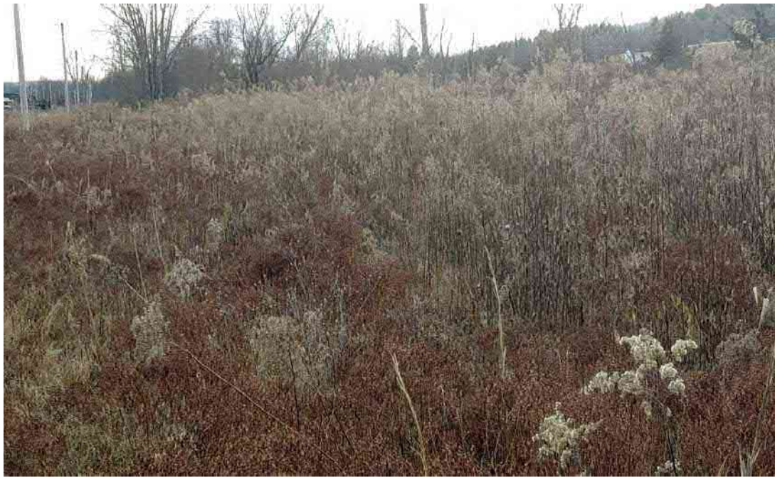
Upland G-R-X1-RRRR and G-R-X1-SSSS - View facing south/southwest