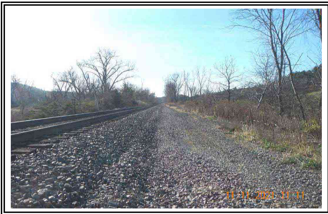
Upland G-R-Y- View facing South