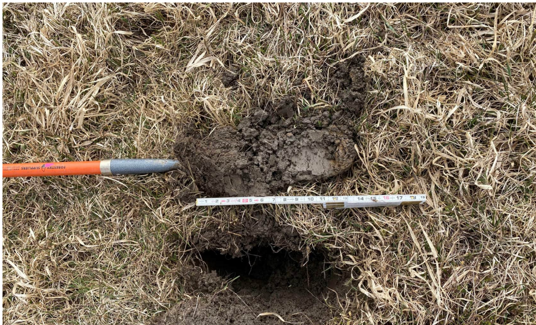
Upland SA1-11- Soils