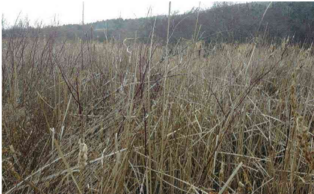
Wetland G-R-X1-RRRR - View facing southwest