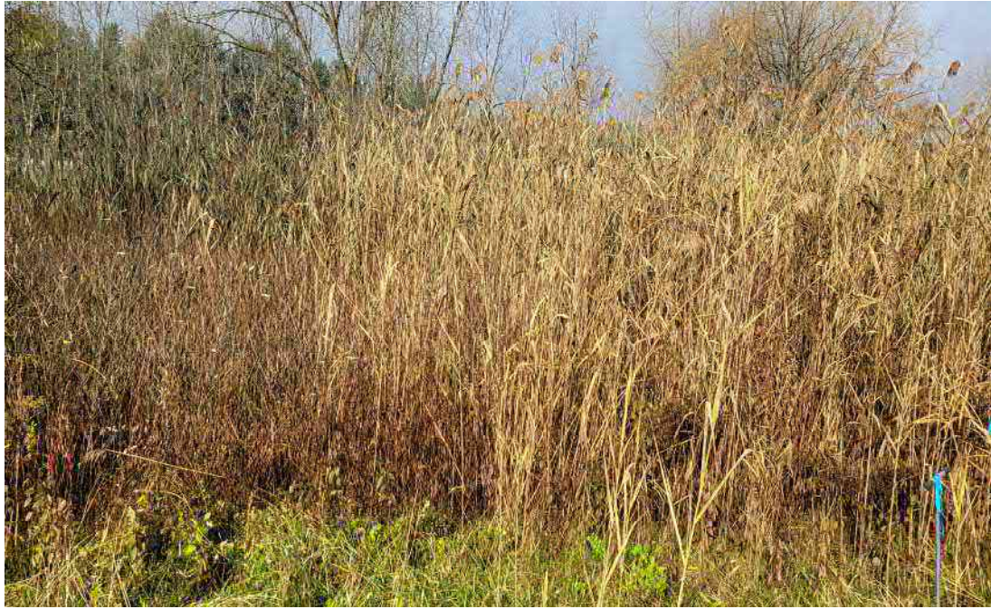
Wetland CJJJ-9 View facing northwest