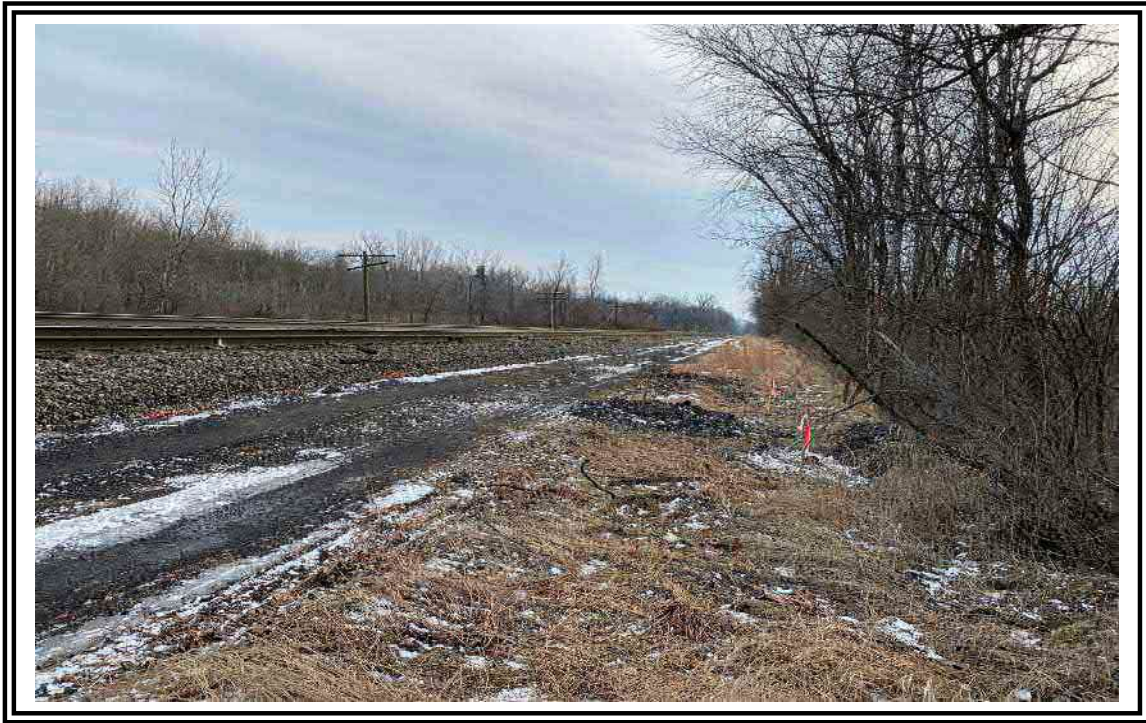
Upland G-R-X1-OO- View facing south