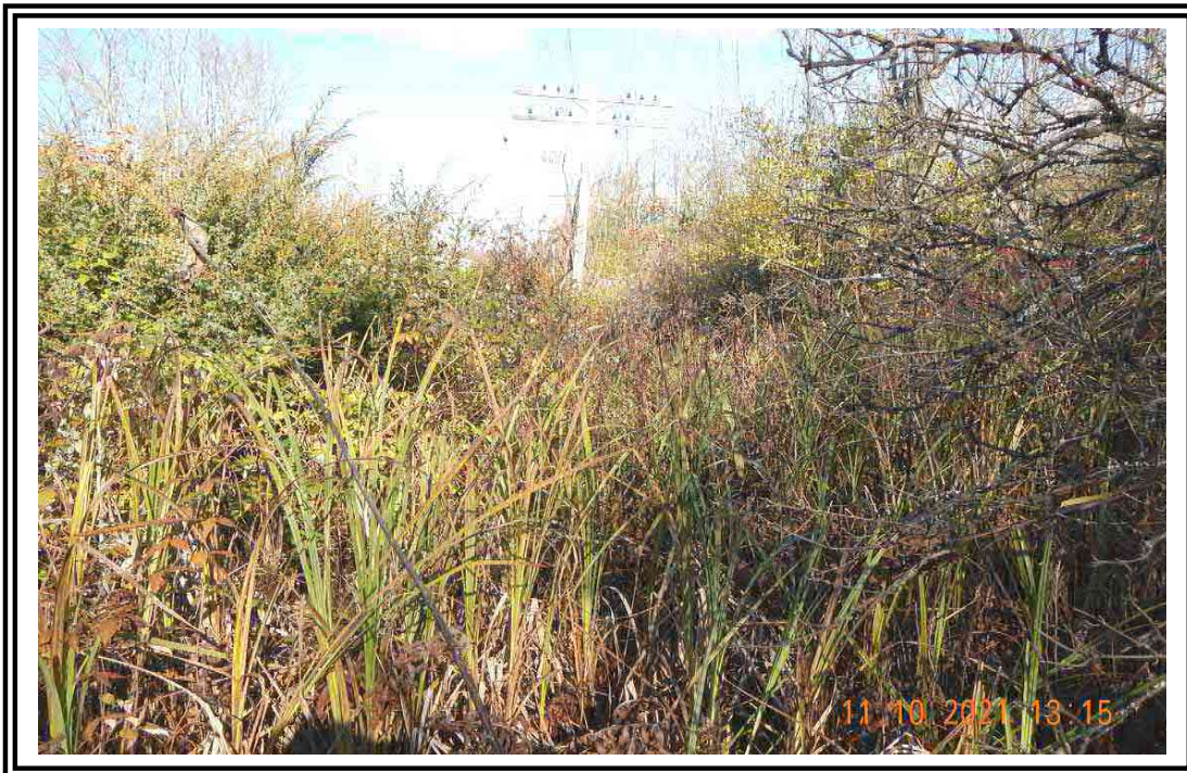
Wetland G-R-V- View facing North