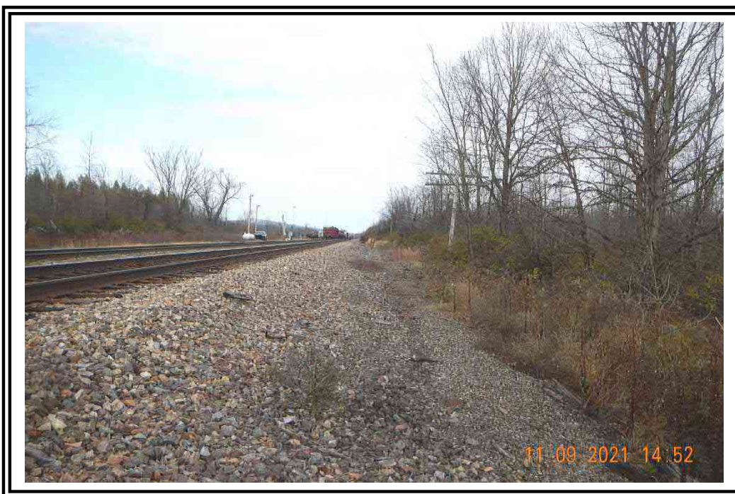
Upland G-R-U- View facing North