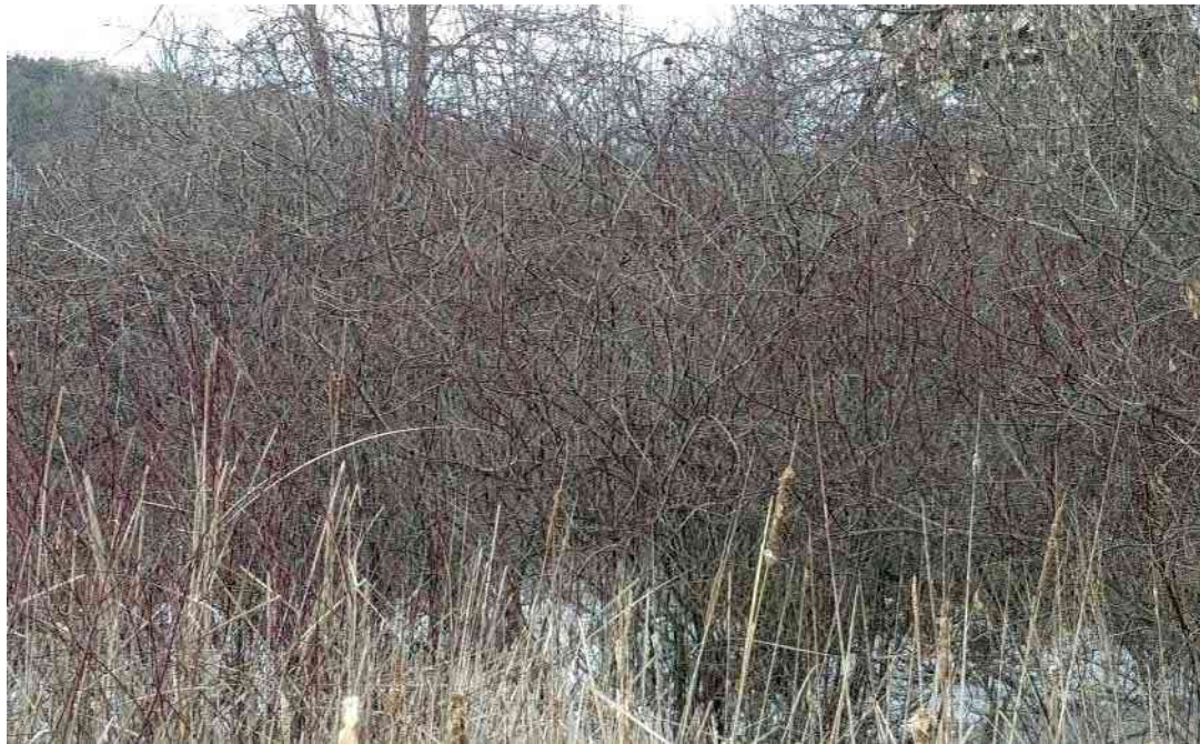
Wetland G-R-X1-SSSS - View facing west/northwest