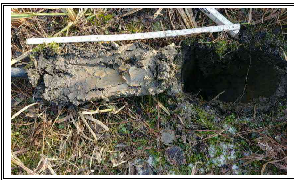
Wetland G-R-X1-SSS - Soils