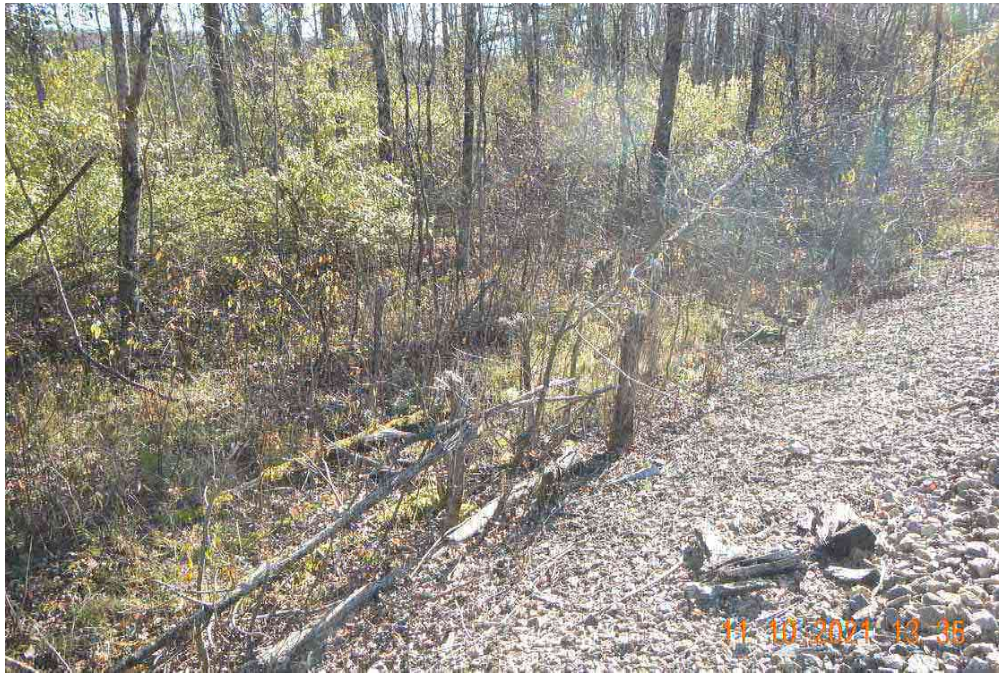
Upland G-R-W- View facing West