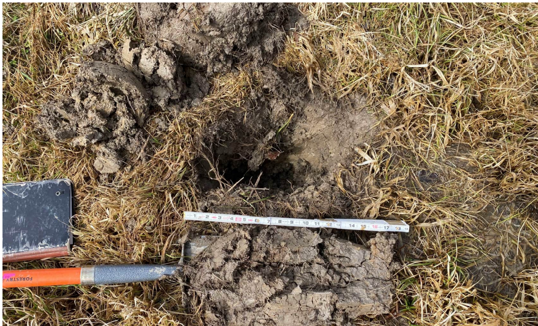
Wetland SA3-1- Soils