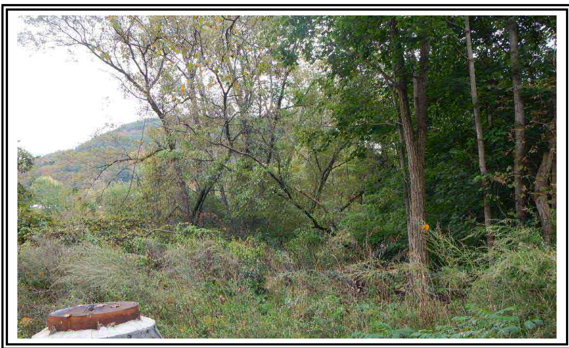
Upland G-B- view facing East