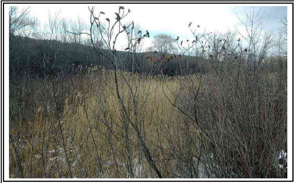
Wetland G-R-S-16 - View facing northwest