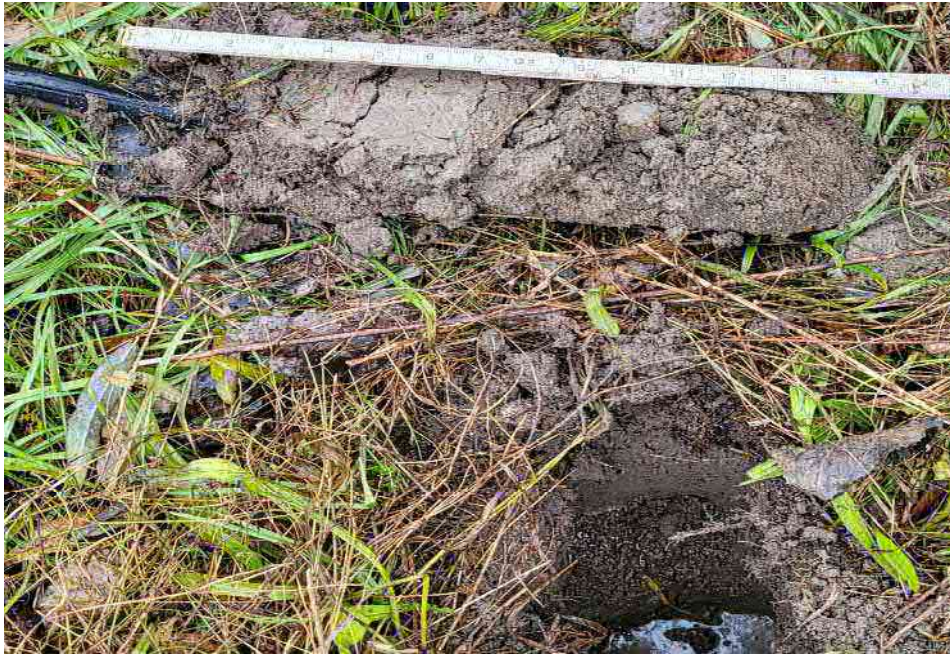
Upland CIII-2 Soils