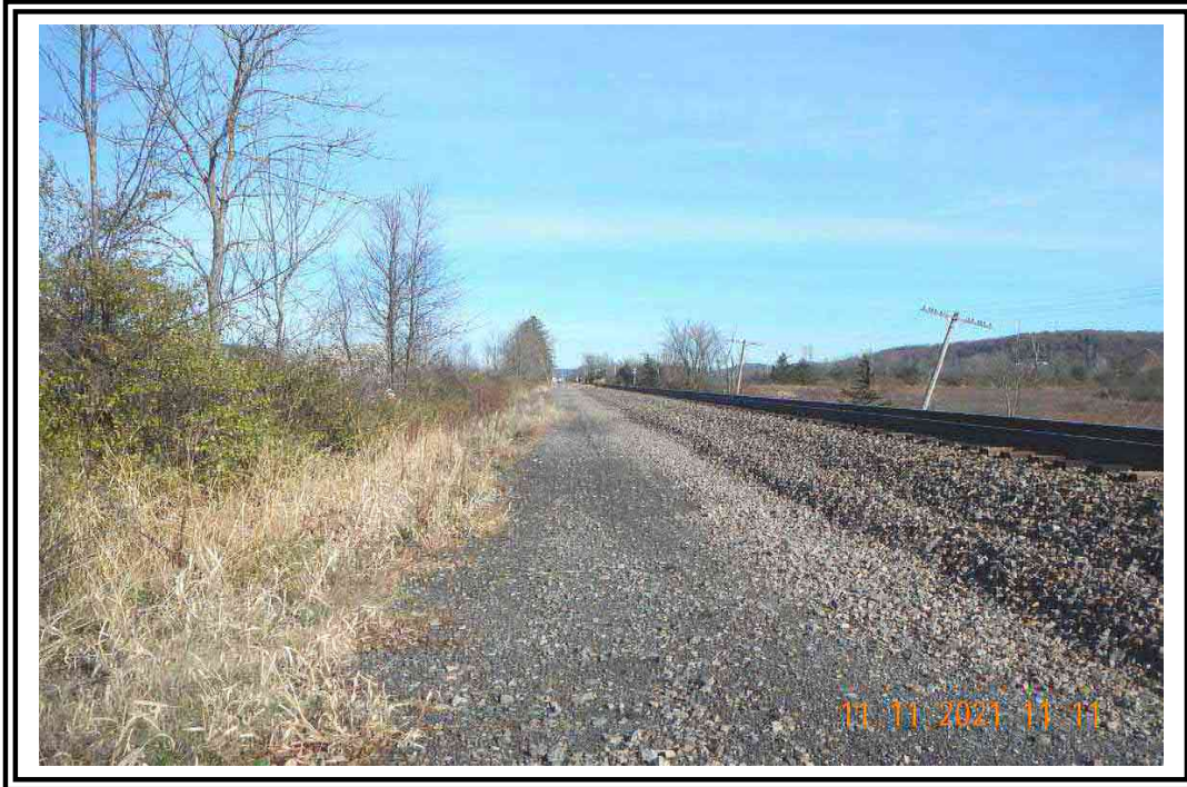
Upland G-R-Y- View facing North