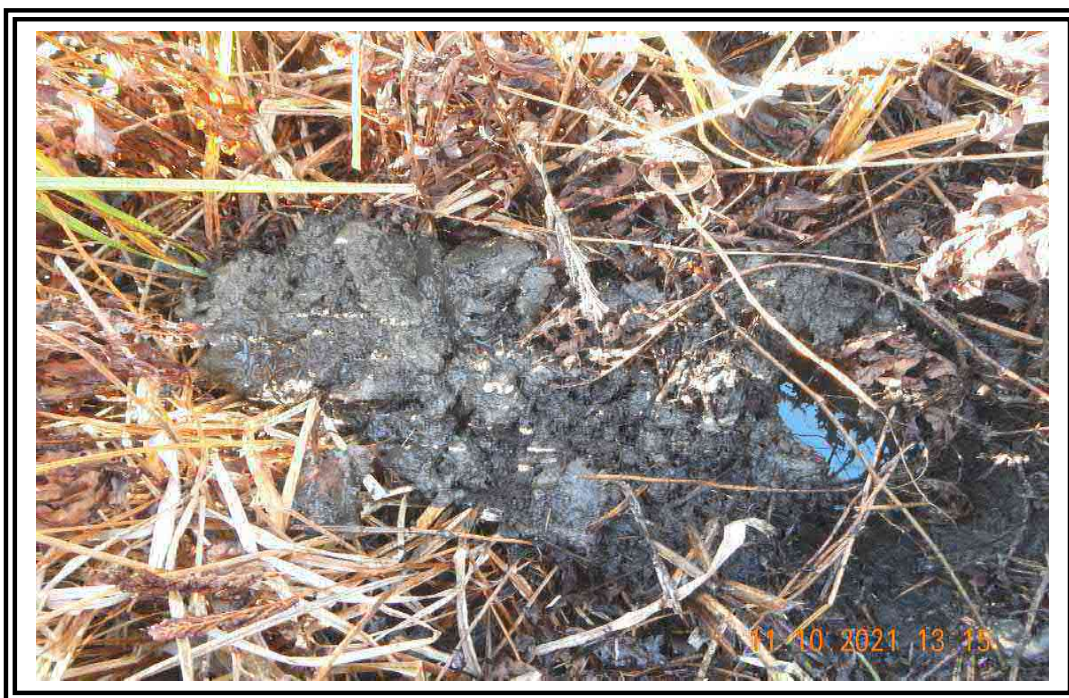
Wetland G-R-W- Soils