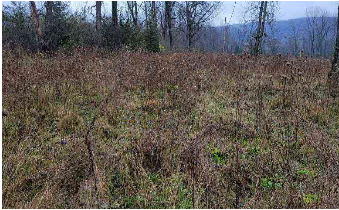
Upland CIII-2 View facing east