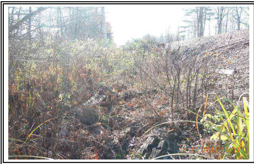
Upland G-R-V- View facing South