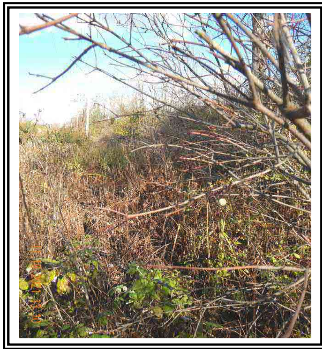
Wetland G-R-W- View facing North