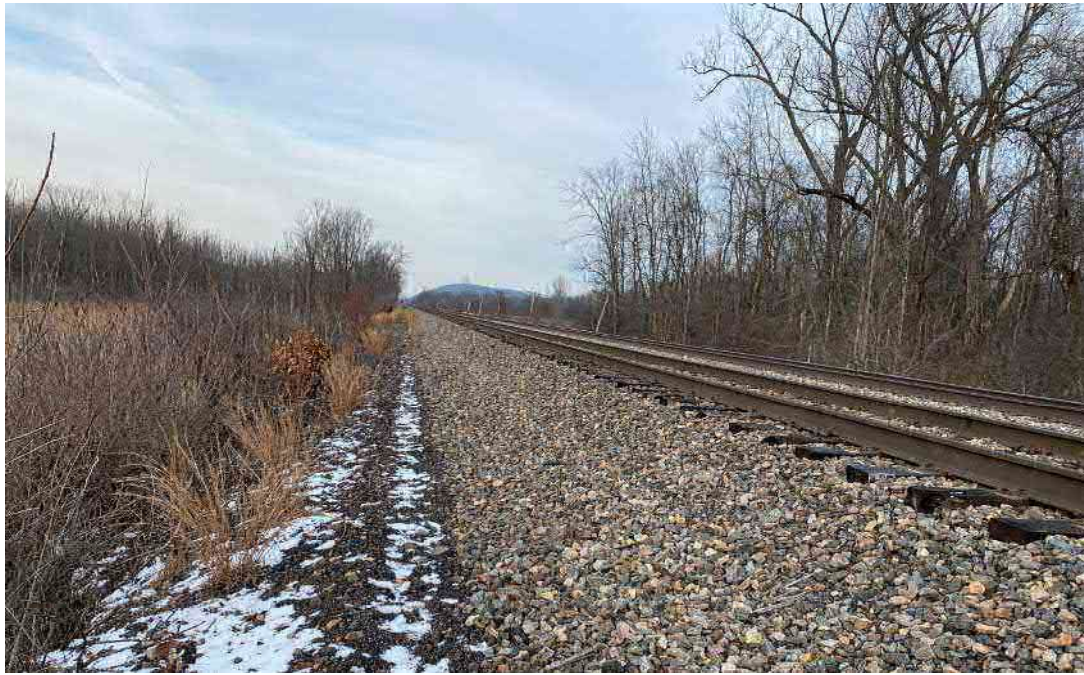
Upland G-R-X1-AA- View facing north