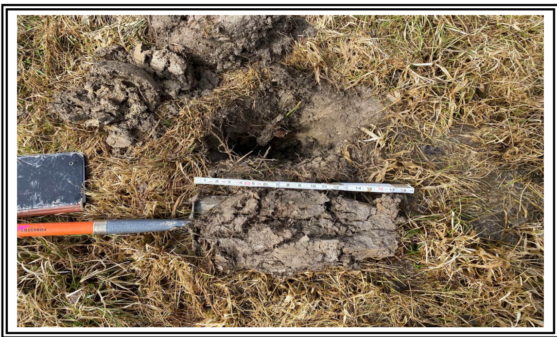
Wetland SA2-10- Soils