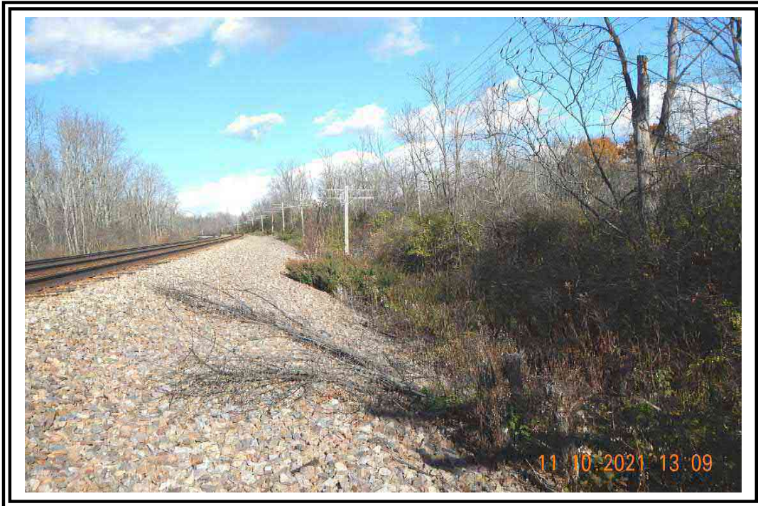
Upland G-R-V- View facing North