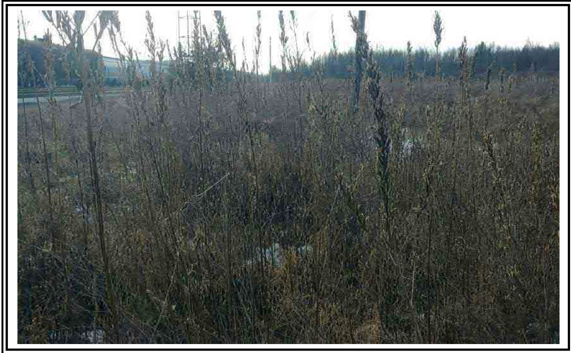
Upland G-R-X1-SSS - View facing south