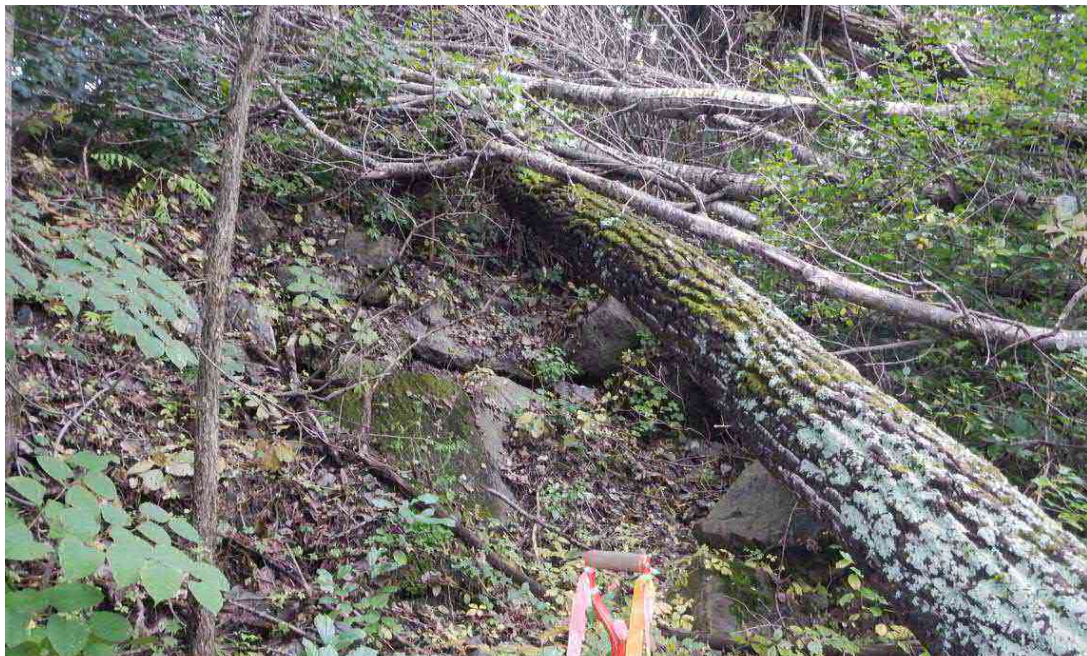
Wetland G-A- View facing Northwest