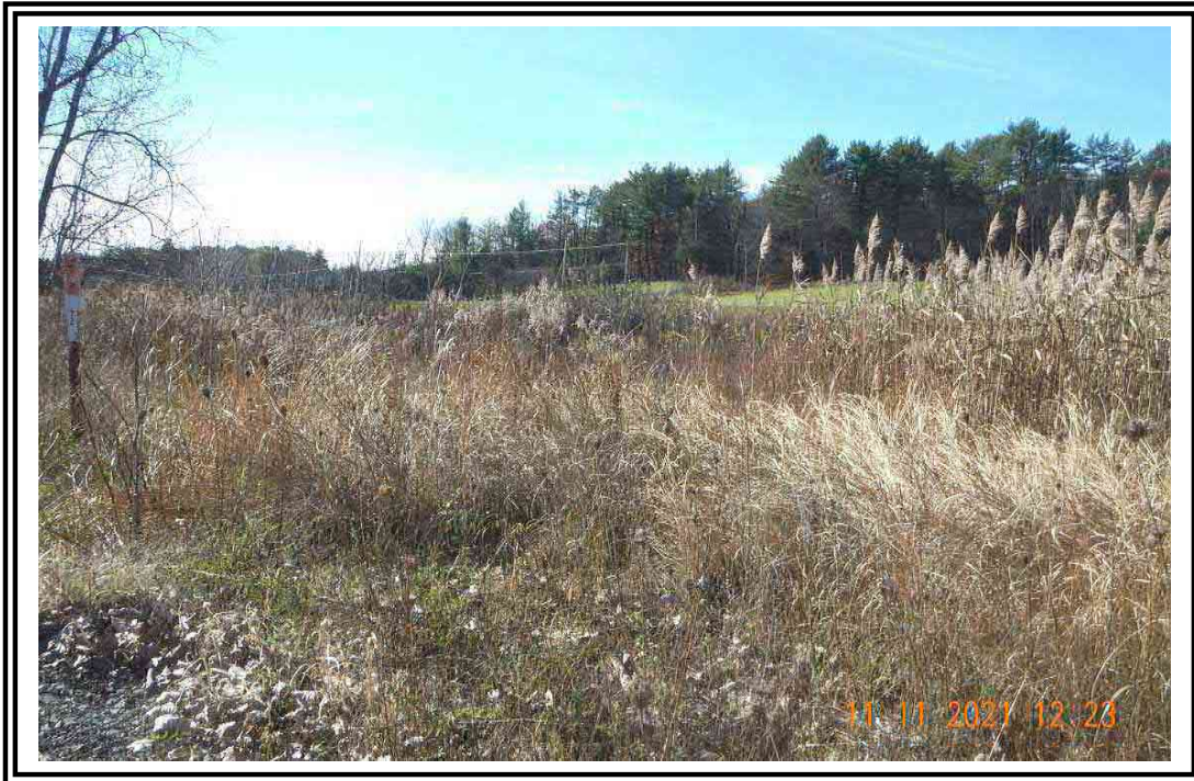
Wetland G-R-Y- View facing Northwest