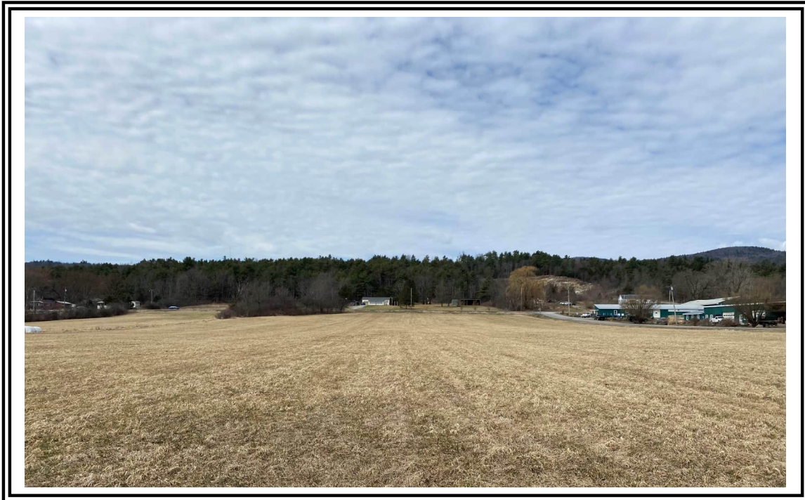
Upland SA2-10, SA3-1 & SA4-2- View facing west