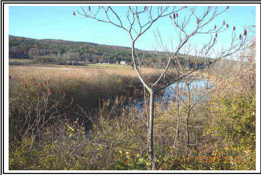
Wetland G-R-X- View facing West