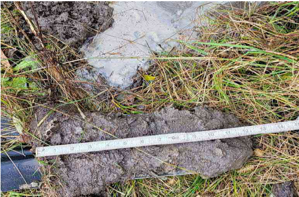
Wetland CIII-2 Soils