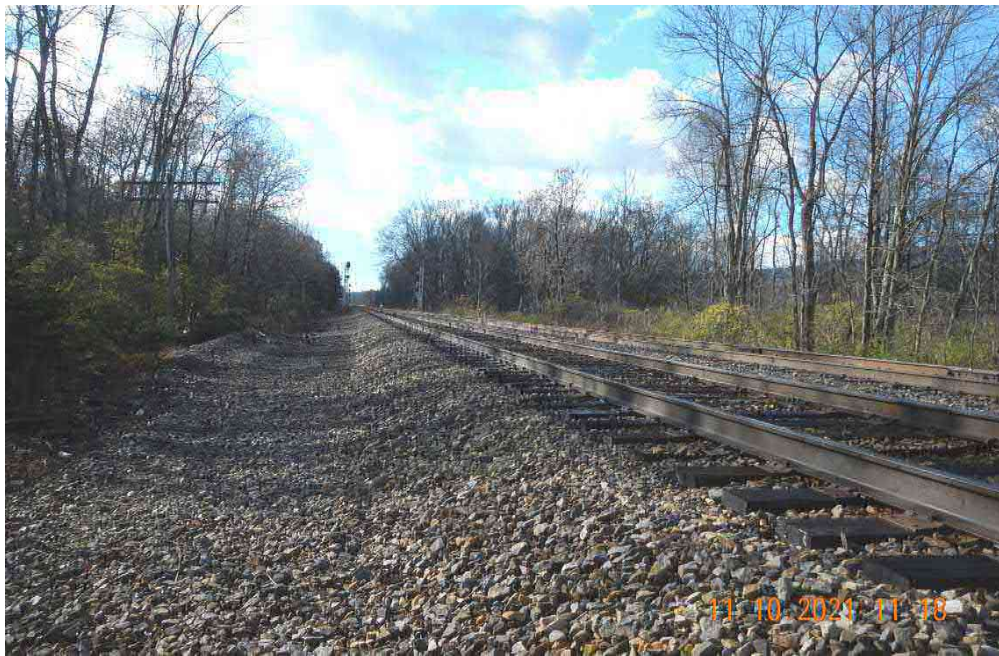
Upland G-R-W- View facing South