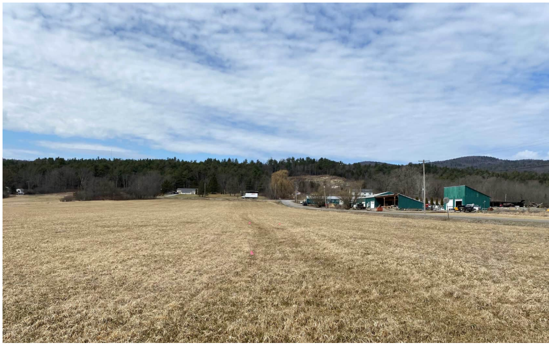
Wetland SA3-1- View facing west