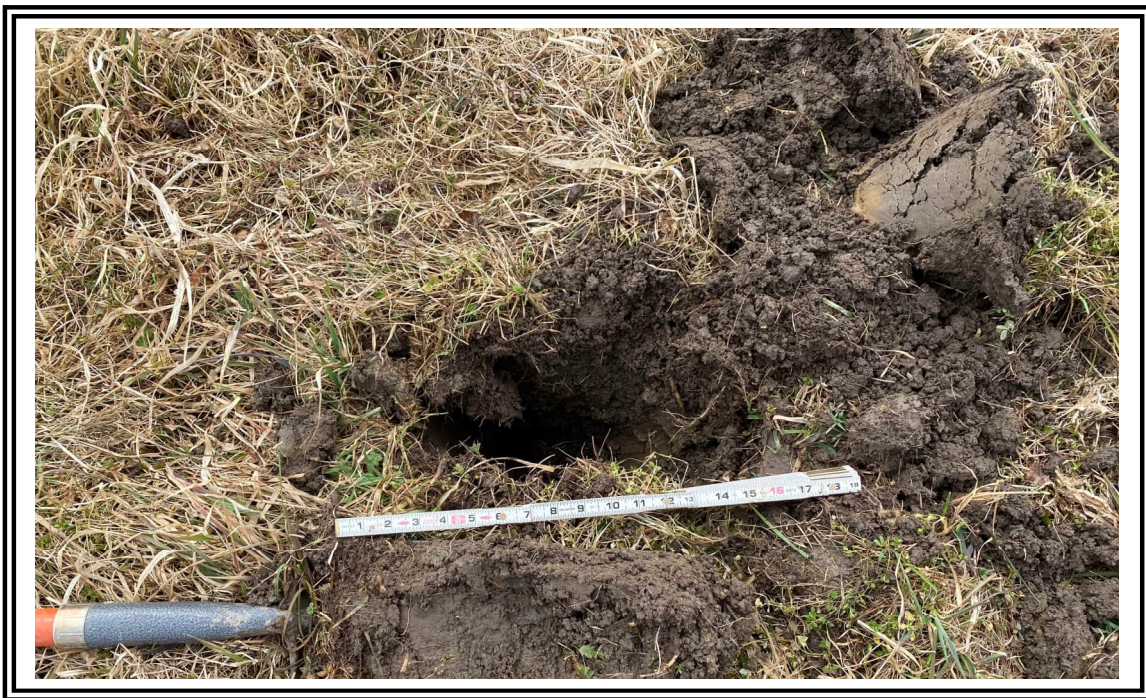
Upland SA2-10, SA3-1 & SA4-2- Soils