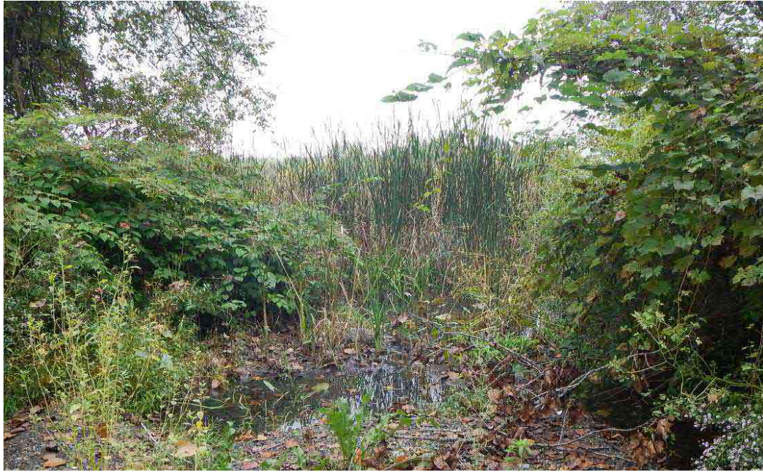
Wetland G-B- View facing Northeast