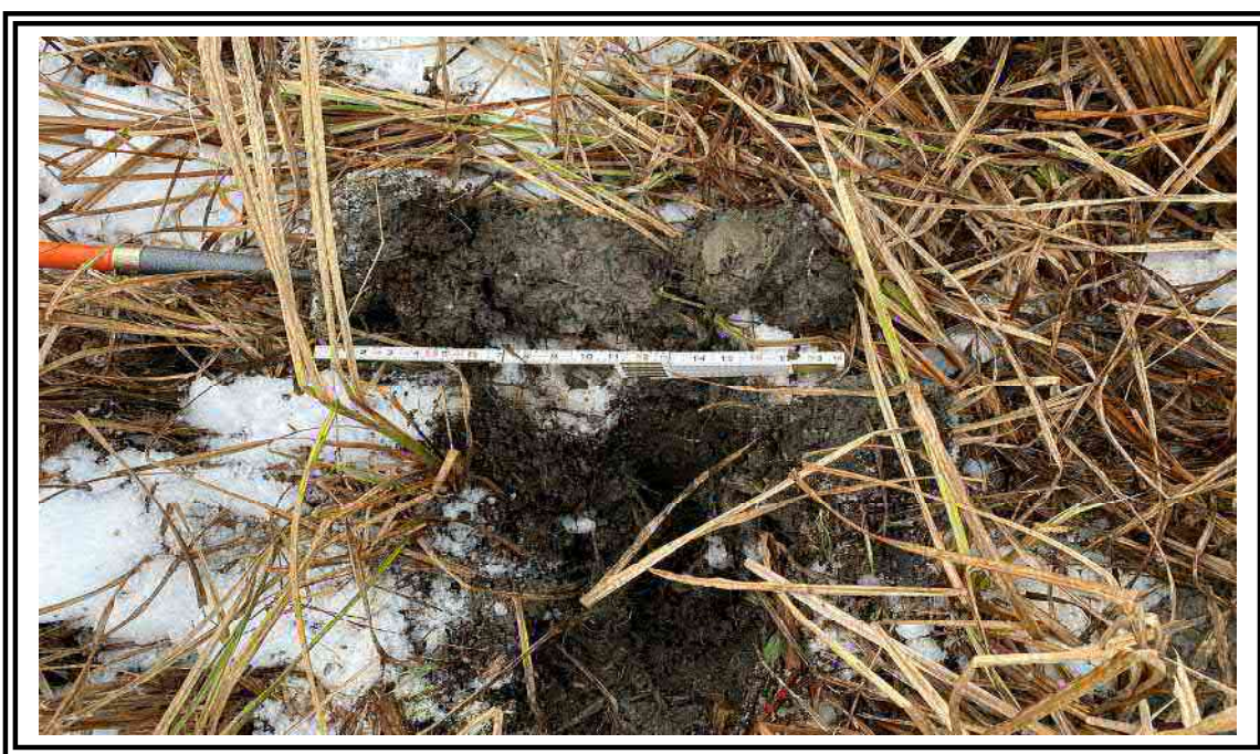
Wetland G-R-X1-AA (PEM) - Soils