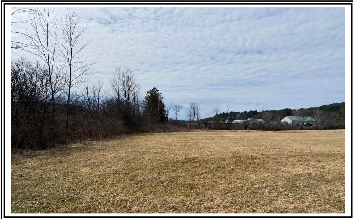
Wetland SA2-10- View facing south