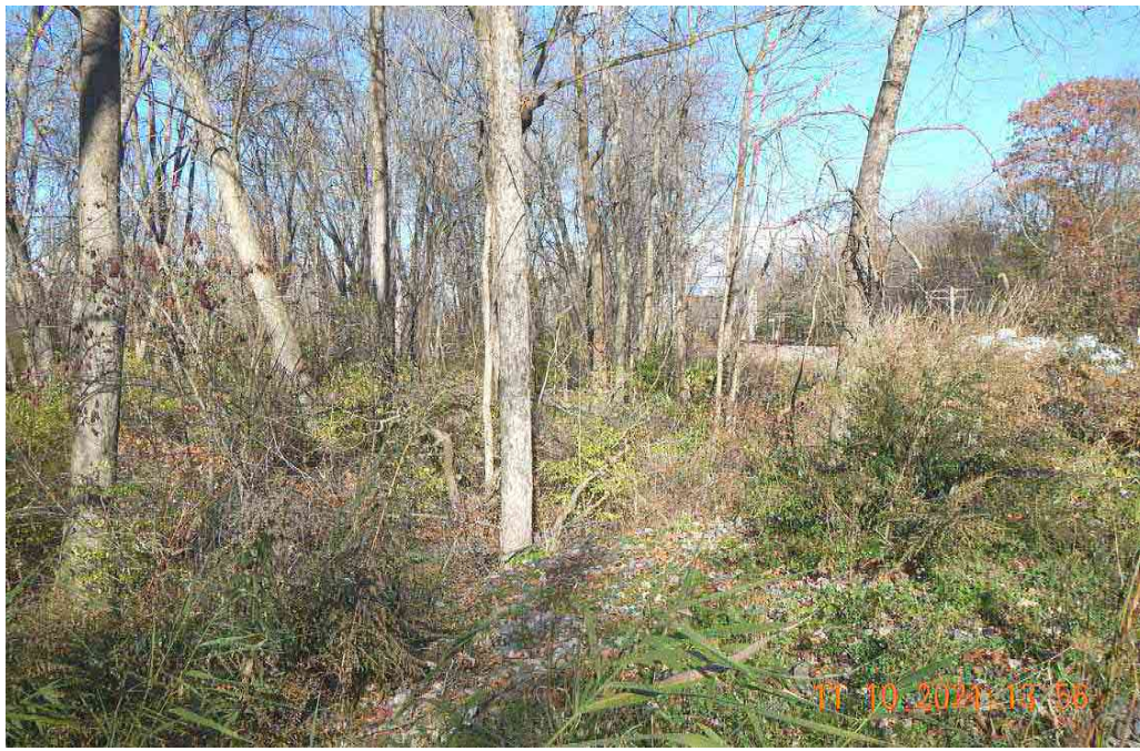
Upland G-R-X- View facing Northeast