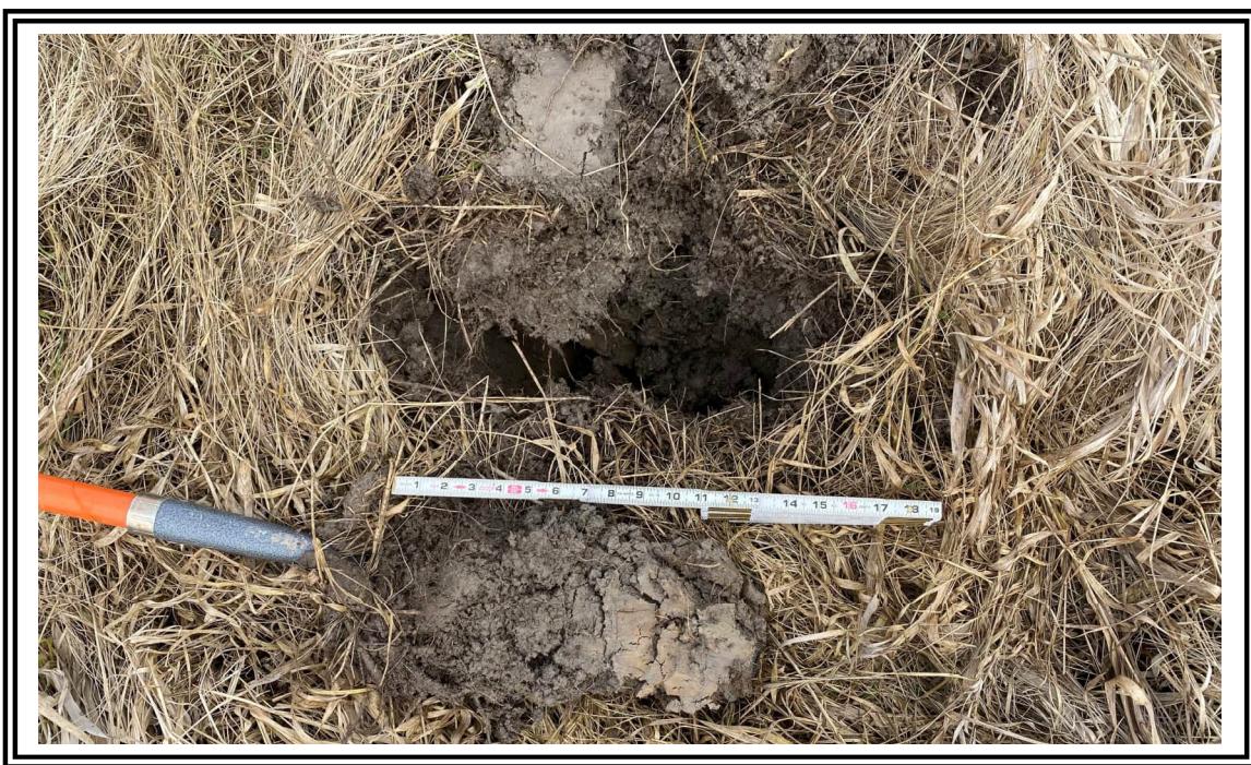
Wetland SA1-11- Soils