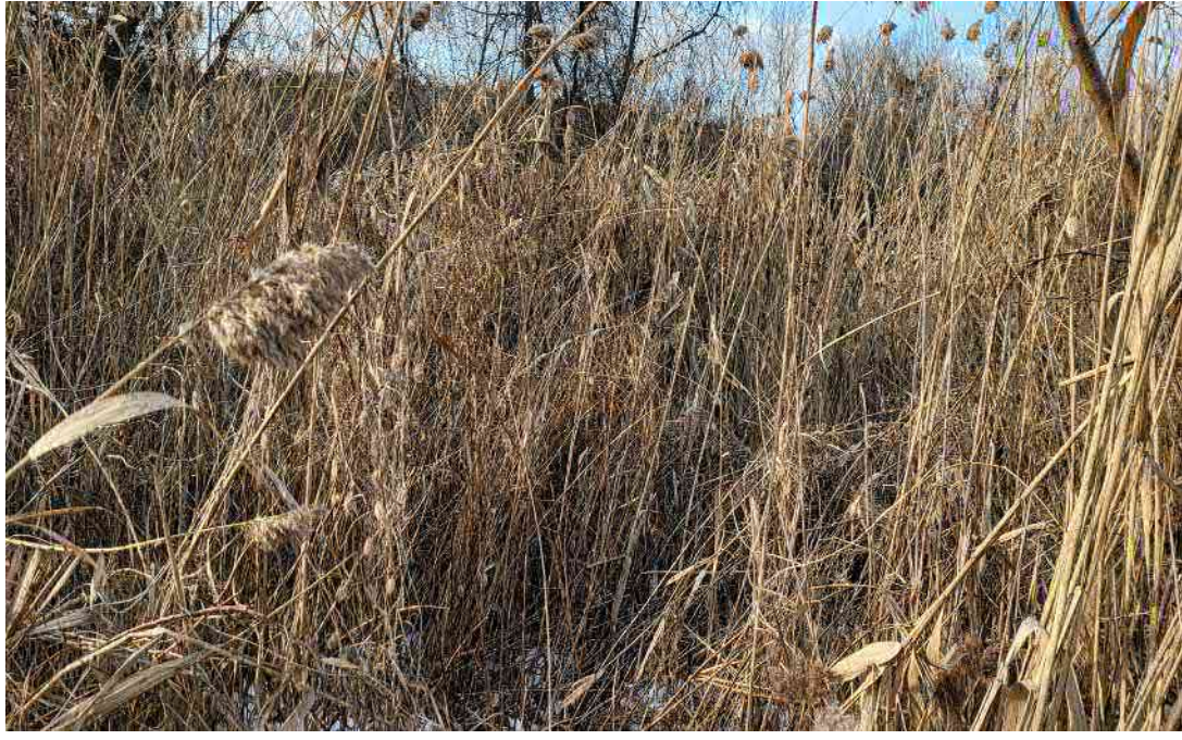
Wetland G-R-X1-TTTT- View facing west.