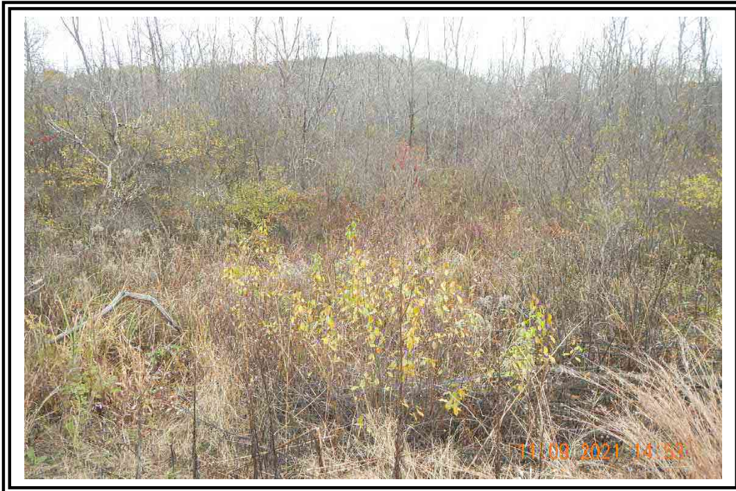
Wetland G-R-U- View facing East