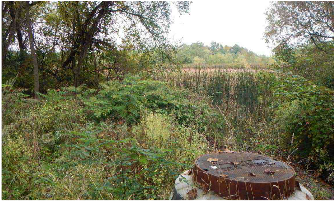
Wetland G-B- View facing Northeast