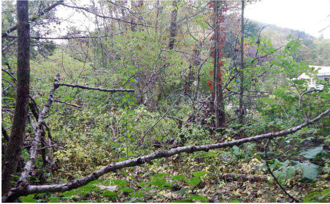
Upland G-A- View facing East