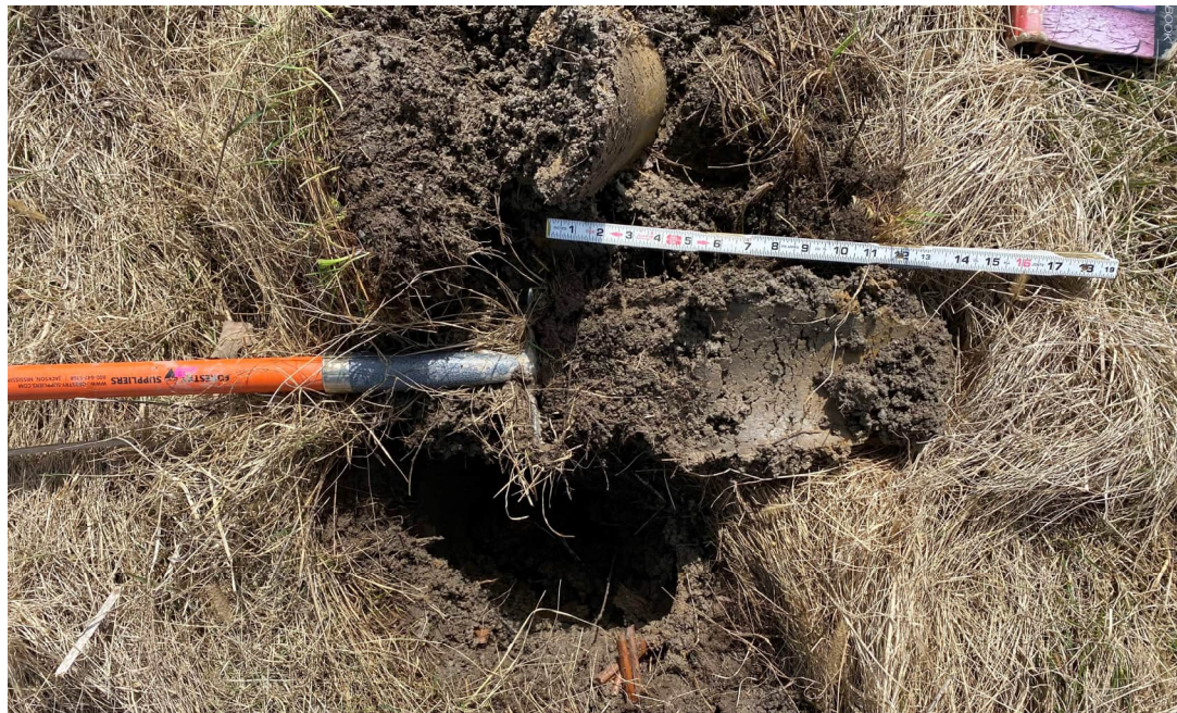
Wetland SA4-2- Soils