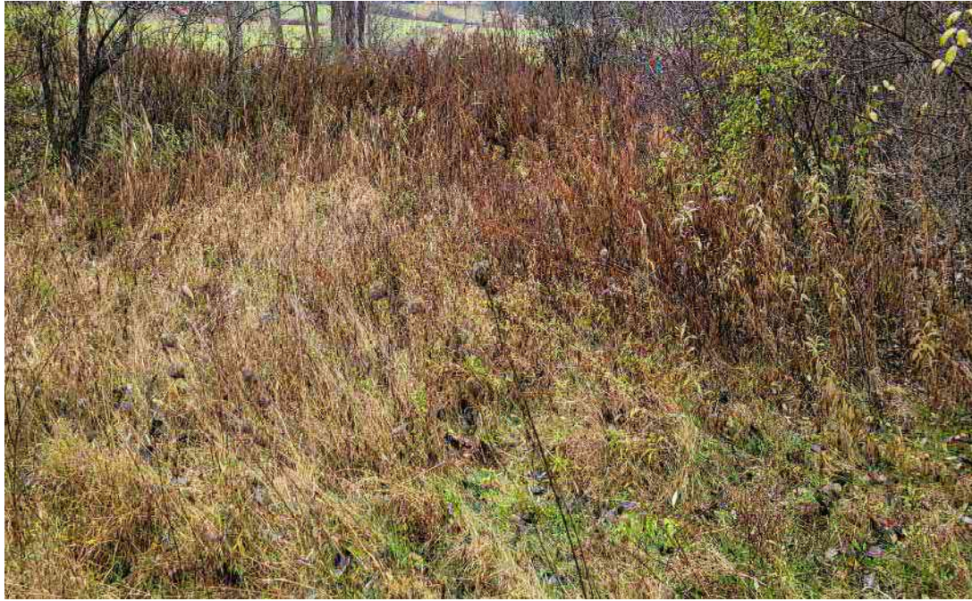
Wetland CIII-2 View facing north