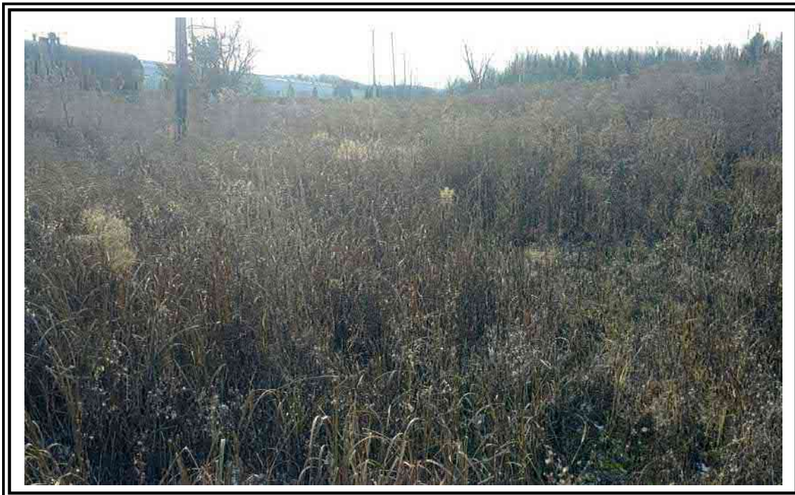
Wetland G-R-X1-SSS - View facing south