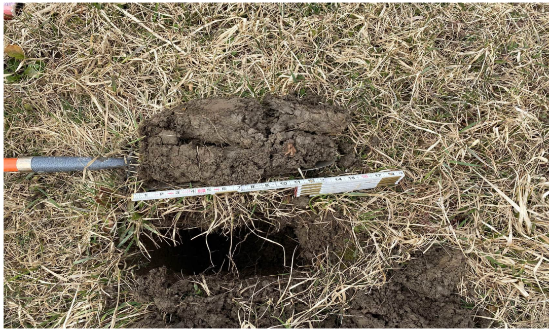
Upland SA1-5- Soils