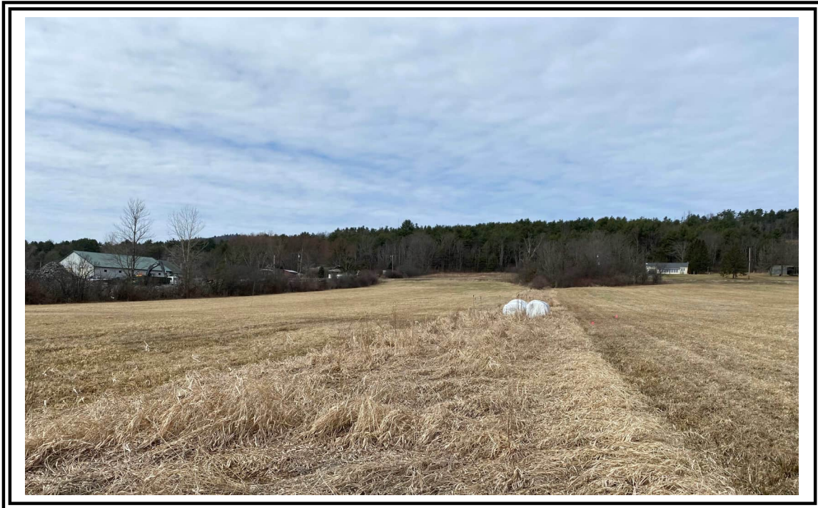
Wetland SA1-11- View facing west