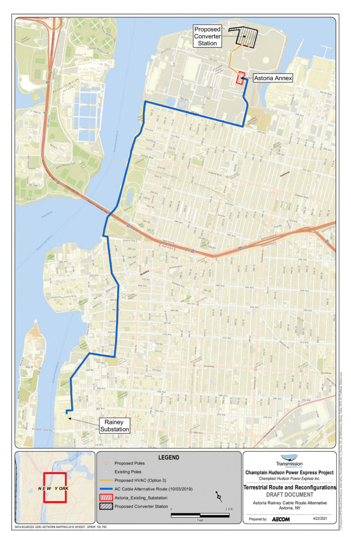
Figure 2: New York City: Astoria Annex.