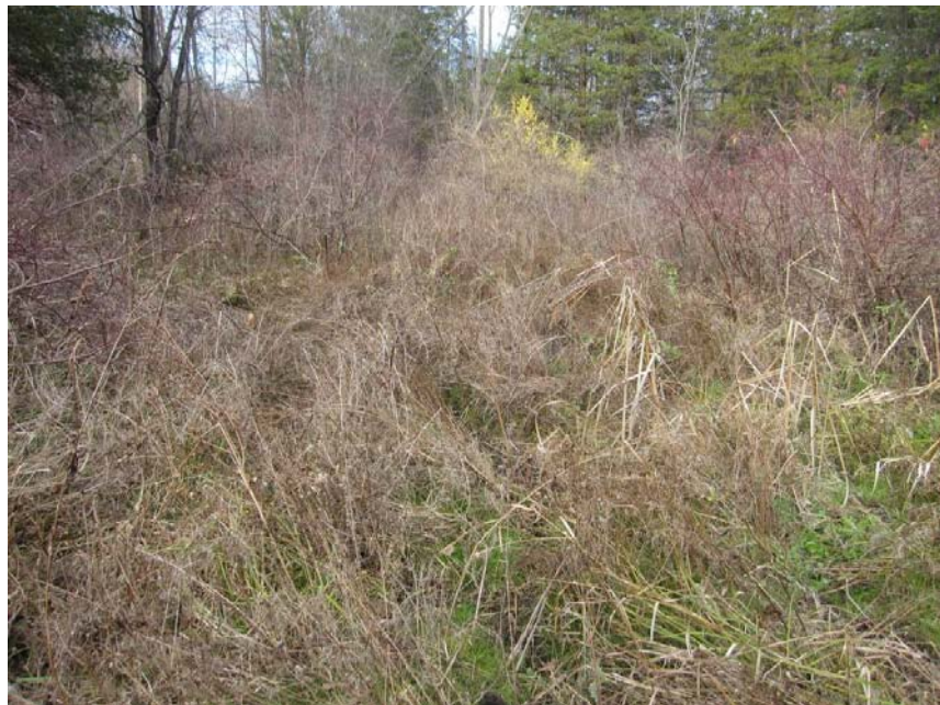
Scrub shrub wetland (M9, Catskill, Greene County)