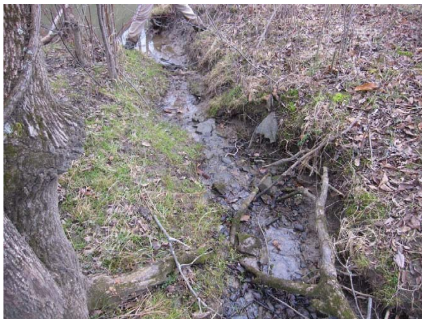
Intermittent stream (MS39, Cossackie, Greene County)