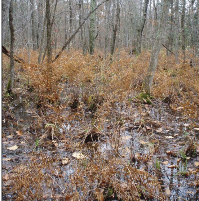
Red maple-hardwood swamp (C15, Ballston, Saratoga County)