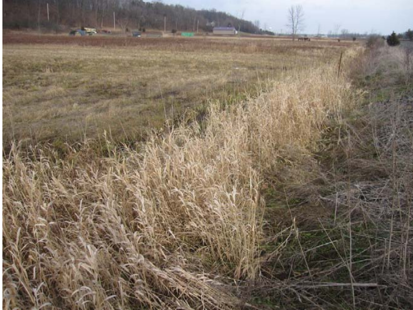
Shallow emergent marsh (M32, Cossackie, Greene County)