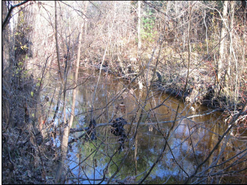
Putnam Brook (B5, Saratoga Springs, Saratoga County)