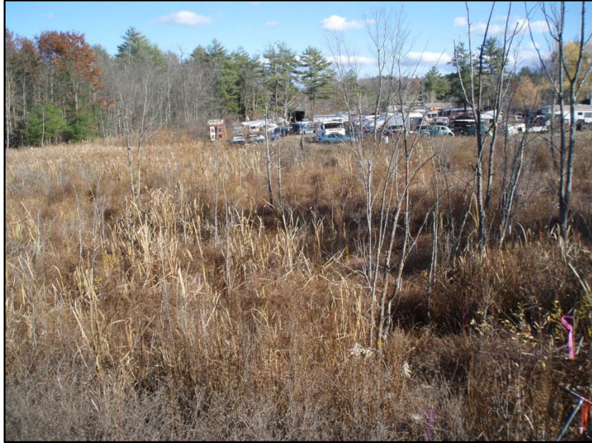
Deep emergent marsh (C23, Clifton Park, Saratoga County)