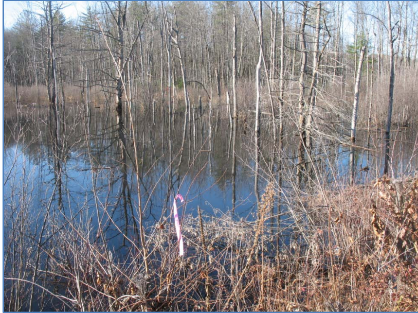
Palustrine open water (D9, Saratoga Springs, Saratoga County)