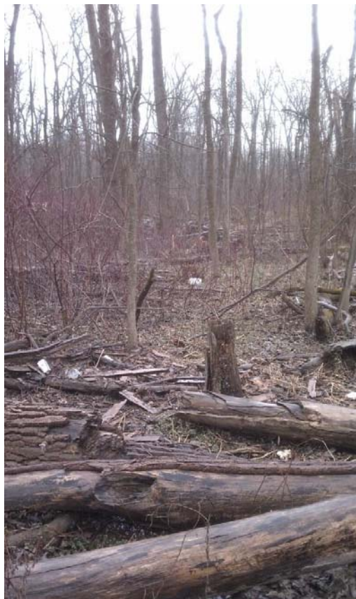
Floodplain forest (M64, Coeymans, Albany County)