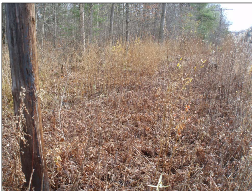
Shallow emergent marsh (C34, Clifton Park, Schenectady County)