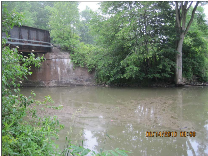
Halfway Creek crossing (F11, Fort Ann, Washington County)