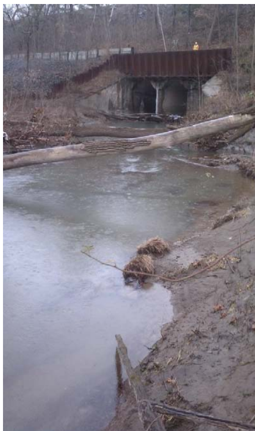
Coeymans Creek (MS65, Coeymans, Albany County)