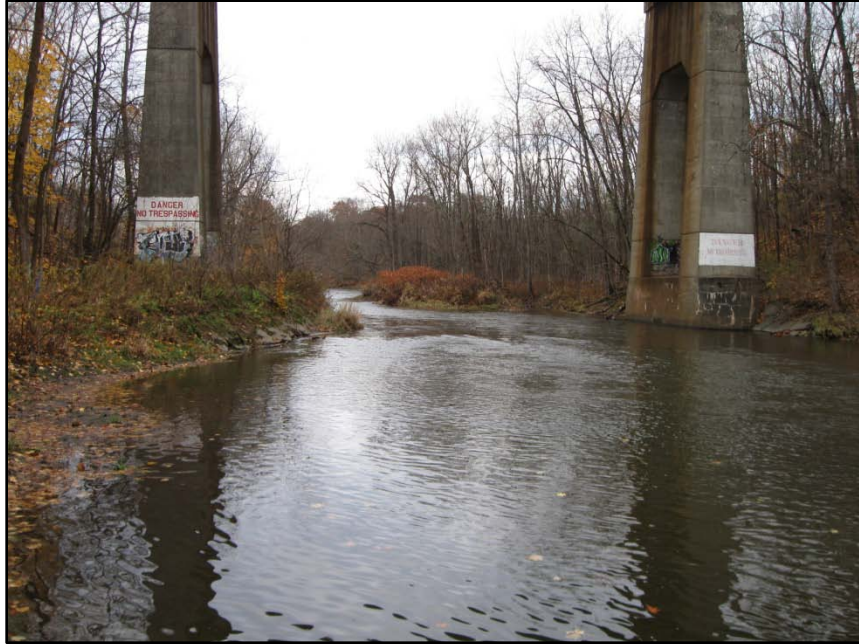
Kayaderosseras Creek crossing (B10, Milton, Saratoga County)