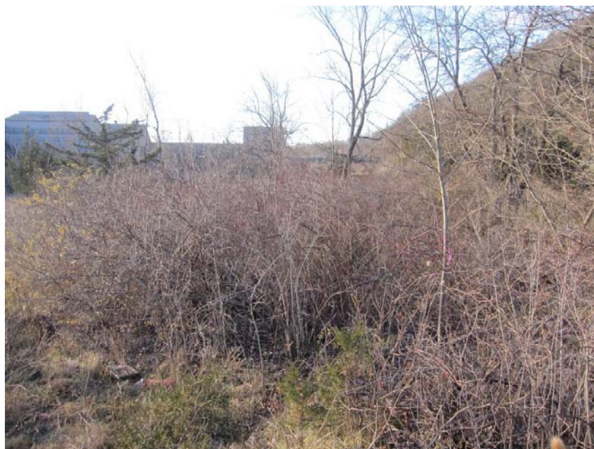
Scrub shrub wetland (M6, Catskill, Greene County)