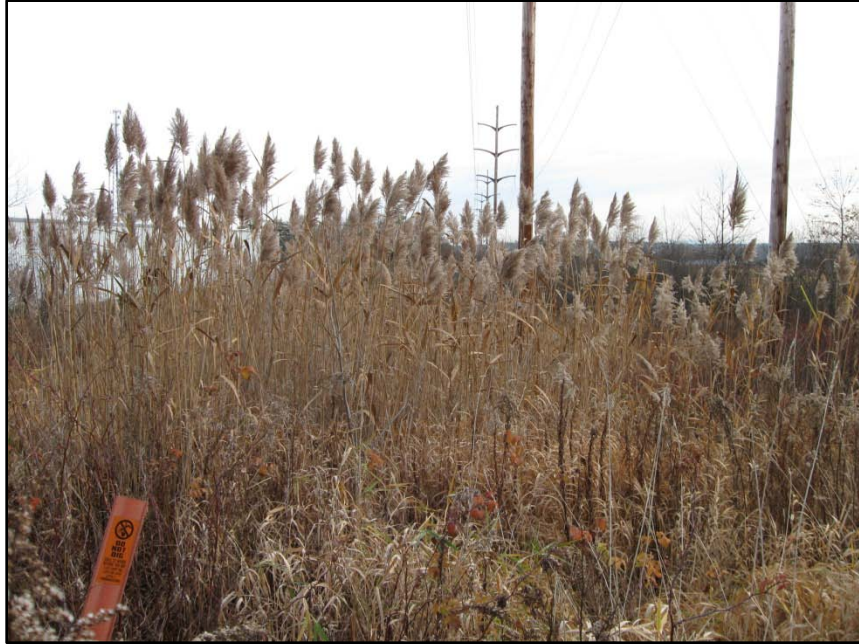
Reedgrass/purple loosestrife marsh (B30, Ballston, Saratoga County)