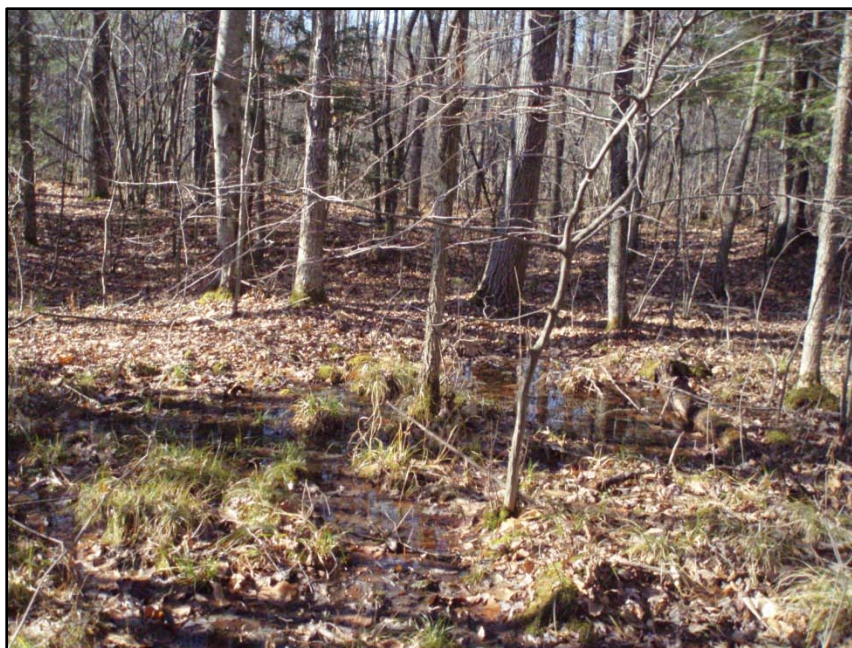
Red maple-hardwood swamp (A49, Northumberland, Saratoga County)