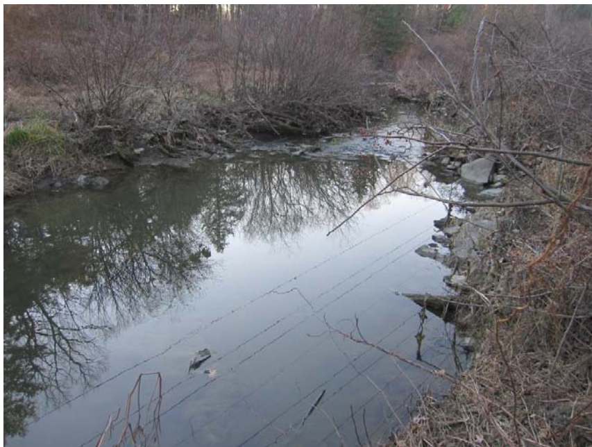
Corlaer Creek (MS30, Athens, Greene County)