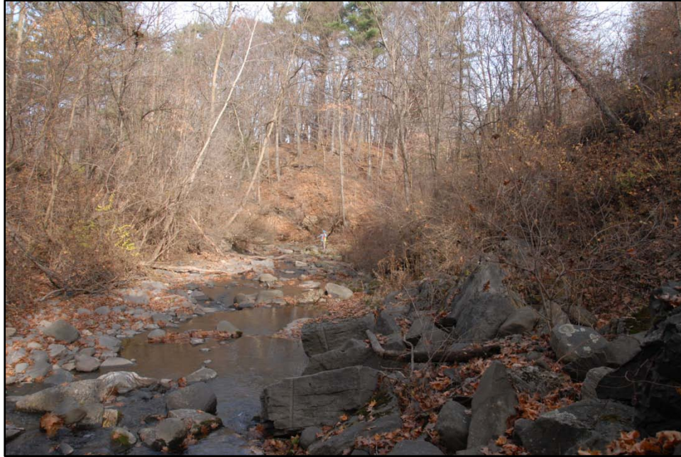
Poentic Kill (C58, Rotterdam, Schenectady County)