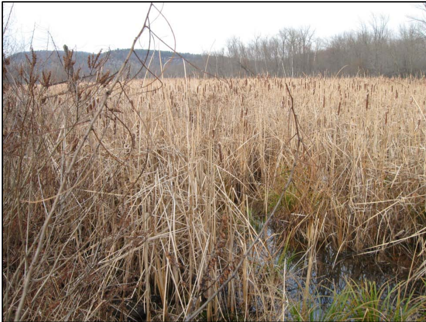
Deep emergent marsh (B56, Whitehall, Washington County)