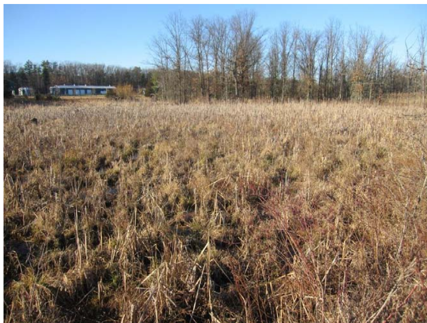
Deep emergent marsh (Y16, Athens, Greene County)