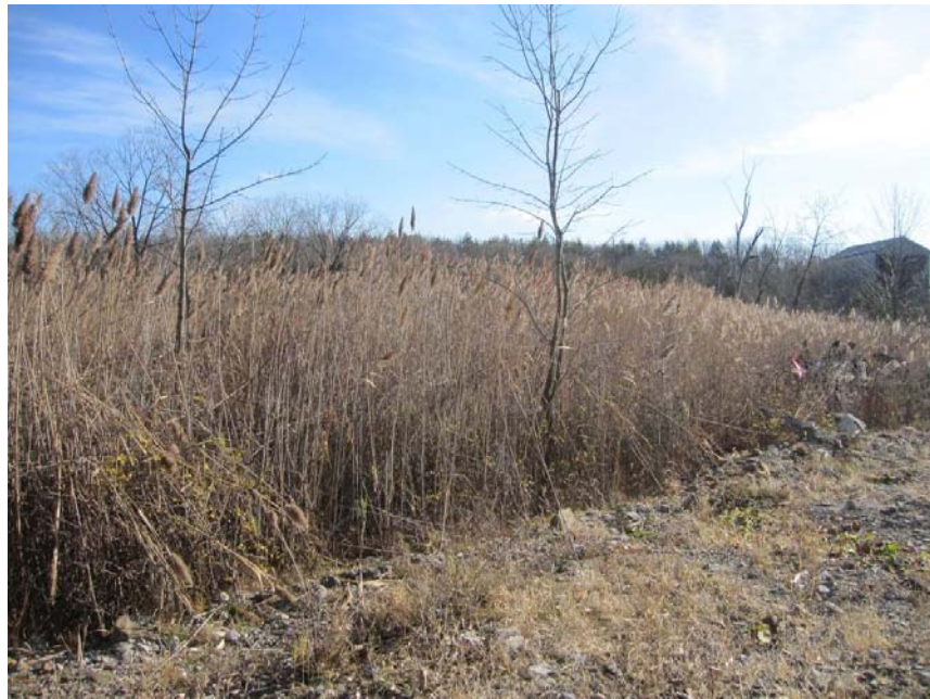
Reedgrass/purple loosestrife marsh (M8, Catskill, Greene County)