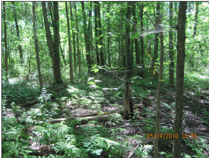
Red maple-hardwood swamp (E96, Guilderland, Albany County)