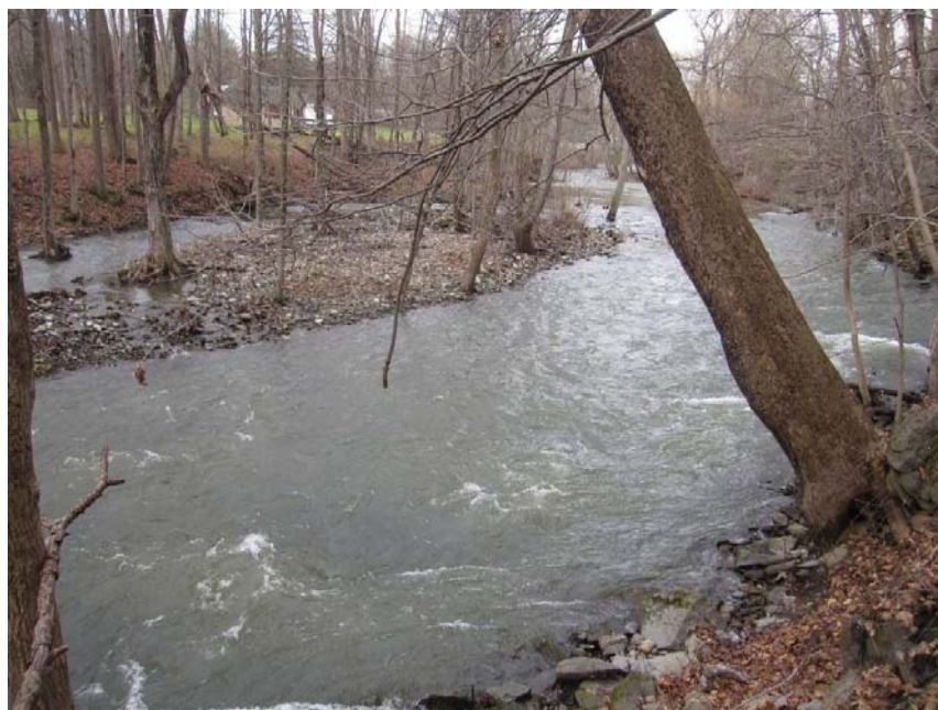
Hannacroix Creek (MS52, New Baltimore, Greene County)