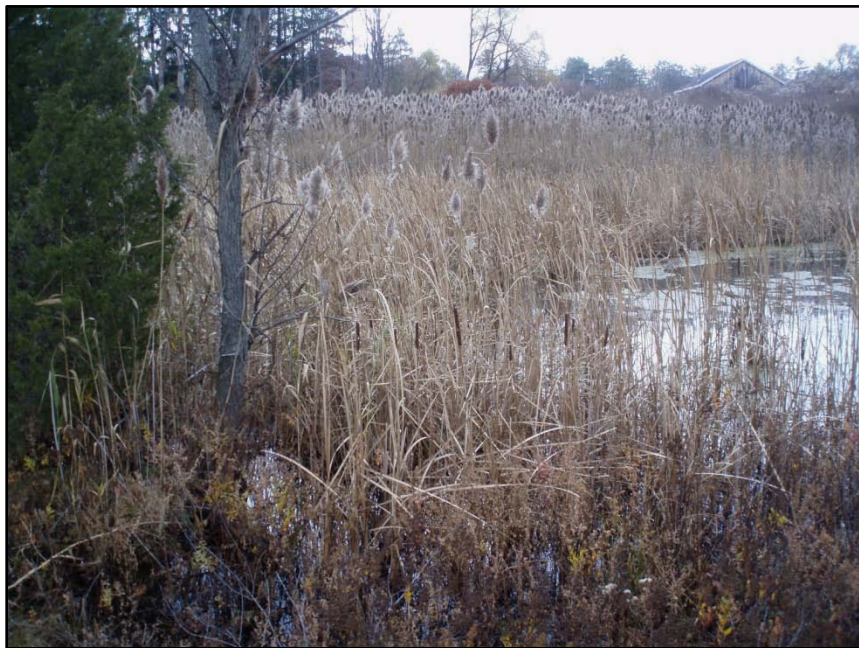
Reedgrass/purple loosestrife marsh (C29, Clifton Park, Saratoga County)