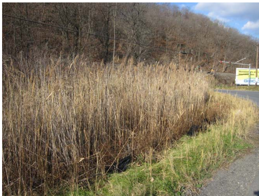
Reedgrass/purple loosestrife marsh (M2, Catskill, Greene County)