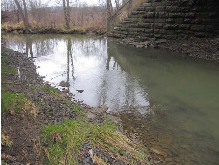
Cossackie Creek (MS37, Cossackie, Greene County)