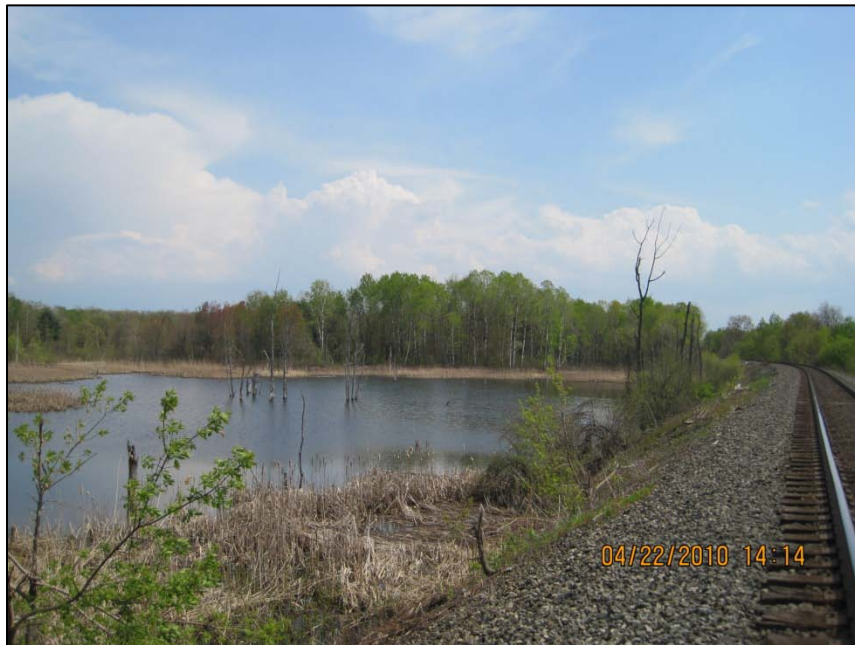
Palustrine open water (E15, Guilderland, Albany County)