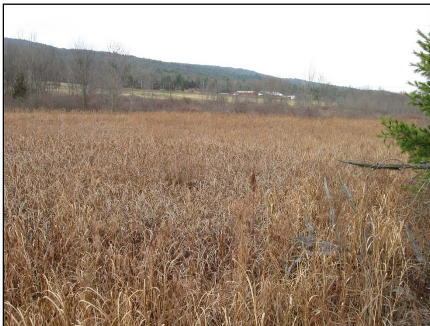
Shallow emergent marsh (B54, Whitehall, Washington County)