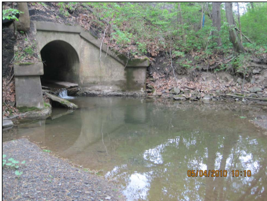
Vloman Kill crossing (E45-2, New Scotland, Albany County)