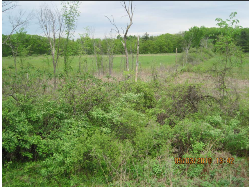
Scrub shrub wetland (E43, New Scotland, Albany County)