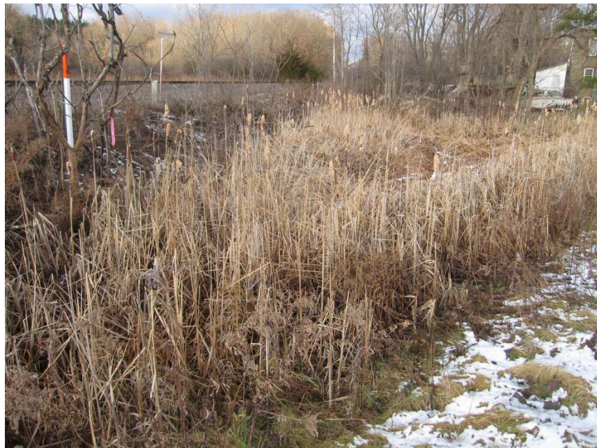
Shallow emergent marsh (M47, New Baltimore, Greene County)