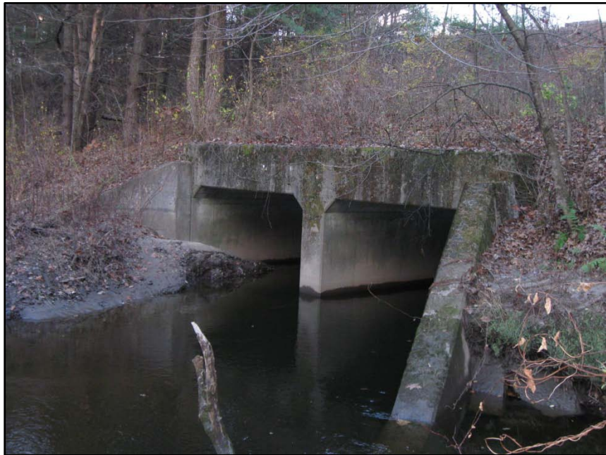
Geyser Brook crossing (B8, Saratoga Springs, Saratoga County)