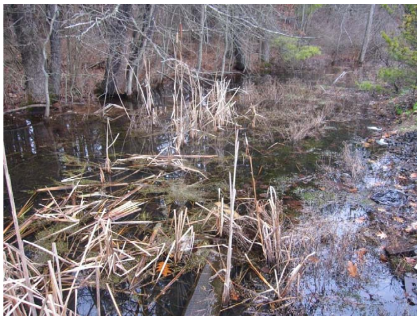
Deep emergent marsh (M36, Cossackie, Greene County)