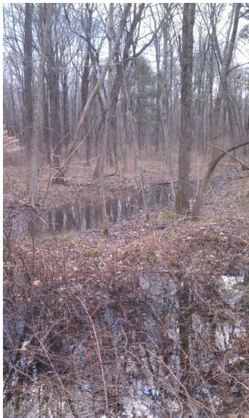
Red maple-hardwood swamp (M69, Coeymans, Albany County)