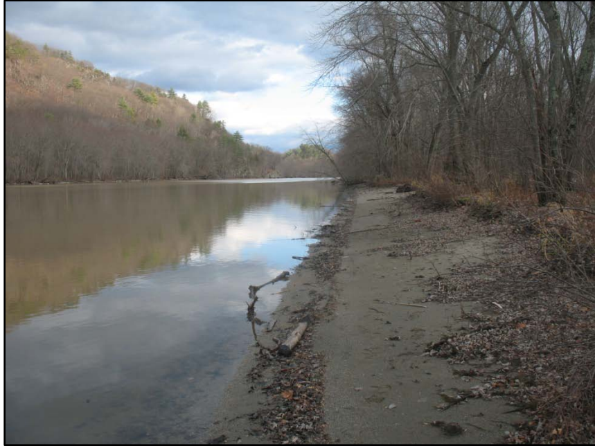
Champlain Canal (D10, Whitehall, Washington County)