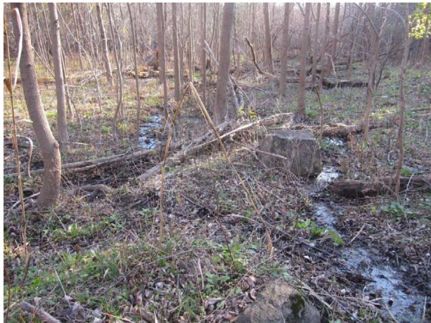
Silver maple-ash swamp (M1, Catskill, Greene County)