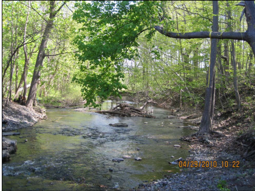
Vly Creek (E30, New Scotland, Albany County)