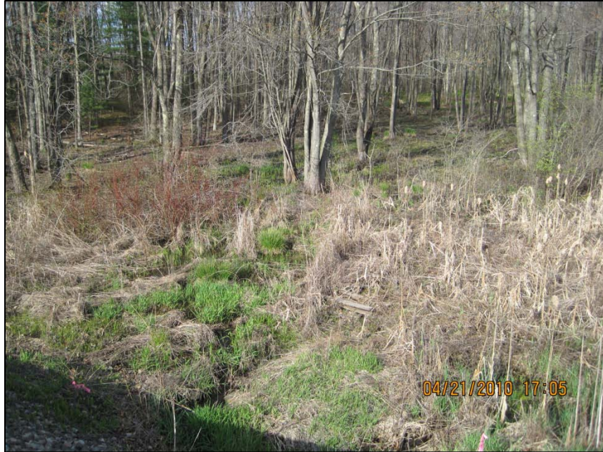
Shallow emergent marsh (E10, Guilderland, Albany County)