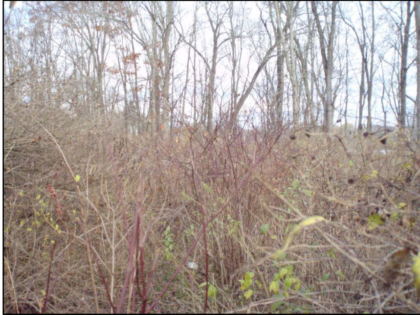
Scrub shrub wetland (A22, Moreau, Saratoga County)