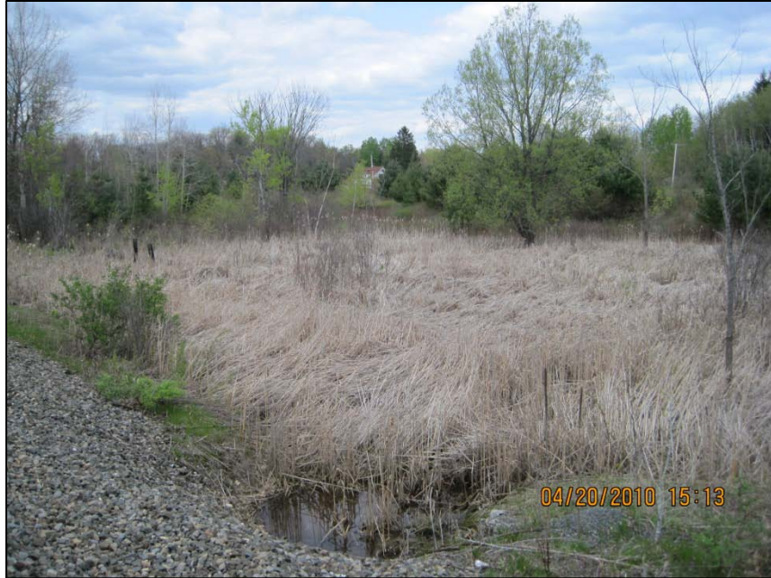
Reedgrass/purple loosestrife marsh (E8, Rotterdam, Schenectady County)