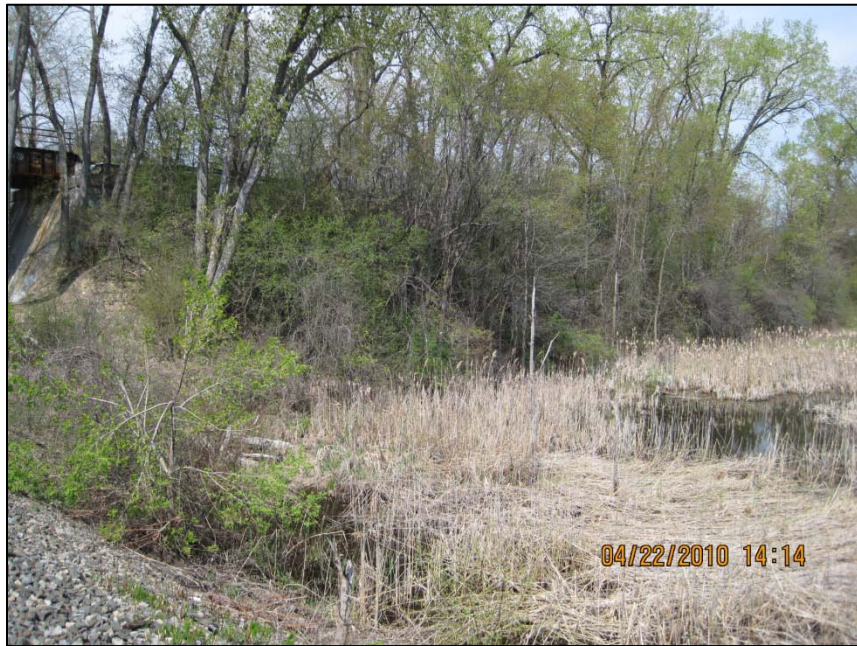
Deep emergent marsh (E15, Guilderland, Albany County)