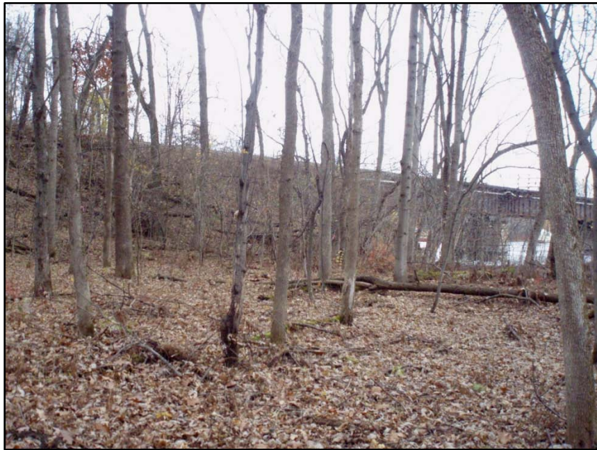
Floodplain forest (A12, Moreau, Saratoga County)