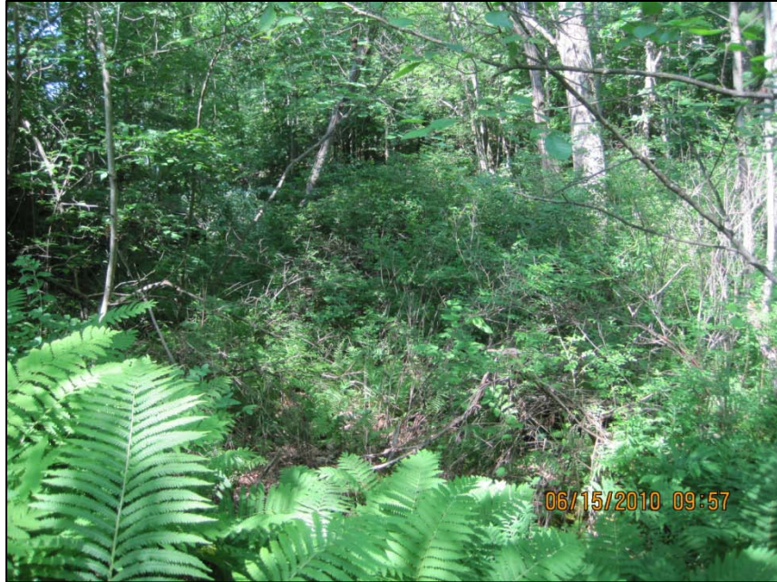
Silver maple-ash swamp (Fort Ann, Washington County)