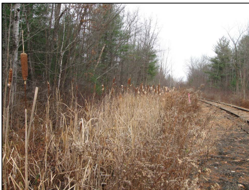
Ditch/artificial intermittent stream (B20, Ballston, Saratoga County)