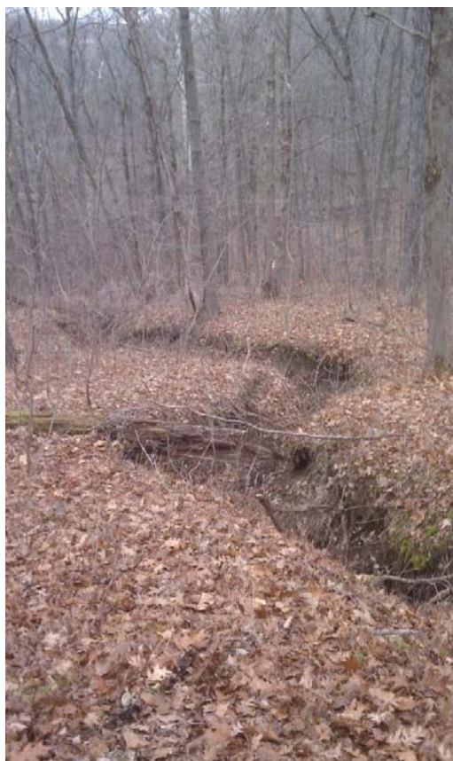
Intermittent stream (MS62, Coeymans, Albany County)