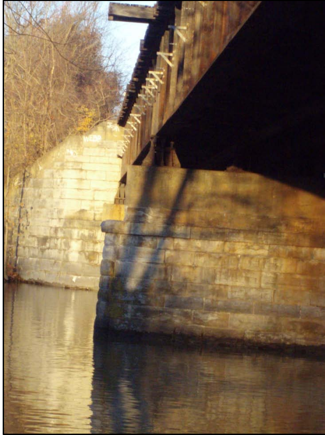
Hudson River crossing (A11, Fort Edward, Washington County & Moreau, Saratoga County)