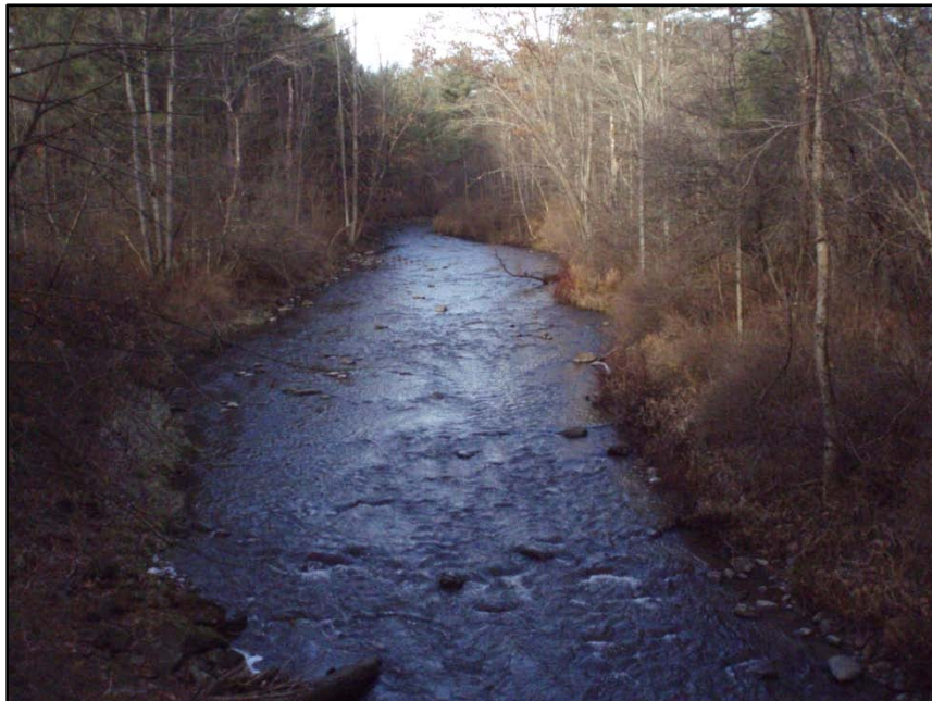
Snook Kill (A42, Northumberland, Saratoga County)