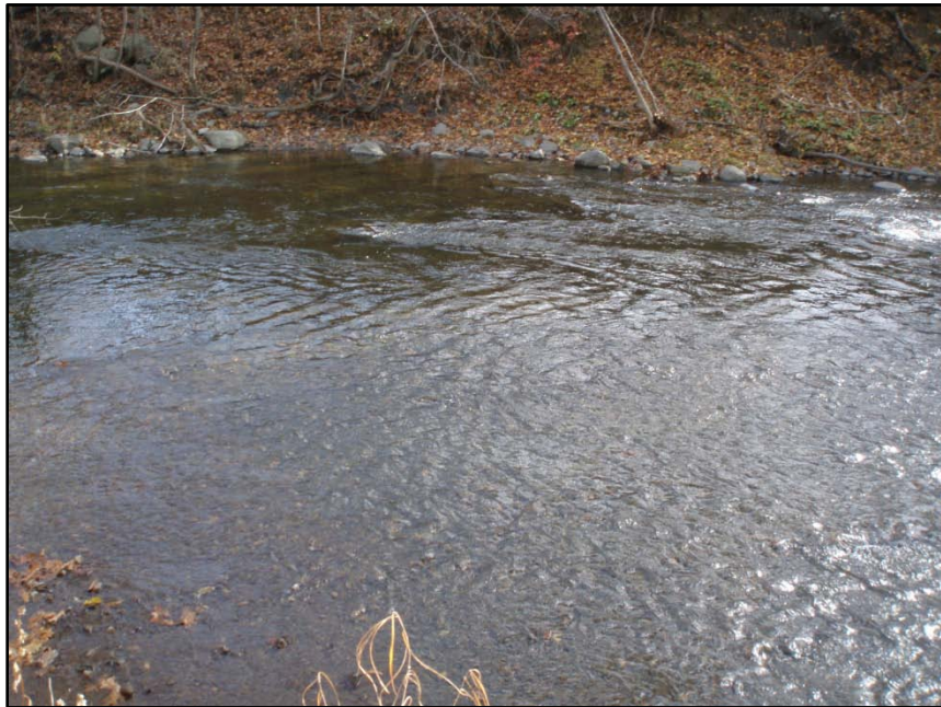
Aplaus Kill (C33, Glenville, Schenectady County)