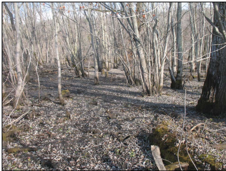
Floodplain forest (D10, Whitehall, Washington County)