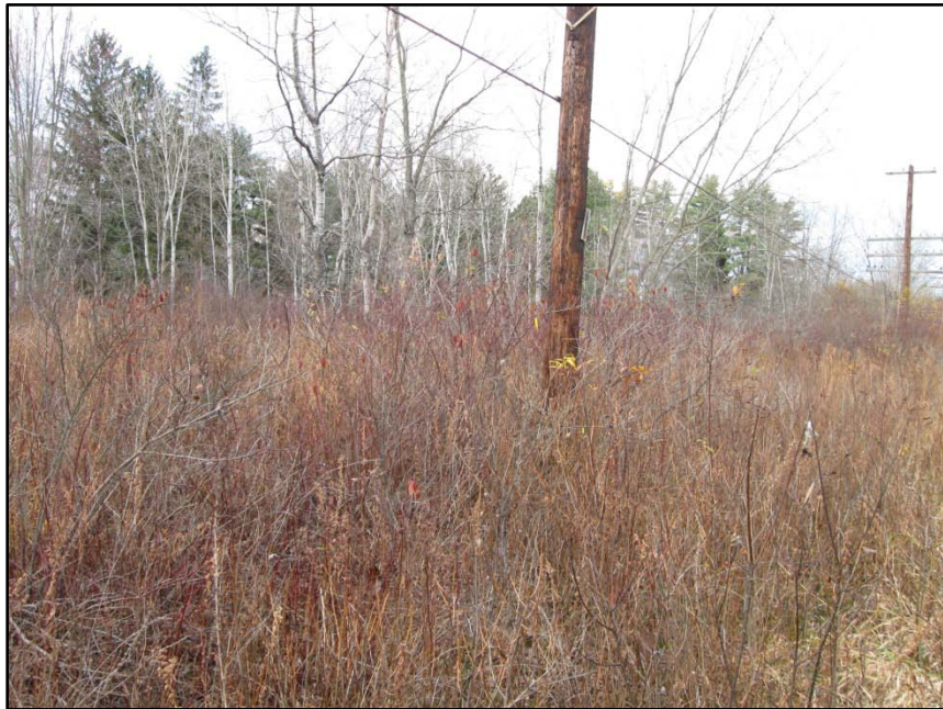
Scrub shrub wetland (B6, Saratoga Springs, Saratoga County)