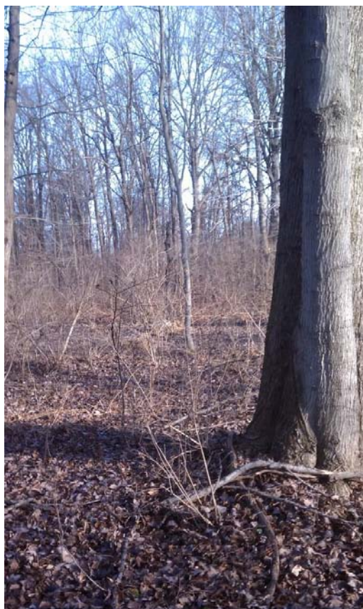
Red maple-hardwood swamp (M70, Bethlehem, Albany County)