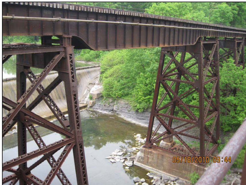
Norman Kill crossing (E74, Guilderland, Albany County)