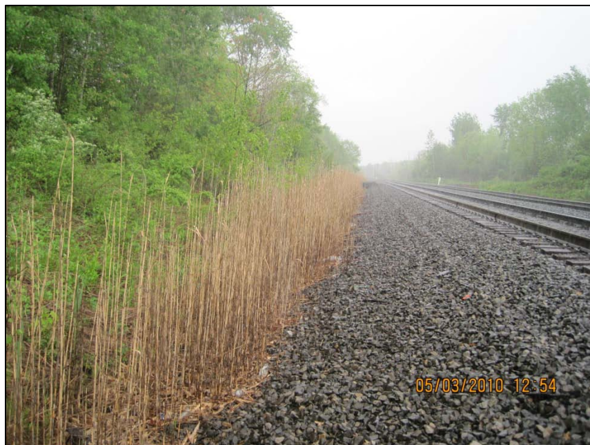
Ditch/artificial intermittent stream (E41, New Scotland, Albany County)